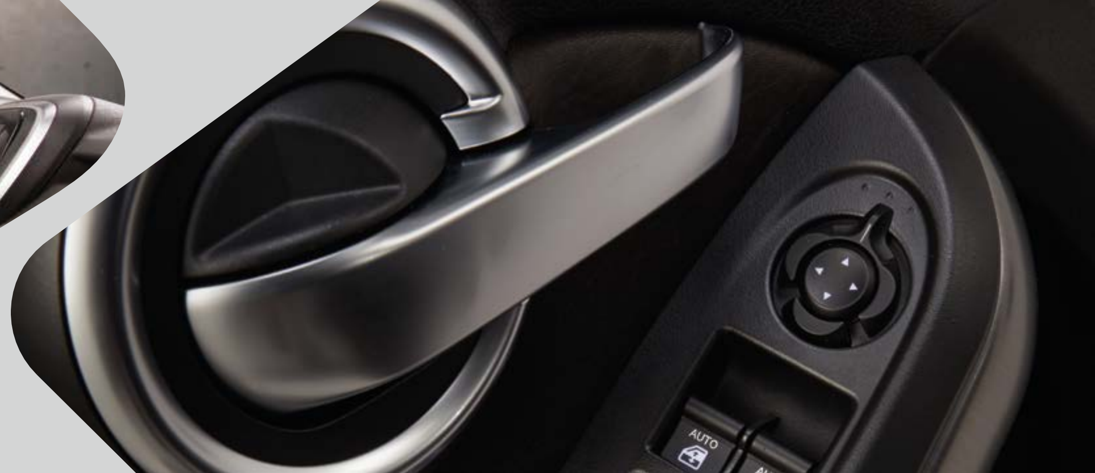
FIAT® 500X Lounge interior shown in Dark Brown/Gray Premium Cloth

Seating and trims are offered in a variety of cloth and leather options. Available heated front seats with power 8-way and 4-way driver adjustable lumbar and a heated steering wheel make mundane trips a thing of the past.