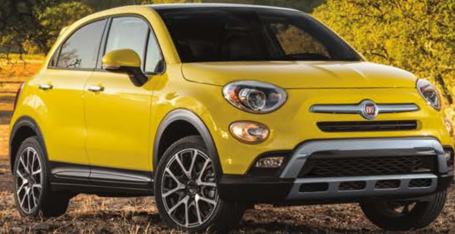
Fiat® 500X Trekking Plus shown in Giallo Amalfi Tristrato

FIAT® 500X features an available 2.4L, 180 horsepower Tigershark® MultiAir®2 engine, 9-speed transmission and Euro-tuned suspension. Its Dynamic Control Selector lets you dial in a honed vehicle response with a choice of Auto, Sport and Traction Plus modes.