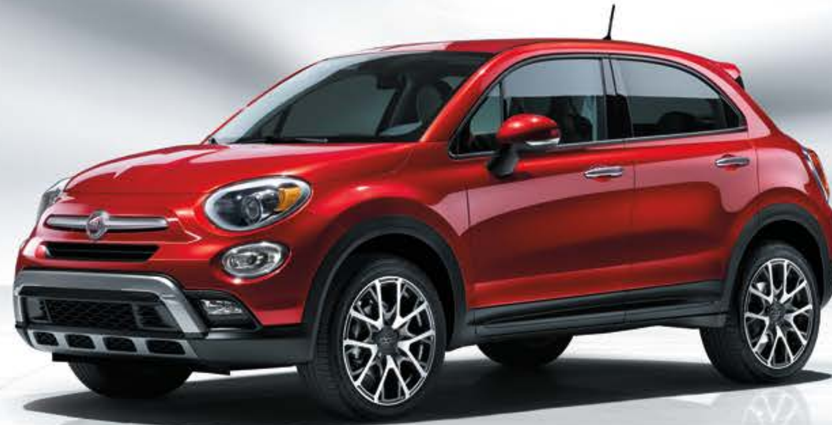
FIAT® 500X Lounge shown in Grigio Arte and Trekking Plus shown in Rosso Passione