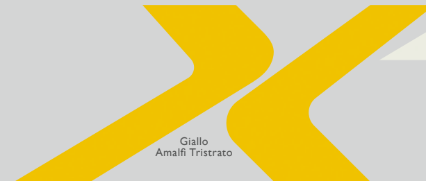
Giallo Amalfi Tristrato