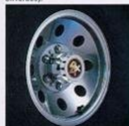
Optional aluminum wheels.