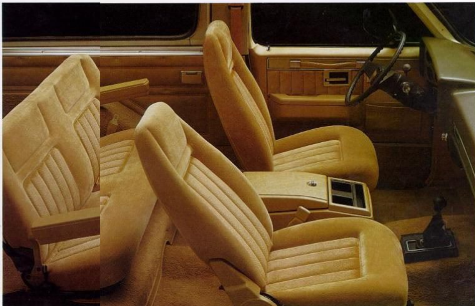
Optional Silverado interior trim in Saddle with Custom Cloth.

Full-size Blazer is impressive, whether you need riding comfort, cargo capacity or a tough combination of both.