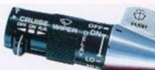
Optional electronic speed control and intermittent wipers are on the standard multi-function lever.