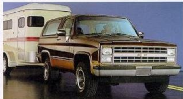
Full-Size Blazer with Special Two-Tone paint. A properly equipped Blazer can move up to 12,000 lbs., including vehicle, trailer, passengers, cargo and equipment.

The 1988 Full-Size Blazer is carefully designed and built to resist corrosion, so the application of additional rustproofing is neither necessary nor required. Chevrolet's confidence in its extensive anti-corrosion protection is reflected in a new-truck warranty which includes 6-year/100,000-mile rust-through protection. See your dealer for terms and conditions of the limited warranty.