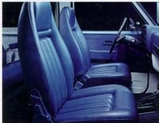
Standard (Custom Deluxe) interior with Custom Vinyl.

bucket, it automatically slides forward to provide passage, then returns easily to position.