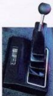
Transfer case shift lever with 2WD/4x4 indicator.