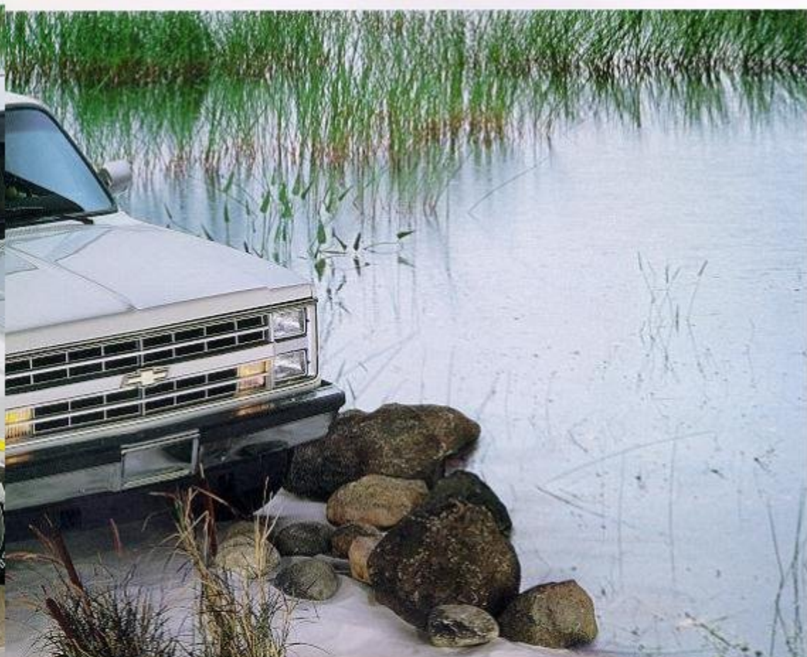
Full-Size Blazer in Frost White with optional Silverado trim. Tires supplied by various manufacturers.