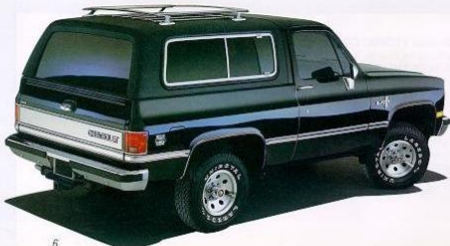
Full-size Blazer in Black, shown with the following optional items: Silverado trim, luggage rack (dealer-installed), deep-tinted windows, sliding rear side windows, power rear window, white-letter tires and aluminum wheels. Tires supplied by various manufacturers.

*1987 ratings. See your dealer for 1988 ratings. (A) Produced in U.S. and Canada.