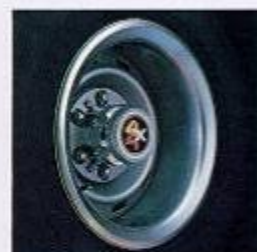
Optional Rally Wheels (standard on Silverado).