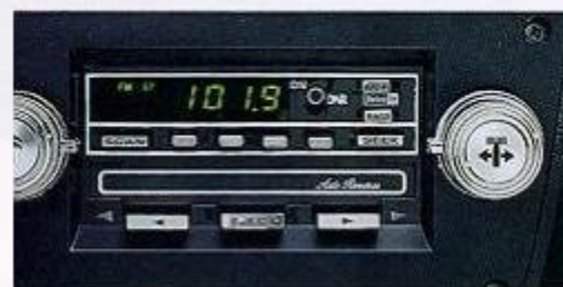
Optional Delco AM/FM stereo radio with cassette tape player, Seek and Scan and digital clock.