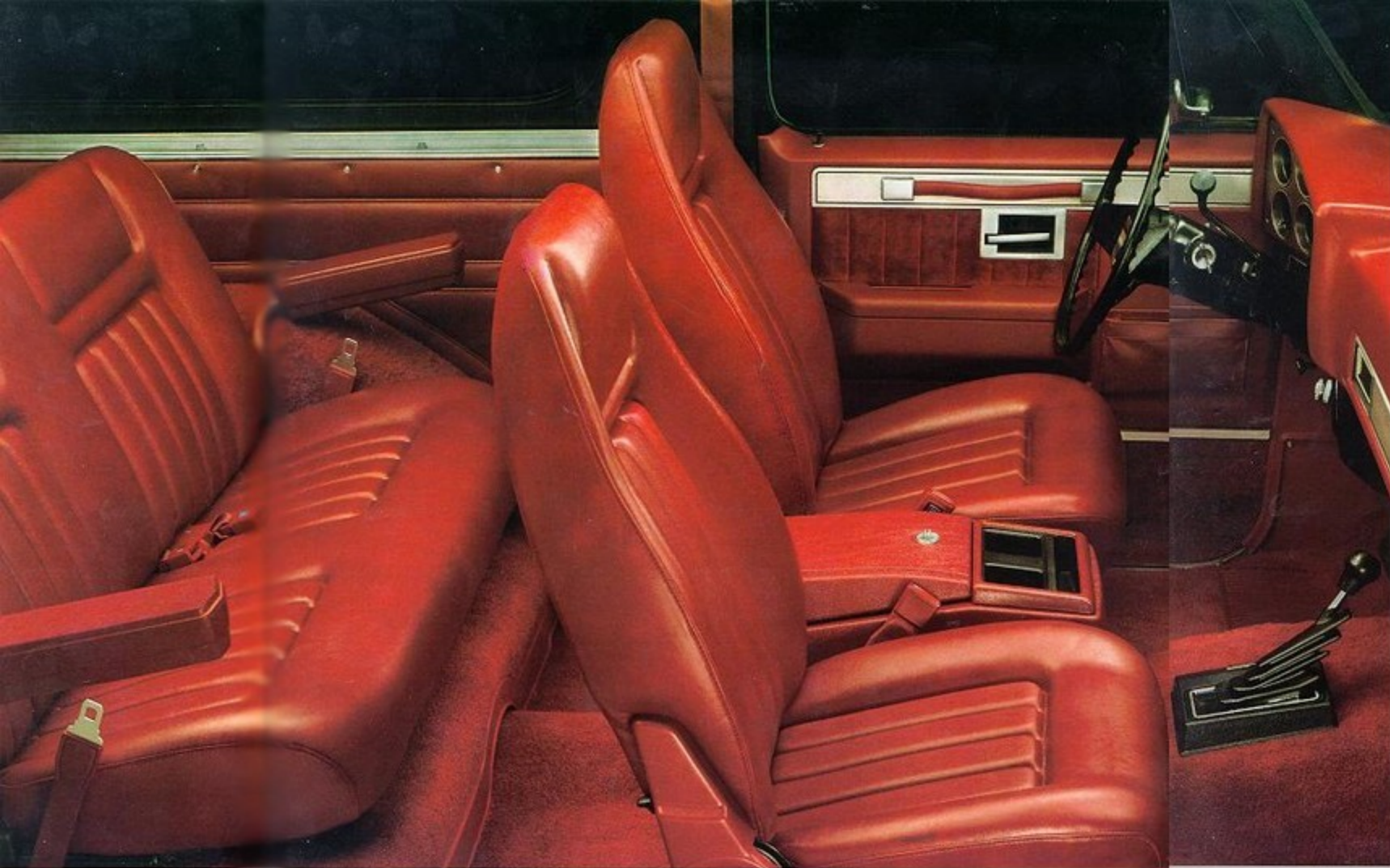
The optional Silverado interior, shown in Burgundy Custom Vinyl.