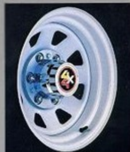
Optional styled wheels.

*Gas. *Both Gas and Diesel. *32 gallon for diesel models.