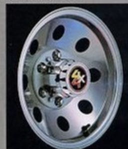
Optional forged aluminum wheels.