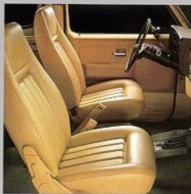
The standard Custom Deluxe interior, shown in Saddle vinyl.

Note: Optional rear passenger seats will match front seat trim. ■ Standard ■ Optional ■ Not Available