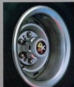
Optional Rally Wheels.