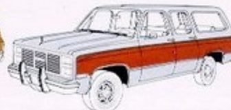
Available Exterior Decor Package