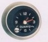
Quartz electric clock