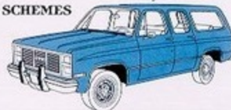
Standard Solid Paint Scheme