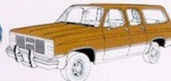
Available Special Two-Tone