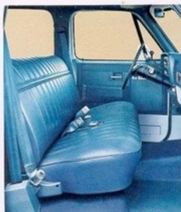
Sierra standard interior comes in Blue or Saddle Tan vinyl.