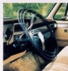
Comfortilt steering wheel