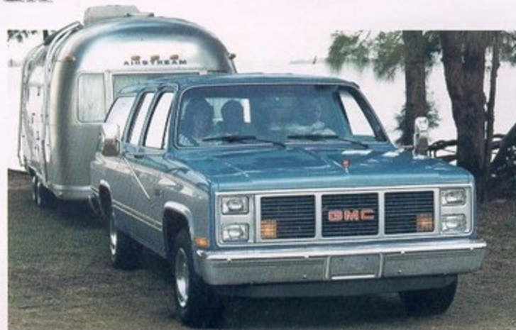
C-2500 Suburban with 7.4 Liter V8 gas engine is in a trailering class by itself! (See below)