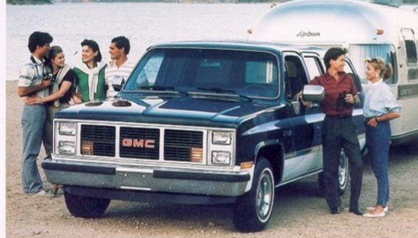
Sierra Classic Suburban with available equipment