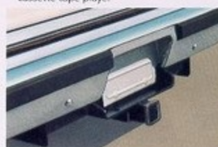
Platform trailer hitch (requires Trailering Special Equipment)