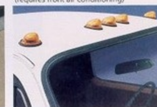
Roof marker lamps