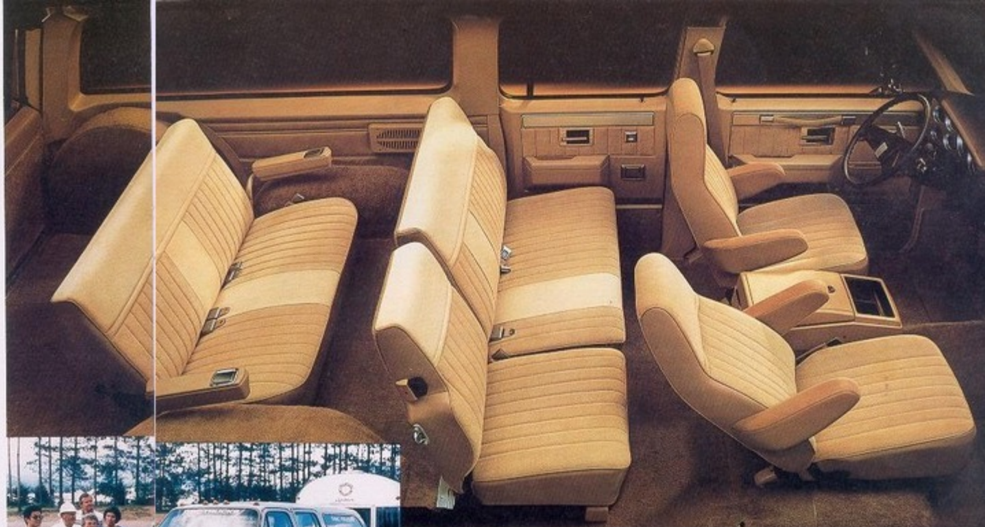
Sierra Classic with available seating

Beginning September, 1985 nearly 200 senior North Americans are planning to travel the backroads of mainland China on an unprecedented international friendship mission driving GMC Truck Suburbans pulling Airstream trailers.