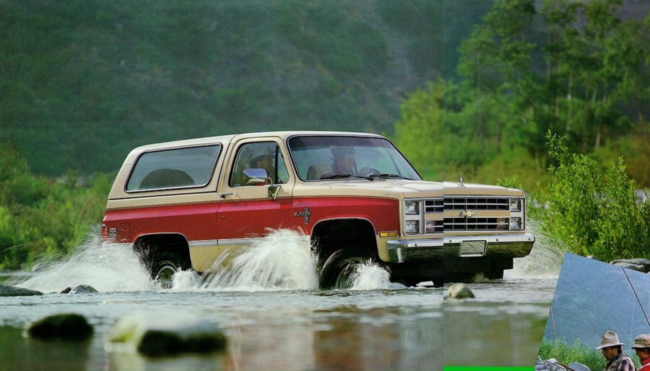
Shown here: Blazer 4x4 Silverado with Exterior Decal Package in Doerskin Tan and Apple Red.