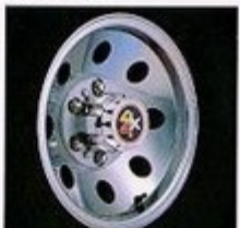
Cast aluminum wheels.