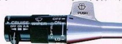
Electronic speed control and intermittent wiper shown on standard multi-function switch.