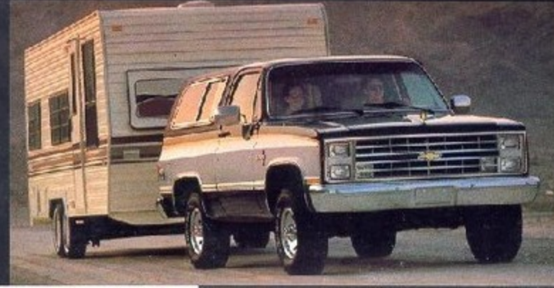
Blazer 4x4 Silverado in Apple Red with standard Frost White top.

If your going calls for towing, full-size Blazer, properly equipped, can move up to 11,000 lbs. worth of vehicle, trailer, cargo, equipment and crew. Shown at left, Blazer 4x4 Silverado with Exterior Door Package in Black and Silver.