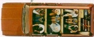
Shown above: Chevy Suburban with available second and third seat.

Double rear doors 40 inches high and nearly 60 inches wide are standard for easy loading of bulky cargo. A wagon-type tailgate can be ordered with either manual or available power window. A wide range of engines is offered, and a 4-wheel-drive version of Suburban can also be ordered with Chevy's full-time 4-wheel drive when the available automatic transmission is specified. Chevrolet's conventional 4-wheel-drive system comes with 4WD Suburbans equipped with 3-speed or 4-speed manual transmissions. Front free-wheeling hubs are standard with conventional 4WD.