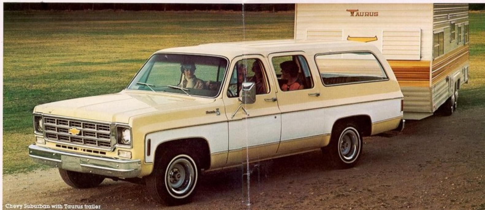
Chevy Suburban with Taurus trailer

The Chevrolet Trucks in this catalog are equipped with GM-built engines produced by various divisions. Please refer to the engine chart included in this catalog or available from your dealer for complete details about engine sources and availability.