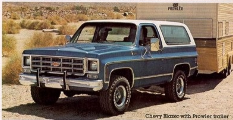
Chevy Blazer with Frowler trailer