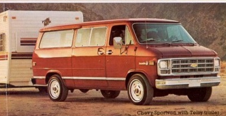
Chevy Sportvan with Terry trailer

Power windows and power door locks are available this year, and a new available fold-up rear seat makes conversion of the rear area quick and easy. Also, the floor area behind the front seat has been lowered for more rear-seat leg room.