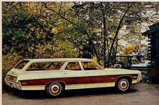
Caprice 3-Seat Estate Wagon with bright wheel opening moldings plus paneling that looks like hand-rubbed walnut.