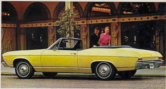
Chevelle Malibu Convertible with new solid glass rear window. Tops are colored black, white or blue.