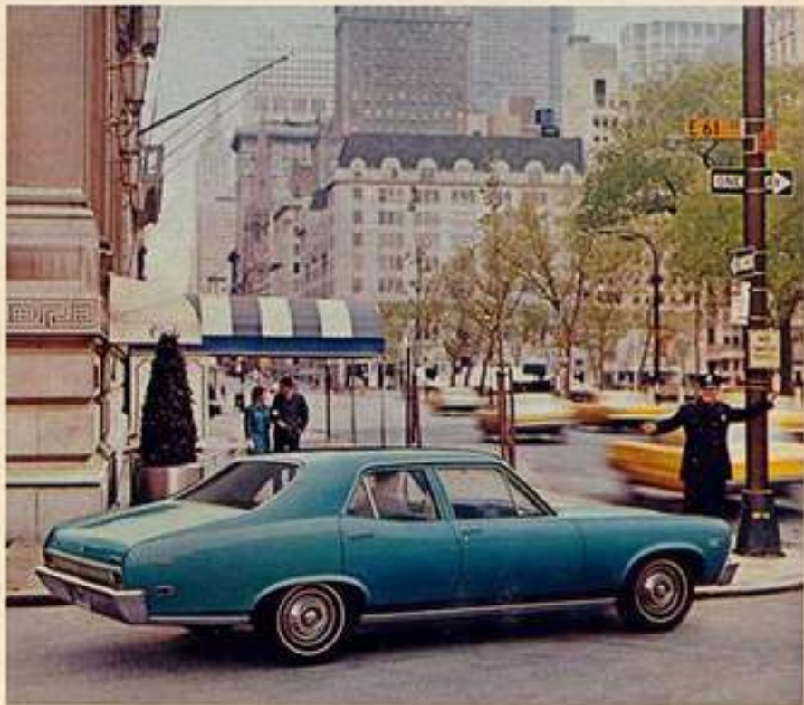
Chevy II Nova 4-Door Sedan seats six. Swept-back roof line, curved side windows and behind-license fuel filler typify hundreds of new '68 features.

Also consider ordering these big-car accessories, now available for Chevy II Nova: stereo tape system; Four-Season air conditioning; special instrumentation; floor-mounted shift lever for standard 3-Speed — with or without center console.