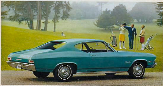
Chevelle 300 Deluxe Sport Coupe shows off new styling and bright trim. Backup lights are integrated in taillight housing.