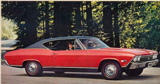
Chevelle SS 396 Sport Coupe. Hide-A-Way windshield wipers are standard for SS 396, Concours and Malibu; can be ordered for other Chevelles. Vinyl top can be ordered in black or white.

To say Chevelle is all new is an understatement . . . it is brilliantly original for '68! Out-of-the-ordinary roof lines, front fenders and taillight arrangements. The latest look in long-hood/short-deck styling. Two wheelbases: 112" for coupes and convertibles; 116" for sedans and wagons. And expansive grilles emphasize wider tread.