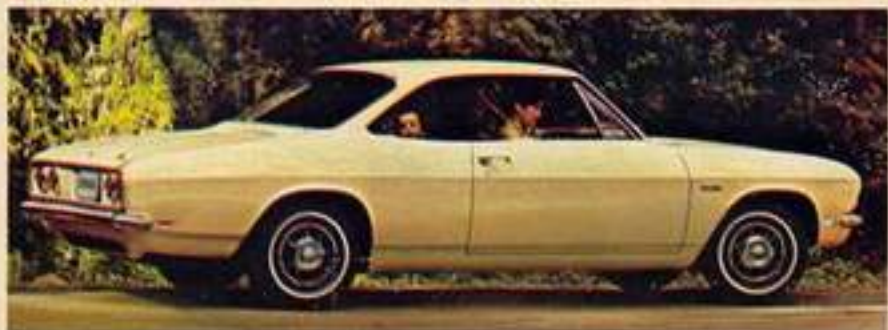
Above: Corvair 500 Sport Coupe has fully independent front and rear coil suspension.