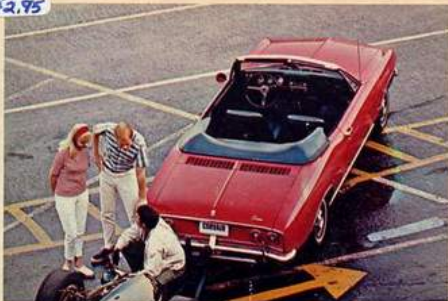
Corvair Monza Convertible. Top available in black, white or blue.

Another thing: now you can order a rear window defroster on Corvair sport coupes for the first time. Customize Corvair even more with sports-styled steering wheel, electric clock, AM-FM pushbutton radio.