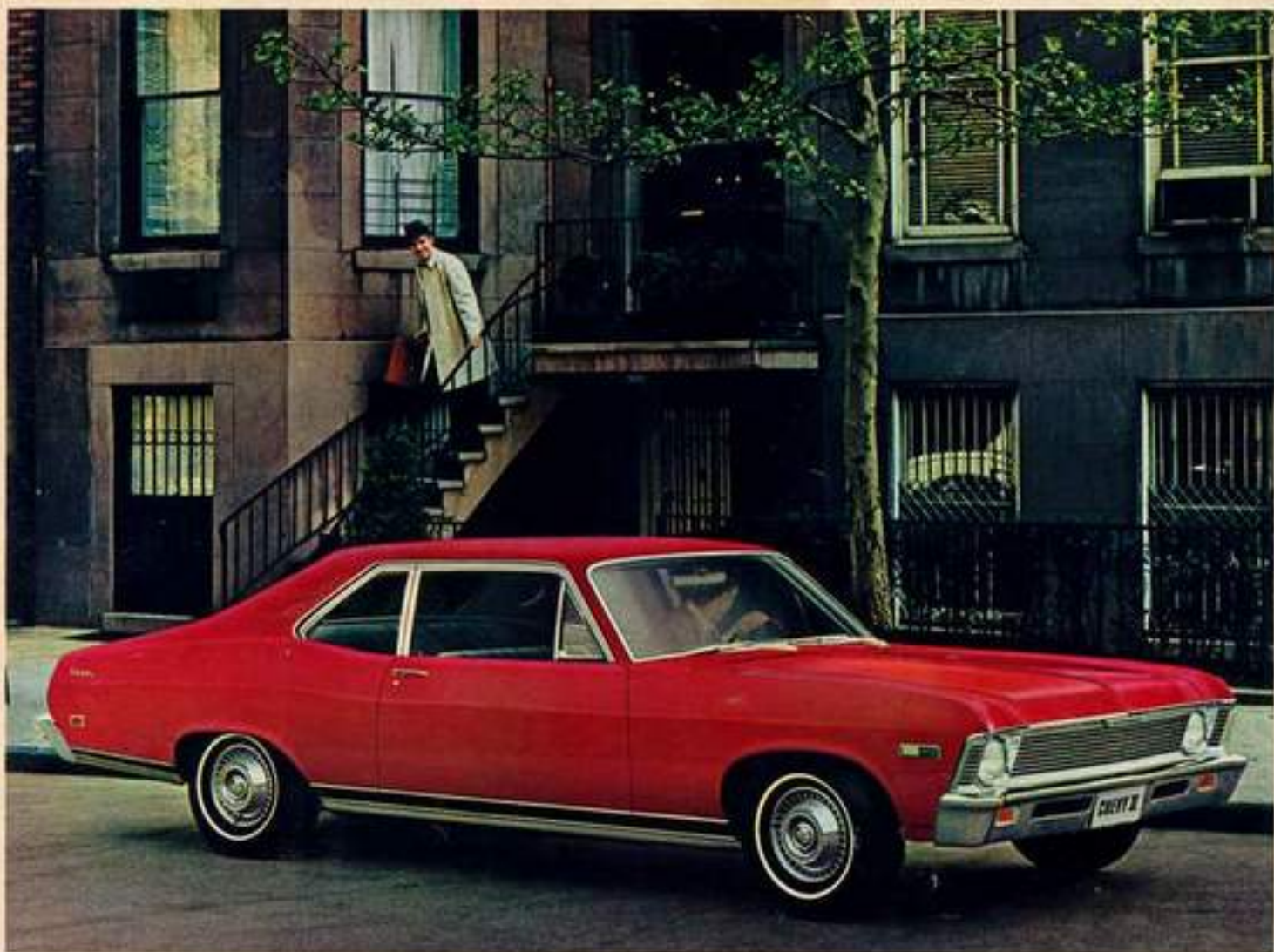
Chevy II Nova Coupe is available in 15 Magic Mirror colors (12 new). Vinyl top can be ordered in white or black for coupe and sedan.