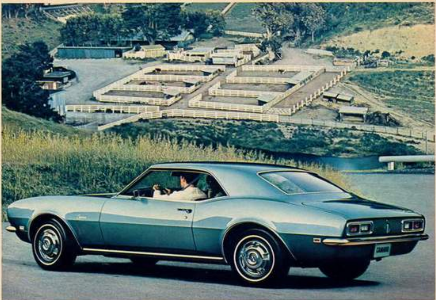
Camaro Sport Coupe with Style Trim Group you can order.