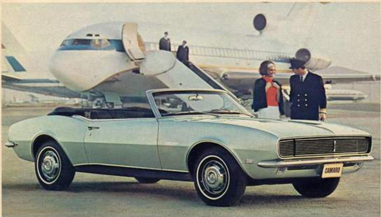
Camaro Convertible can be ordered with Rally Sport package which features headlights concealed behind distinctive grille.