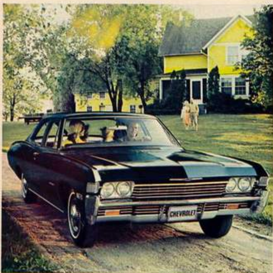
Chevrolet Biscayne 2-Door Sedan is right in stride with its new wide grille and upawapt hood that conceals new Hide-A-Way windshield wiper system.