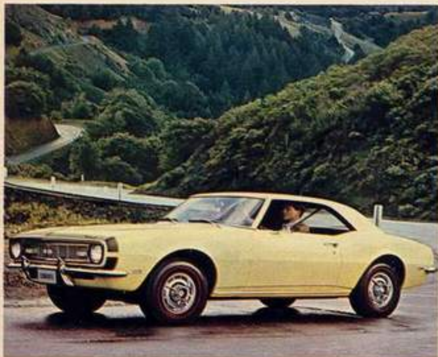
Camaro Sport Coupe with SS package you can specify. Includes big 350 or 396 V8 and wide stripe around grille.