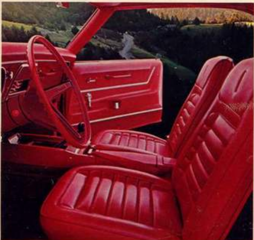
Camaro Custom Interior includes molded vinyl door panels, safety armrests, carpeted scuff panels. Strato-bucket seats are standard. Center console can be ordered.

Camaro innovations for '68 are the kind that only enhance the appearance and performance of sport coupe and convertible. For instance, headlights and parking lights recess in the strikingly new grille which is highlighted by satin-silver horizontal and vertical bars. Very noticeable are the ventless, full-glass curved side windows. New Astro Ventilation — through an ingenious air-flow system — circulates air high and low. Helps isolate you from noise, dirt and rain coming in open windows.