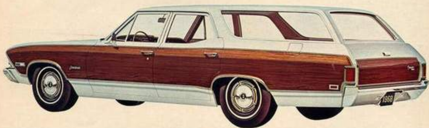
Chevelle Concours 2-Seat Estate Wagon. Walnut-looking panels sweep along sides and across tailgate.

The Concours 2-Seat Estate Wagon lets you load up on luxury. New styling, quality appointments and paneling that looks like hand-rubbed walnut provide a beautiful setting for Chevelle's enlarged 94-cu.-ft. total cargo capacity. All-vinyl interiors—in four colors—also carry such nice touches as wood-looking trim, extra-thick foam cushioning, lighter and deep-twist carpeting for passenger compartments.