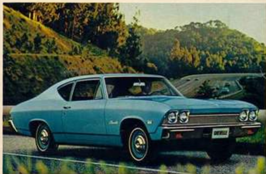
Chevelle 300 Coupe—like all '68 Chevilles—incorporates new body mounting system that isolates road noise and vibration from passenger compartment for a quieter ride.

Nomad 2-Seat Station Wagon, Chevelle's most economical carrier, is as versatile as any—second seat folds flat and flush with cargo deck. Interiors are all vinyl. Also standard: yielding door and window control handles; padded windshield pillars.