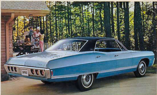
Chevrolet Caprice Sedan features triple taillight cluster—including backup lights—in rear bumper. Vinyl top can be ordered in black or white.