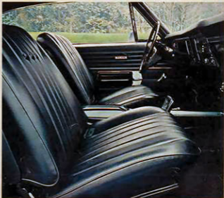
Chevelle SS 396 interior with all-vinyl Strato-bucket front seats and sporty center console you can specify.

You'll judge both SS 396 Sport Coupe and Convertible the best of breed. Exclusive hood says there's a 325-hp Turbo-Jet 396 V8 inside. Special black grille: wide-oval red stripe tires. Insides are exceptional, too. All-vinyl trim; lighter; glove compartment light. Make the scene sportier—order Strato-bucket seats plus new center console.