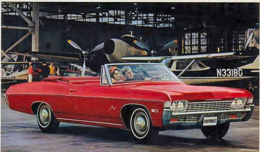
Chevrolet Impala Convertible. Power-operated top with fixed rear glass window is available in black, white or blue. Black vinyl inserts are set in side moldings.

Front Cover: Chevrolet Impala Custom Coupe with black vinyl top you can order. Top also can be ordered in white.