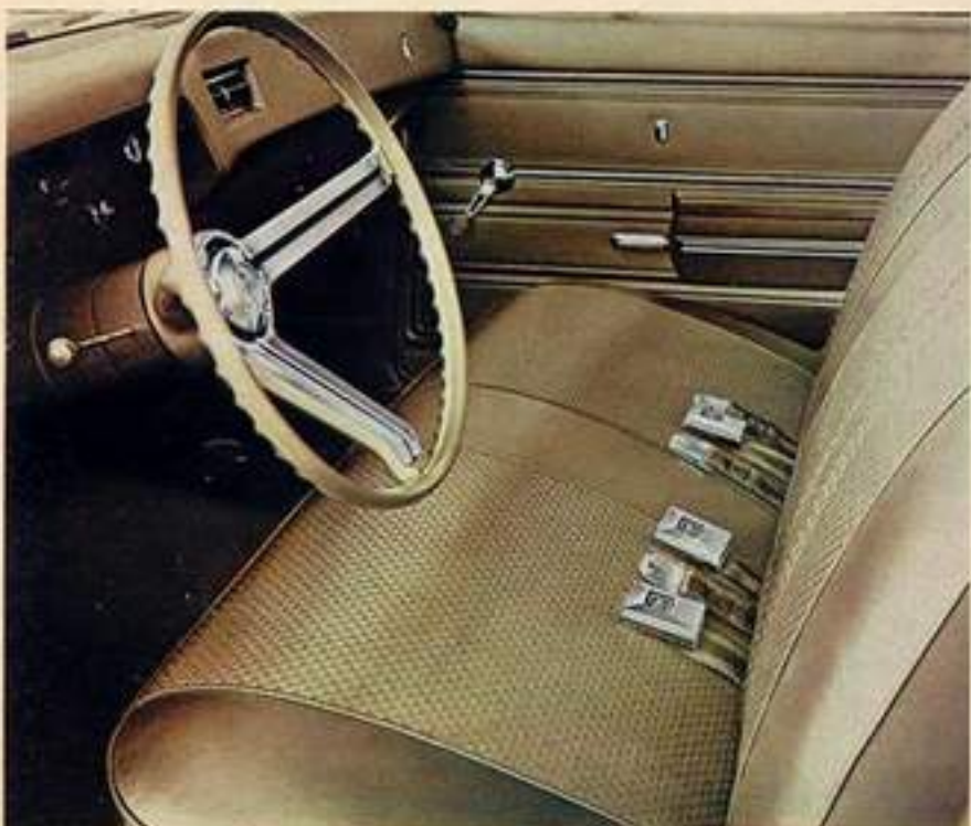
Chevy II Nova Coupe with Custom Interior you can order. Among many features: extra-thick foam front seat and deep-twist carpeting.

The beautiful Body by Fisher adds a new dimension to Chevy II Nova for '68, too. Four inner fenders help protect against corrosion. So do the heavy-gauge flush-and-dry rocker panels. New strength comes from inner and outer body panels, heavy-ribbed and reinforced underbody.