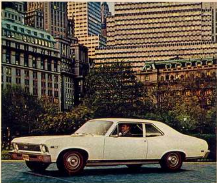
Chevy II Nova Coupe can be ordered with SS package which has 295-hp 350 V8, special chassis components and bold exterior trim.