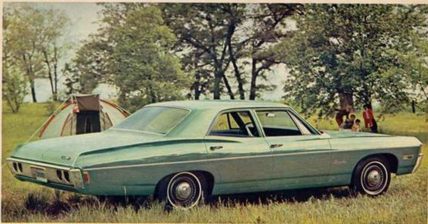
Chevrolet Bel Air 4-Door Sedan with body side molding and dual taillight/backup light assemblies now set in rear bumper.