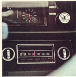
AM Radio and Clock