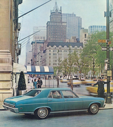
ABOVE: NOVA 4-DOOR SEDAN with Custom Exterior. Two bonuses for '68: computer-refined ride and extra family-sized room.