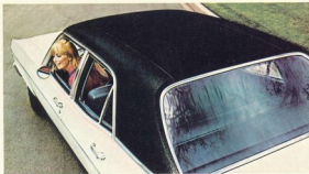
Vinyl Roof Cover and Window Moldings