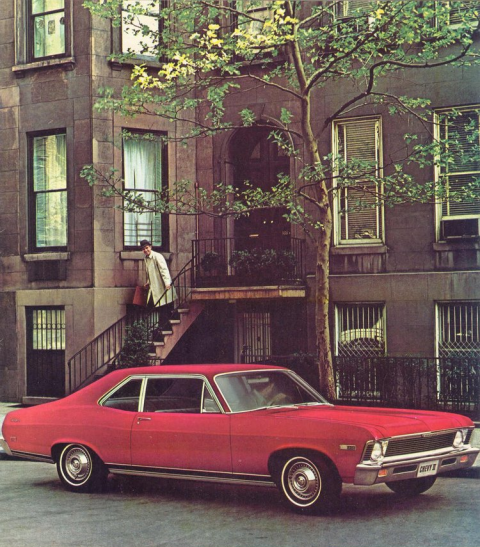
ABOVE: NOVA COUPE, with Custom Exterior. Brightens your car with moldings, trim and a wide black accent band.