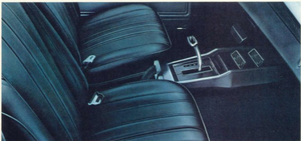
BUCKET SEAT interior on Coupe. Seats are form-fitting and all-vinyl. Shown with optional console and special instrumentation.

BUCKET SEAT INTERIOR: Coupe only. Includes Custom Interior items and all-vinyl bucket seats in black, dark blue or gold. You can order a center console as a separate option, with or without the special instrumentation package.