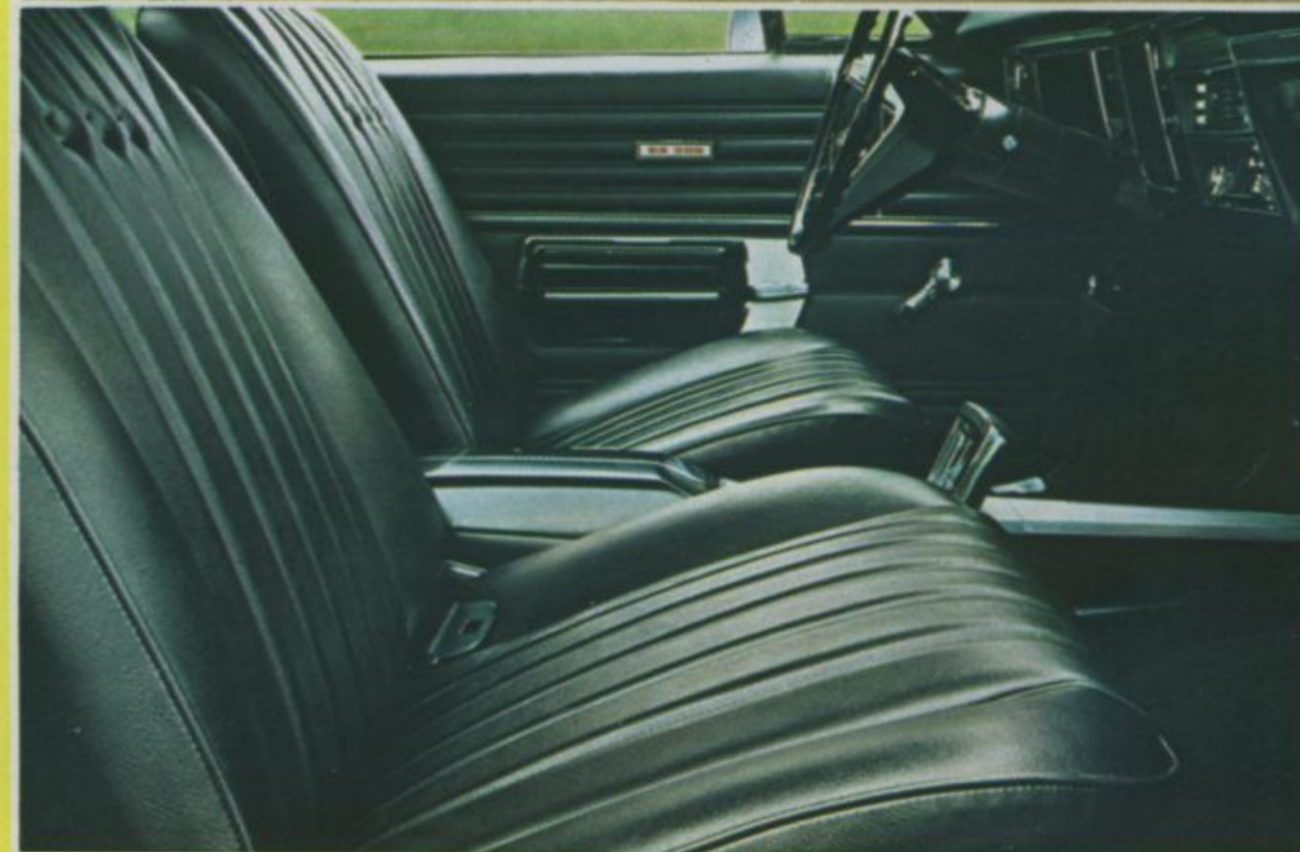
Console and all-vinyl bucket seats are very sporty SS 396 options.