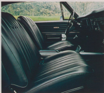
Chevelle SS 396 interior with all-vinyl Strato-bucket front seats and sporty center console you can specify.

You'll judge both SS 396 Sport Coupe and Convertible the best of breed. Exclusive hood says there's a 325-hp Turbo-Jet 396 V8 inside. Special black grille: wide-oval red stripe trim. Interiors are exceptional, too. All-vinyl trim; lighter, glove compartment light. Make the scene sportier — order Strato-bucket seats plus new center console.