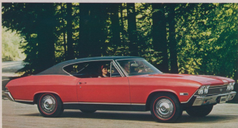
Chevelle SS 396 Sport Coupe. Hide-A-Way windshield wipers are standard for SS 396, Concours and Malibu, can be ordered for other Chevelles. Vinyl top can be ordered in black or white.

To say Chevelle is all new is an understatement . . . it is brilliantly original for '68. Out-of-the-ordinary roof lines, front fenders and taillight arrangements. The latest look in long-hood/short-deck styling. Two wheelbases: 112" for coupes and convertibles; 116" for sedans and wagons. And expansive grilles emphasize wider tread.