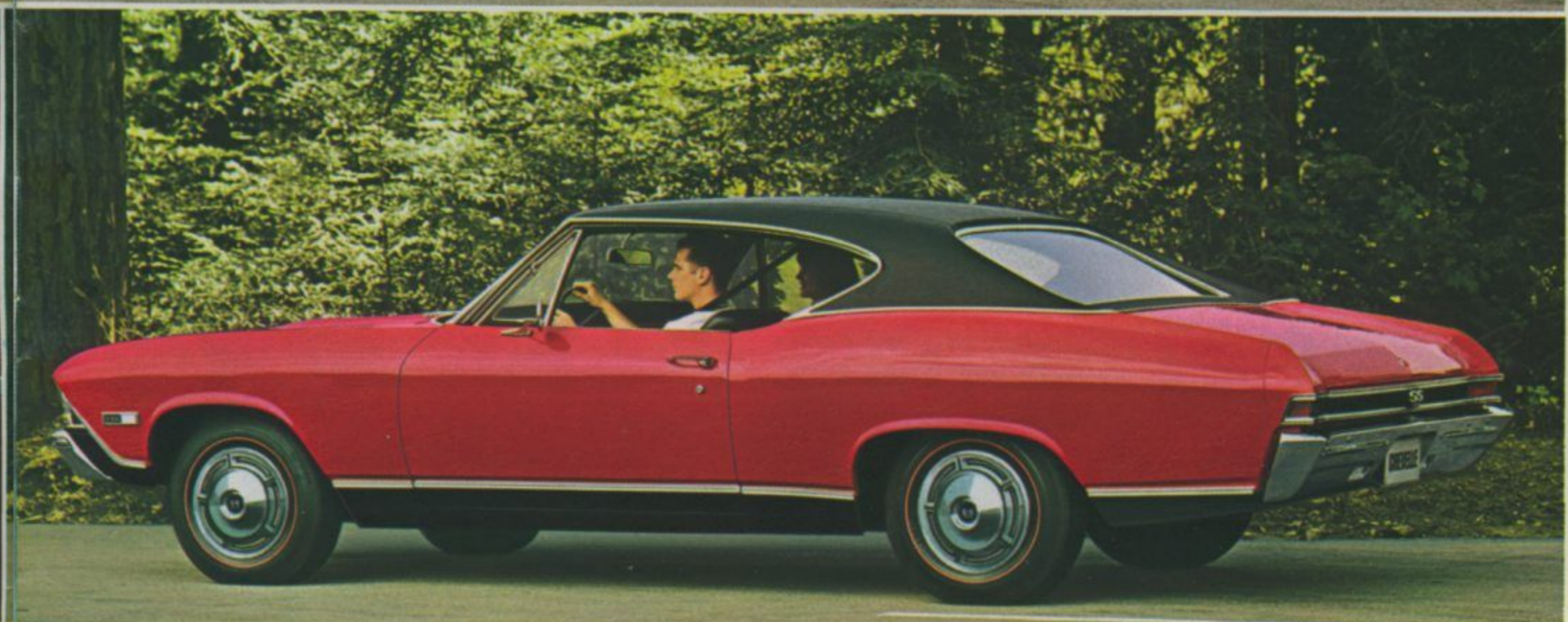
SS 396 equipment includes red stripe tires, fender-mounted side marker lights, body side moldings and black-accented trim. Nice.