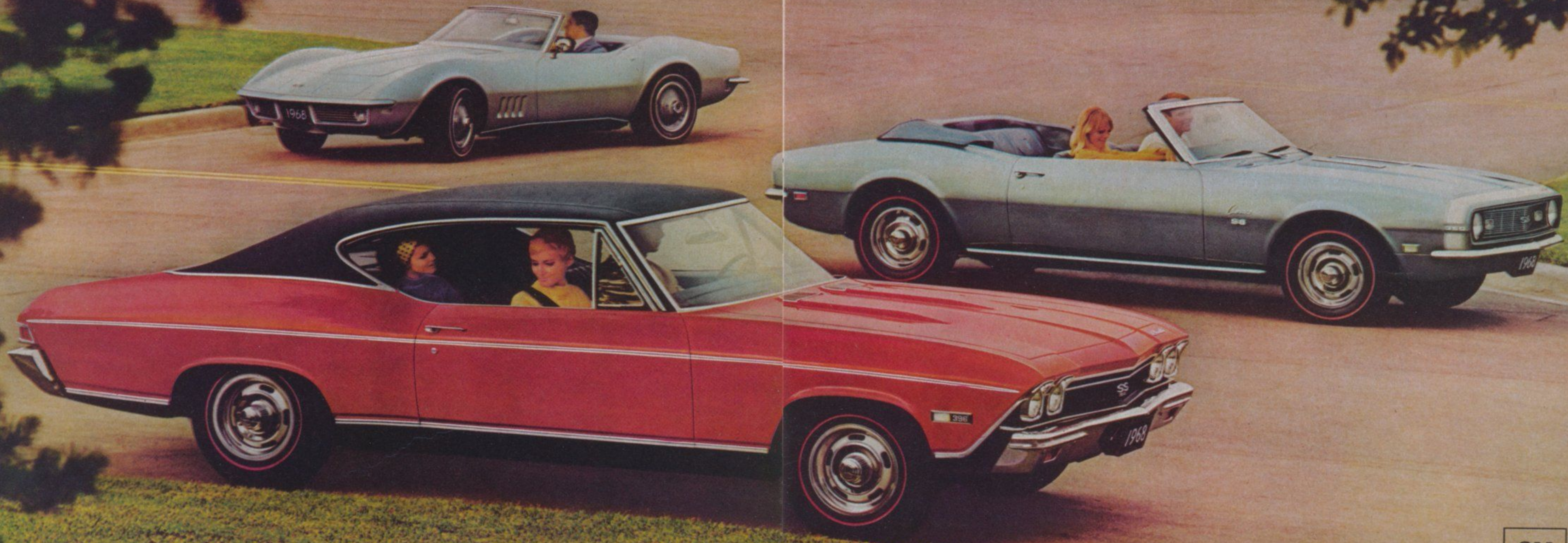
1968 Chevelle SS 396, Camaro SS, Corvette Sting Ray Convertible. You can buy a 1968 car anywhere, but you'll have to see your Chevy dealer to buy the new ones.