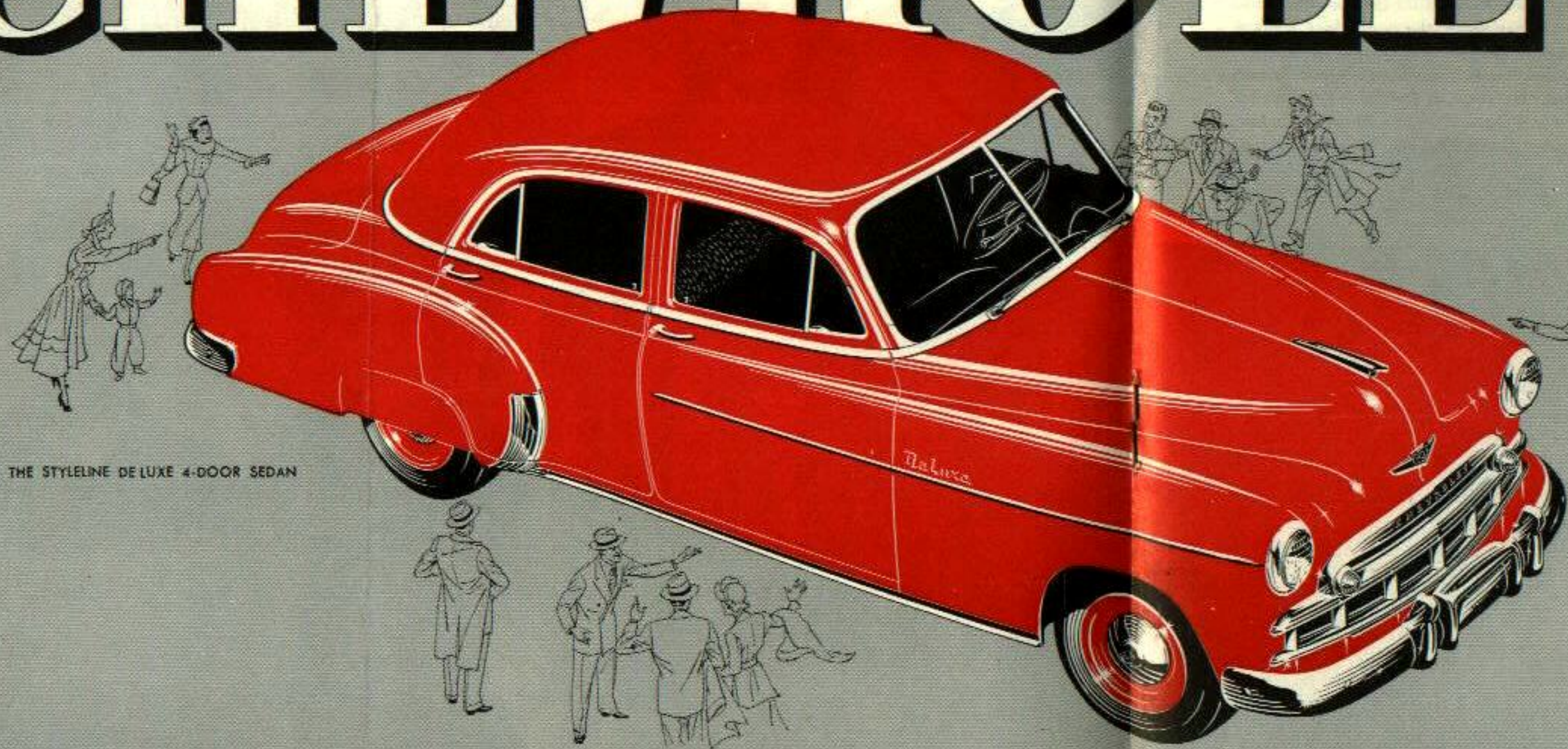
THE STYLELINE DE LUXE 4-DOOR SEDAN