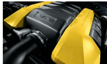
Body-Color Engine Cover