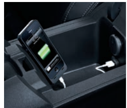
Available USB port. 10