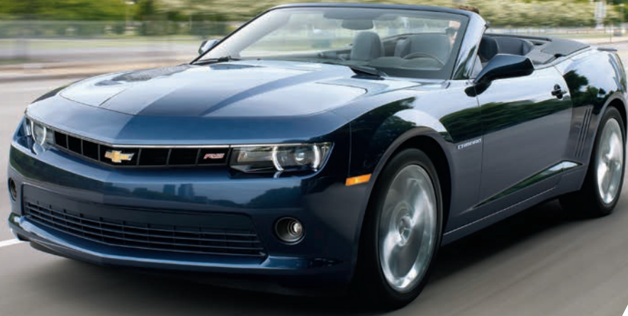
Camaro Convertible 2LT in Blue Ray Metallic with available RS Package and available features.