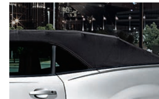
Black Convertible Top