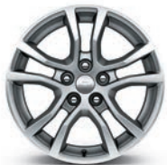
18" Silver-Painted Aluminum (Standard on LS and 1LT)