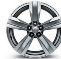
20" Forged-Aluminum Bright 5-Spoke 3,7 (Available on ZL1)