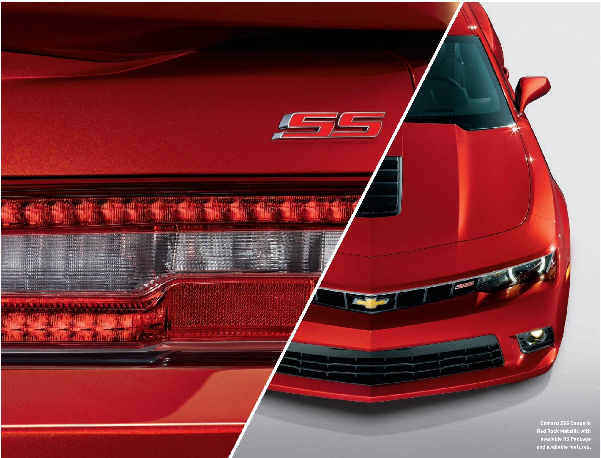
Camaro 2SS Coupe in Red Rock Metallic with available RS Package and available features.