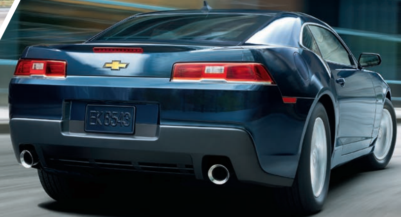
Camaro 2LS Coupe in Blue Ray Metallic with available features.

IT'S YOUR TIME TO FLY Any way you order it, Camaro is a precision-tuned, highly acclaimed performer. The 3.6L 323-horsepower dual overhead cam V6 engine, standard in LS and LT Coupe and LT Convertible, features the advanced technologies of Direct Injection and Variable Valve Timing. Bottom line? The 3.6L Camaro will propel you from 0 to 60 in 6.4 seconds! Plus, it offers an EPA-estimated 30 MPG on the highway!