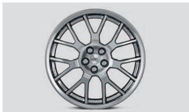
21" Multi-Spoke Chrome Wheel

PERSONALIZE YOUR CAMARO AT CHEVROLET.COM/ACCESSORIES