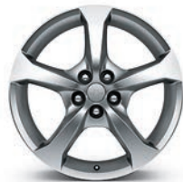
20" Polished-Aluminum 3,4 (Available on LT and SS, shown) Bright Silver-Painted Aluminum (Standard on SS)