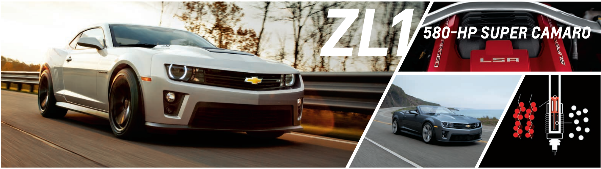
Camaro ZL1 Coupe in Silver Ice Metallic.

RESPECT THE HISTORY Its bloodline traces back to the legendary original-production 1969 Camaro ZL1. But make no mistake. This ZL1 is the most technologically advanced Camaro ever. And it is available in Coupe or Convertible models.