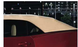
Beige Convertible Top