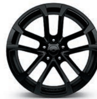
20" Forged-Aluminum Black-Painted 10-Spoke 3,6 (Standard on ZL1; available on SS 6 )