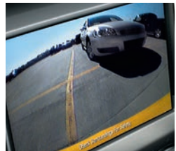
Available rear vision camera.

COLOR HEAD-UP DISPLAY (HUD) The new color HUD, standard on 2LT, 2SS and ZL1 models, projects transparent color readouts of miles per hour, lateral g data and other performance data, even your radio station, directly onto the windshield.