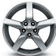
19" Bright Silver-Painted Aluminum (Standard on 2LT, shown) Polished-Aluminum (Available on 1LT and 2LT)