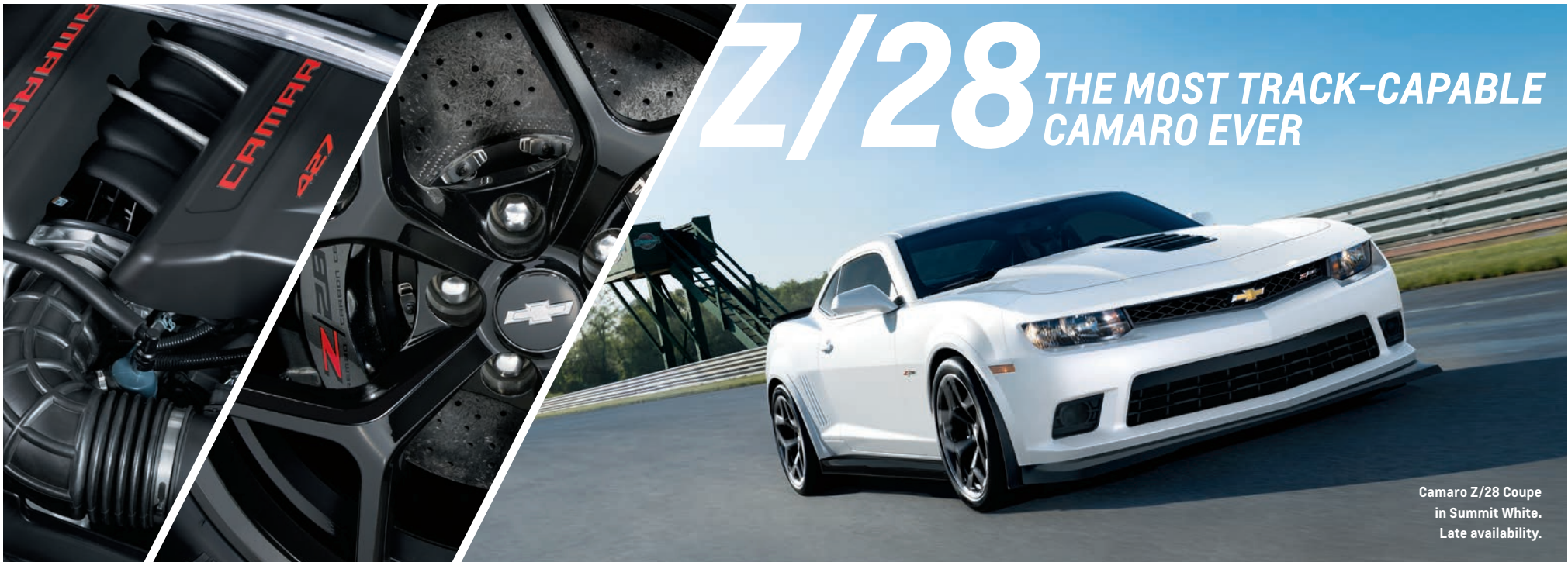
Camaro Z/28 Coupe in Summit White. Late availability.

THE WISH LIST FOR ANY RACER Lightweight, dry-sump LS7 V8 engine. Carbon ceramic brakes. Integrated coolers for track use. True aerodynamic downforce. Significant reduction in curb weight. Every detail is engineered specifically to create the ultimate track experience. The 2014 Camaro Z/28 restores the mission of the original Z/28, and serves as a testament to the expertise of Chevrolet as the best-selling brand of performance cars.