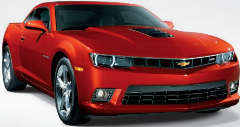
Camaro 2SS Coupe in Red Rock Metallic with available RS Package and available features.