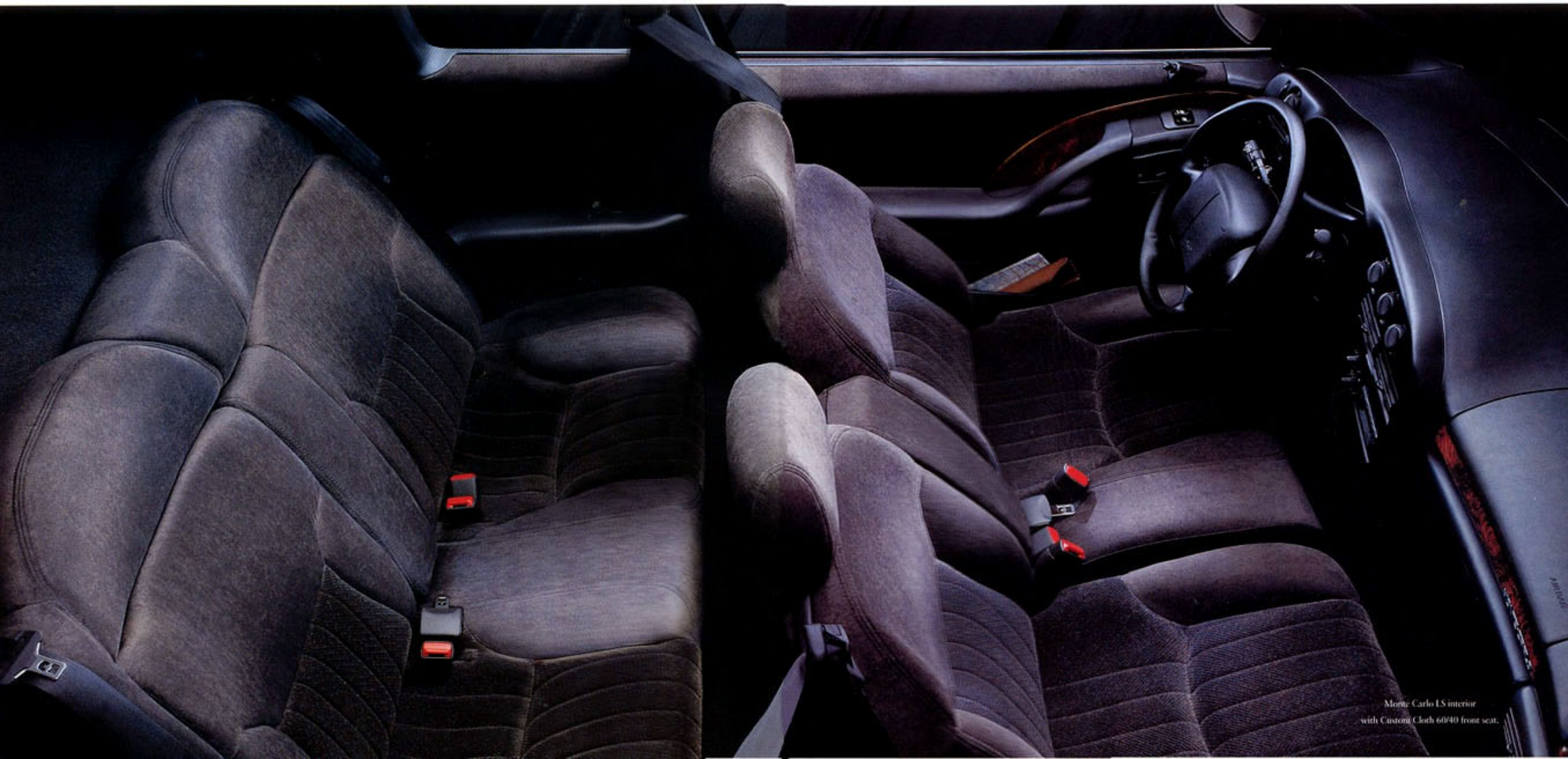
Monte Carlo LS interior with Custom Cloth 60/40 front seat.

Convenience features include air conditioning (with CFC-free refrigerant), power door locks and power windows. Nighttime "theatre lighting" is also standard. It starts out bright when you get in the car, then gradually dims as you prepare to drive away.