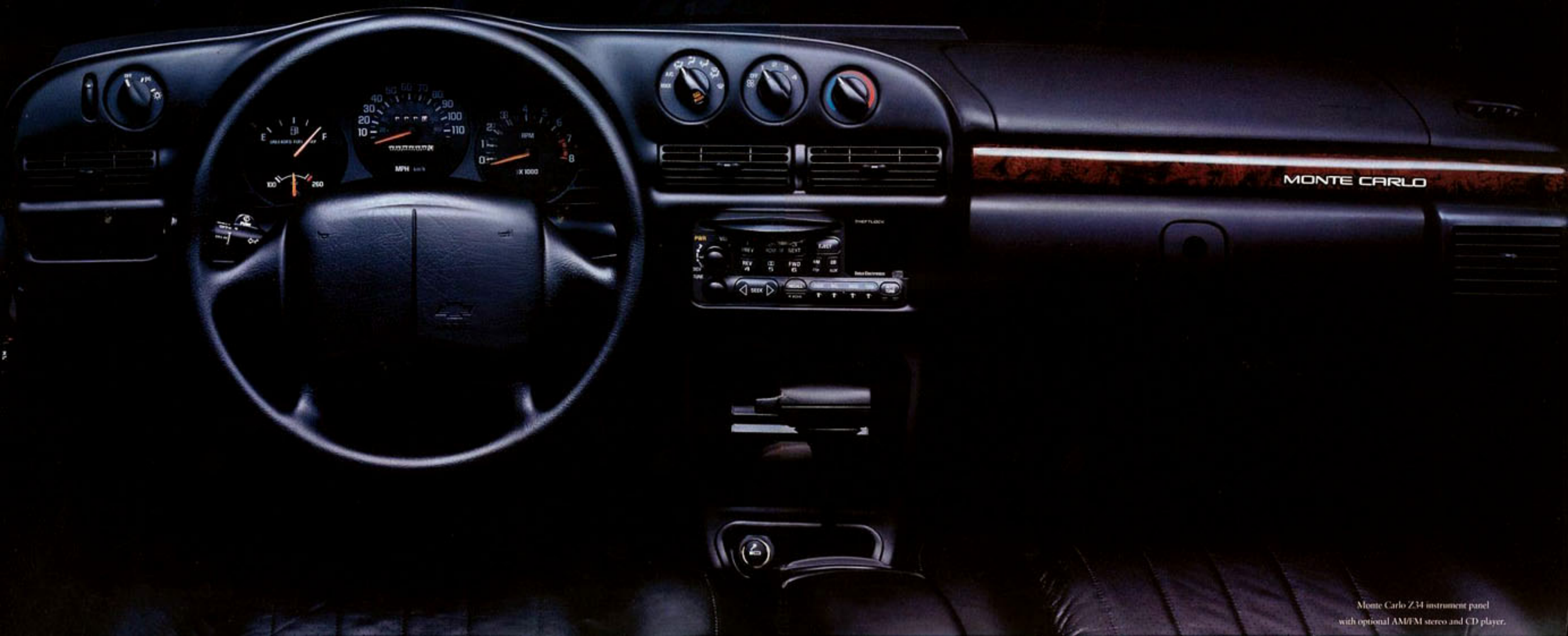
Monte Carlo Z34 instrument panel with optional AM/FM stereo and CD player.

Once you enter this quiet world, you may wonder why some people are paying more money and getting less car than Monte Carlo.