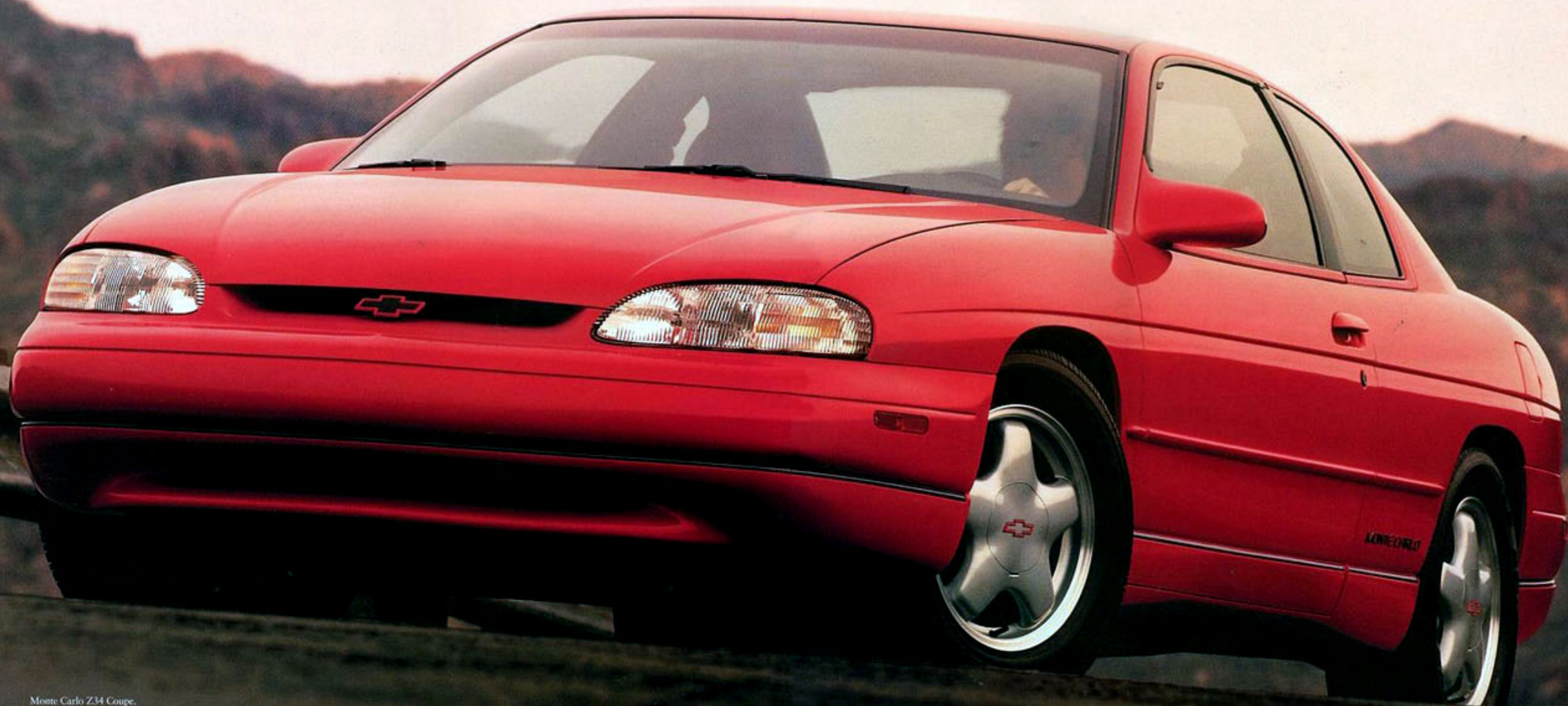
Monte Carlo Z34 Coupe.

So why spend two or three times as much for a luxury import? Monte Carlo Z34 is the new choice for America's driving enthusiasts.