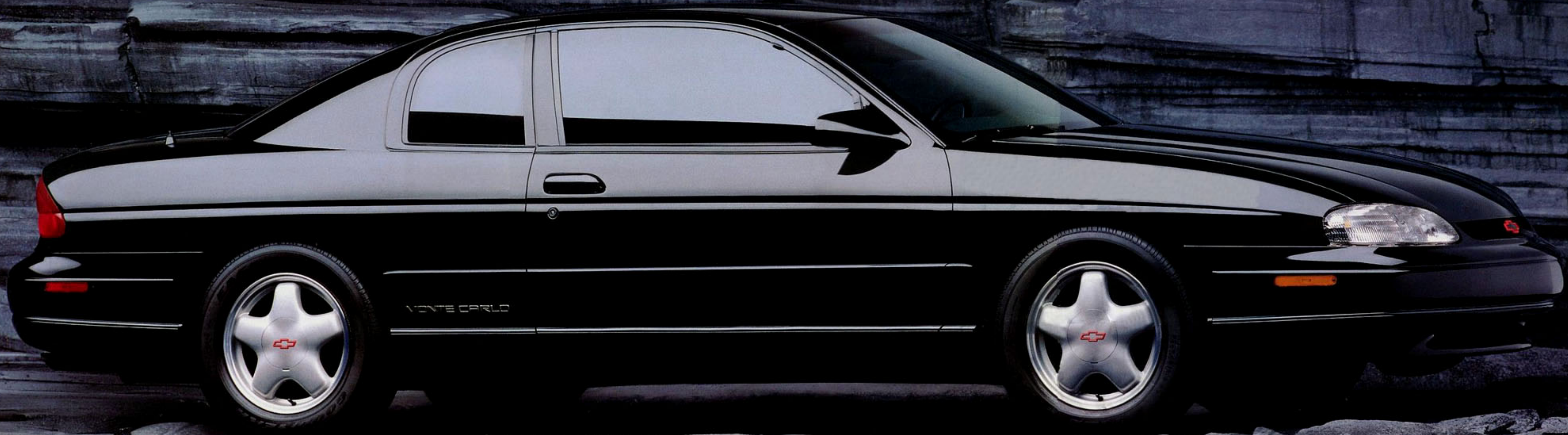
Monte Carlo Z34 Coupe.