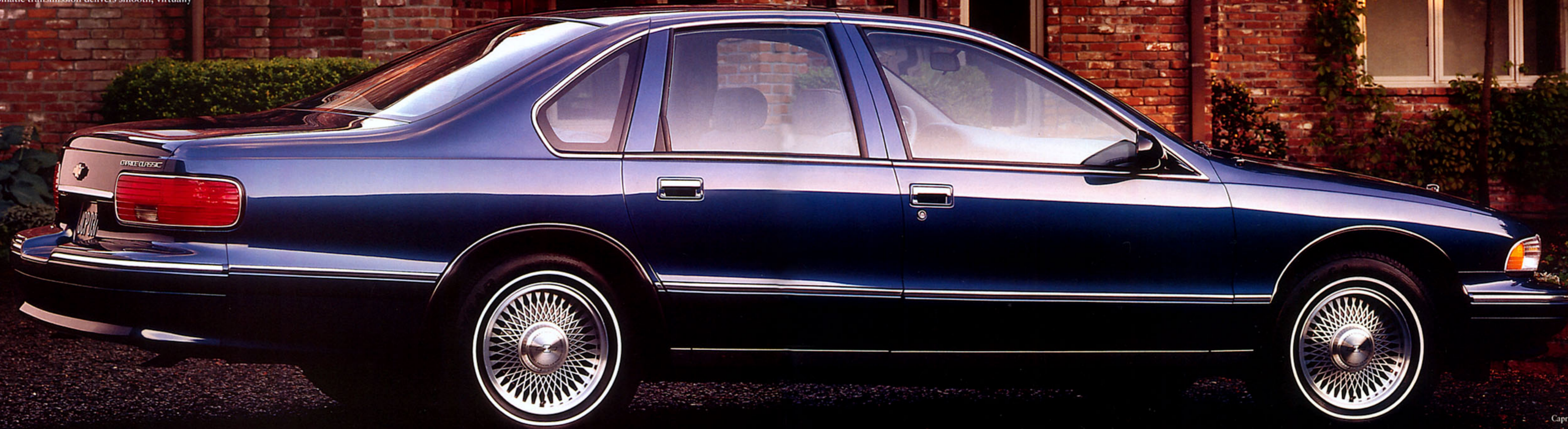
Caprice Classic Sedan with optional aluminum wheels.

You could settle for something less. But why would you want to?