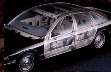
A high-strength body structure helps the 1995 Caprice Classic meet 1997 Federal safety standards for side impacts today.