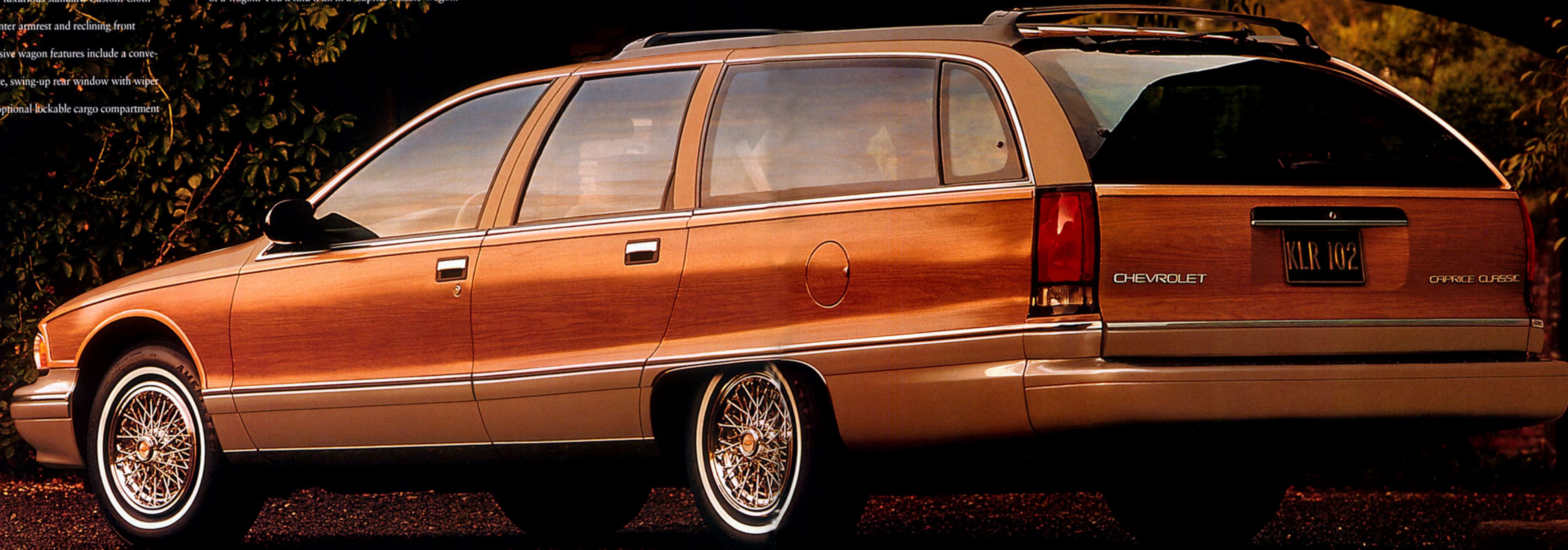
Caprice Classic Wagon with simulated woodgrain exterior trim and other options.

The comfort and safety of a full-size car. The utility of a wagon. You'll find it all in a Caprice Classic Wagon.