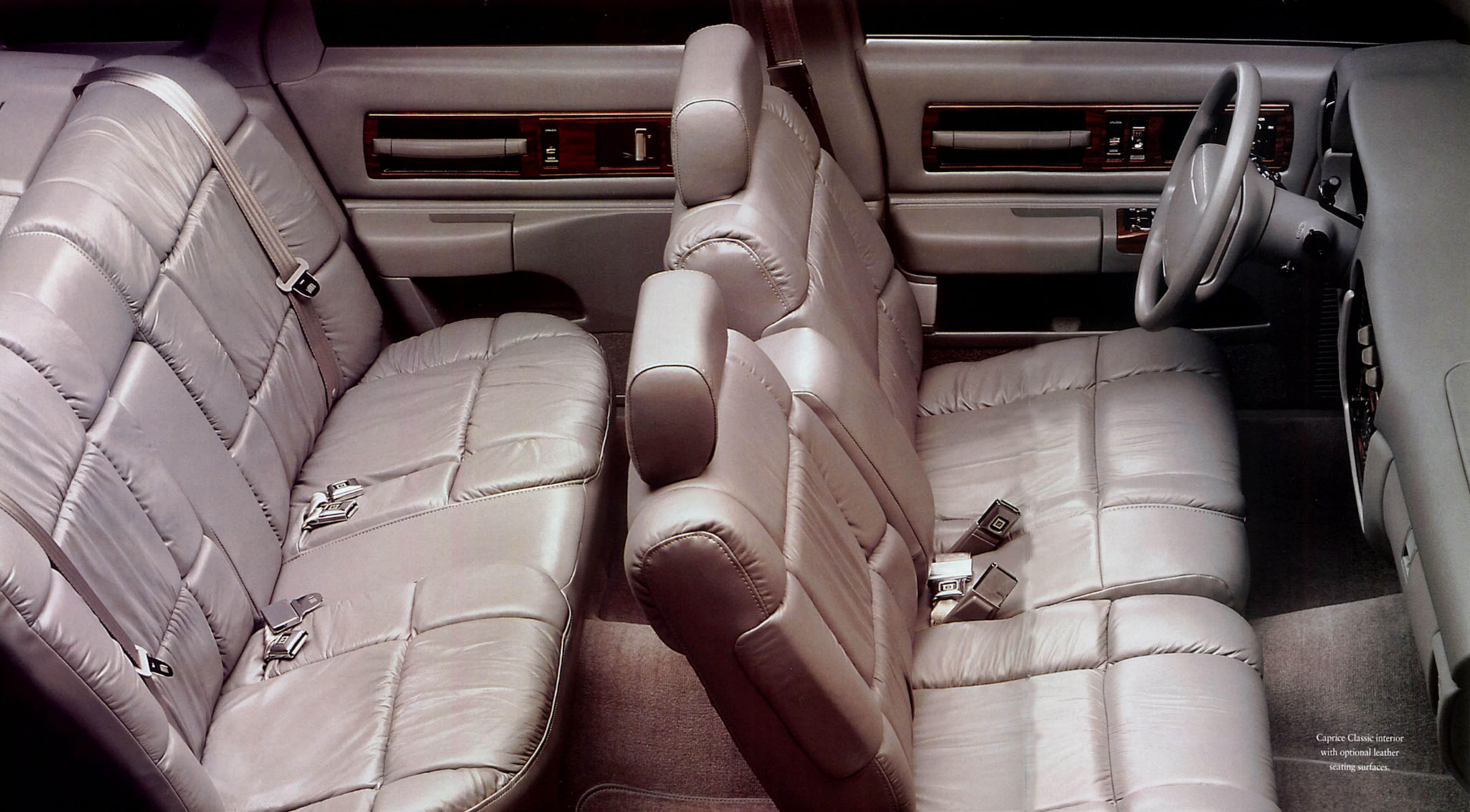
Caprice Classic interior with optional leather seating surfaces.

No Mercedes-Benz, no BMW and no Lexus can match the spaciousness you'll find in Caprice Classic.