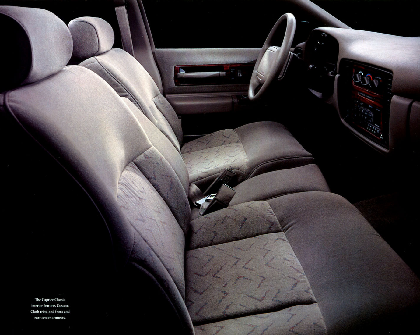
The Caprice Classic interior features Custom Cloth trim, and front and rear center armrests.

We want you to enjoy every minute you spend in your new car. That's why Caprice Classic is so quiet, comfortable and roomy. An aero shape with flush-fitting glass and triple door seals contributes to the hushed feeling inside this very refined automobile.