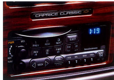
A Delco AM/FM stereo with CD player is optional.

You could pay as much for a mid-size car. Or you can enjoy the limousine-like quiet and beautifully smooth highway ride of Caprice Classic.