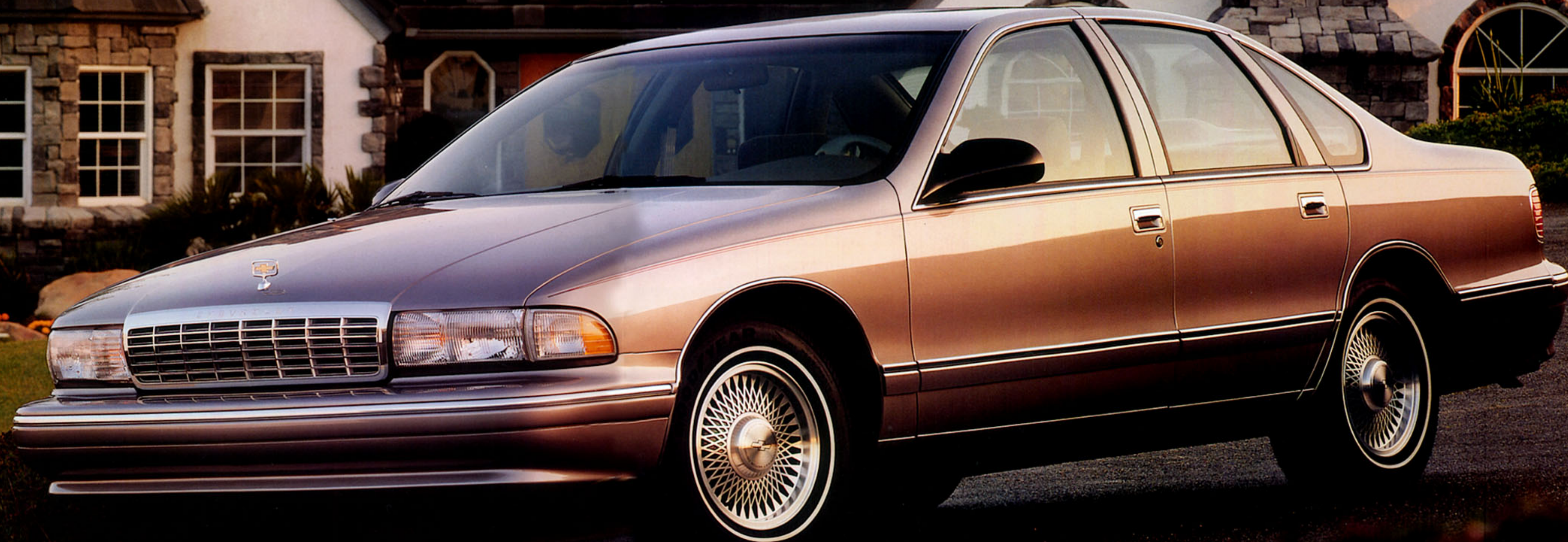
Caprice Classic Sedan with optional aluminum wheels.

When it comes to value, there's nothing else like it. And that makes Caprice Classic Genuine Chevrolet.