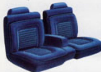
Caprice Classic Brougham/Brougham LS cloth 45/55 seat with pull-down center armrest and reclining driver and passenger seat-backs. Leather seating surfaces are optional.