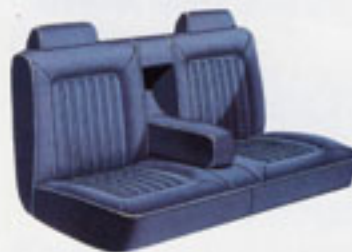
Caprice Classic cloth bench seat with pull-down center armrest.