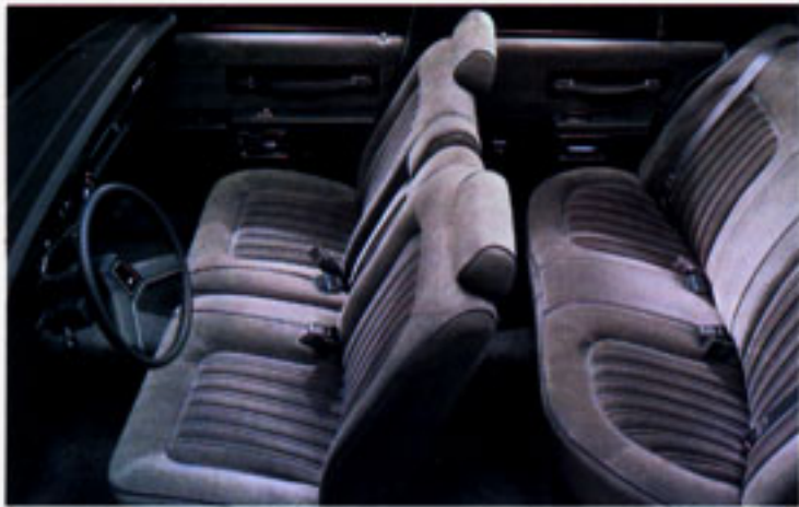
The luxurious Caprice Classic Sedan interior offers full-size comfort for six passengers. Optional 50/50 front seat with twin pull-down center armrests shown.

Caprice continues to feature Full Coil suspension for a beautifully smooth ride, full-frame construction and a proven rear-drive design.