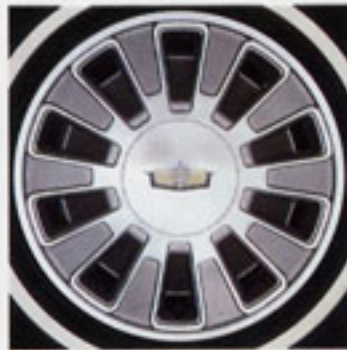
Optional Custom wheel cover (standard on Brougham models).