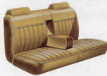
Caprice Classic vinyl bench seat with pull-down center armrest (wagon only).