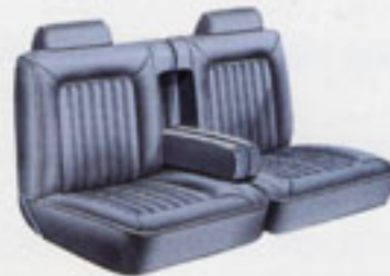
Optional Caprice Classic cloth 50/50 front seat with twin pull-down center armrests and reclining driver and passenger seat-backs.