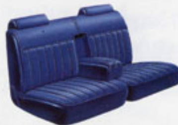
Optional Caprice Classic vinyl 50/50 bench seat with twin pull-down center armrests and reclining driver and passenger seat-backs (wagon only).