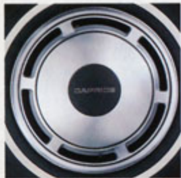
Caprice Classic standard wheel cover.