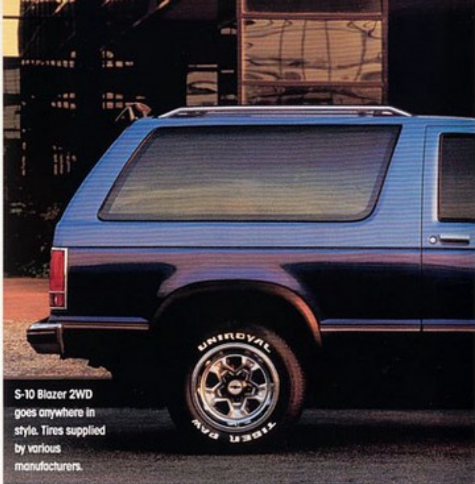
S-10 Blazer 2WD goes anywhere in style. Tires supplied by various manufacturers.