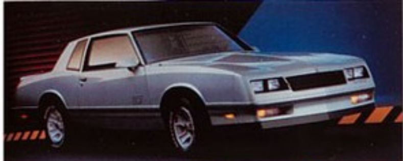
Monte Carlo SS. Super performance, super styling, Super Sport.