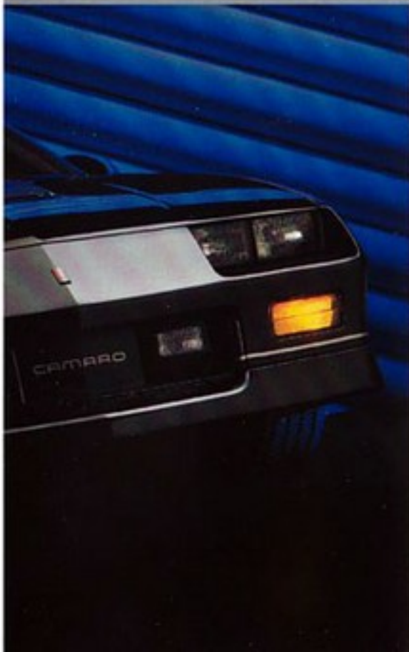
IROC-Z, the ultimate Camaro. One of America's favorite family of 2 + 2 sport coupes.