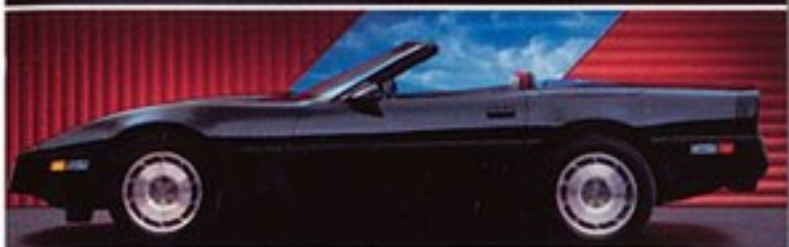
The Corvette Convertible. Open to wind, open to sunshine, open to the envious stares of those consigned to lesser cars.