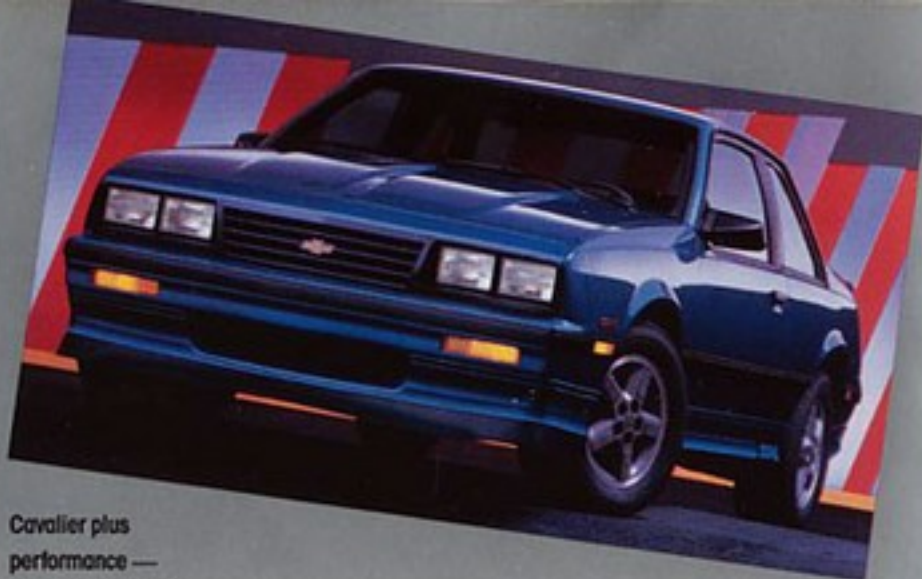
Cavalier plus performance — that's Cavalier Z24.