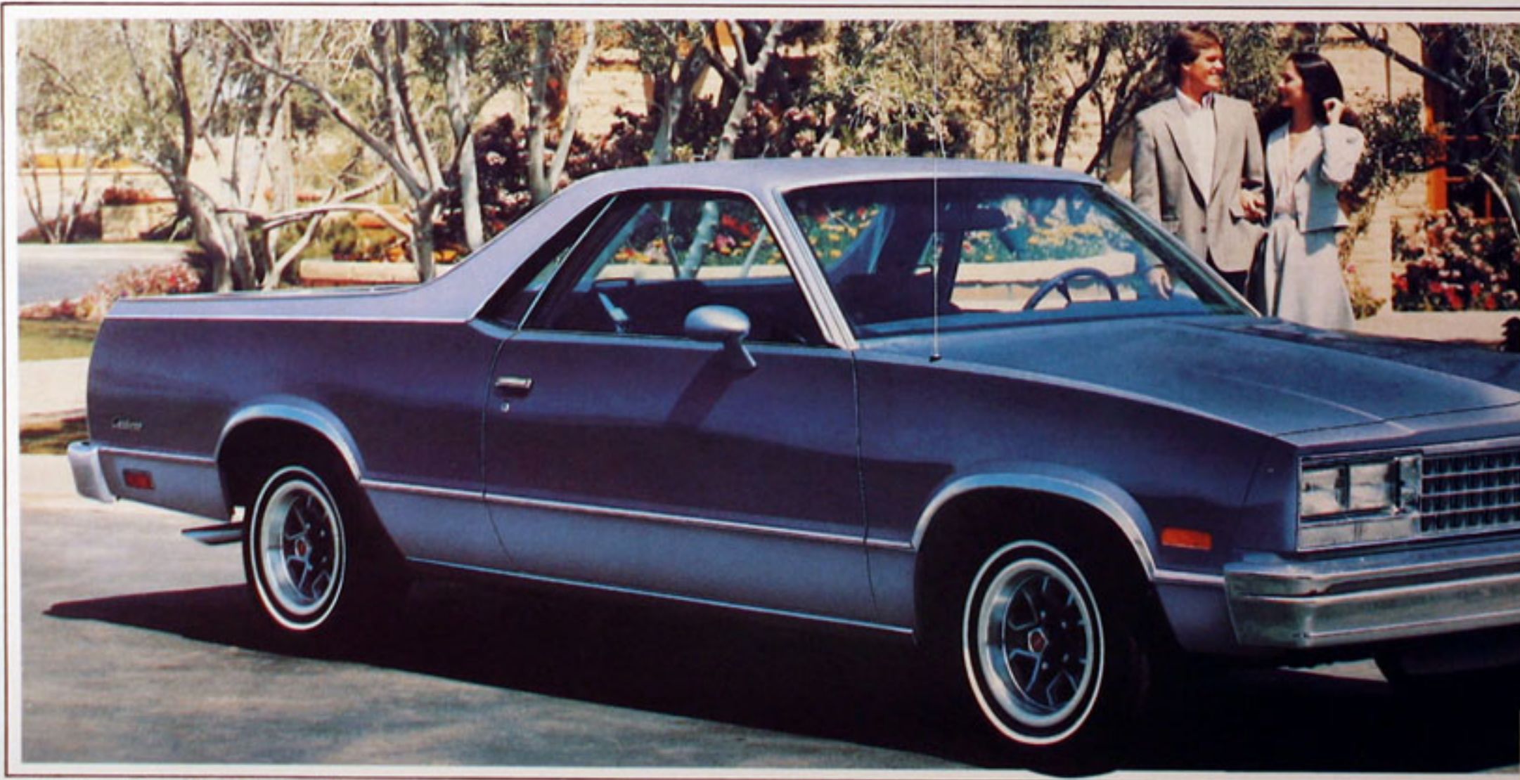
Caballero Amarillo is shown. Tires are supplied by various manufacturers.

Whatever Caballero model you choose, it can be equipped with a variety of available options and dealer-installed accessories. See page 4 for details.