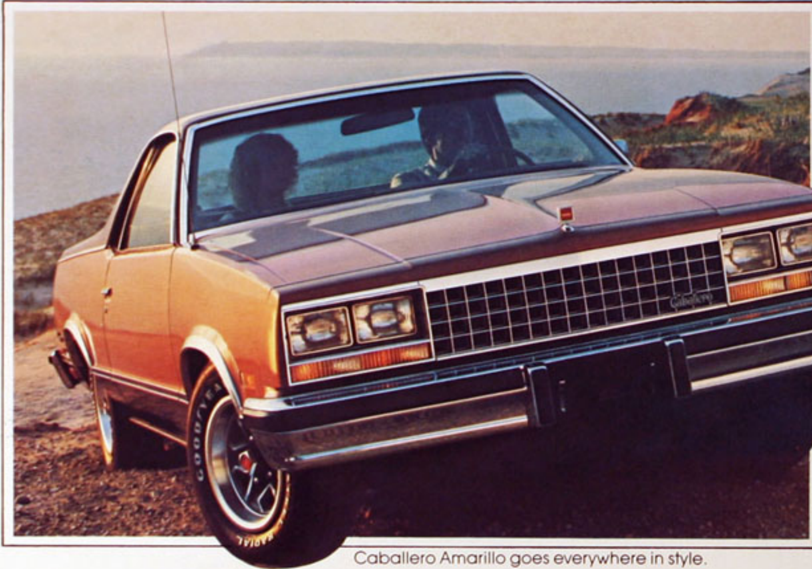
Caballero Amarillo goes everywhere in style.