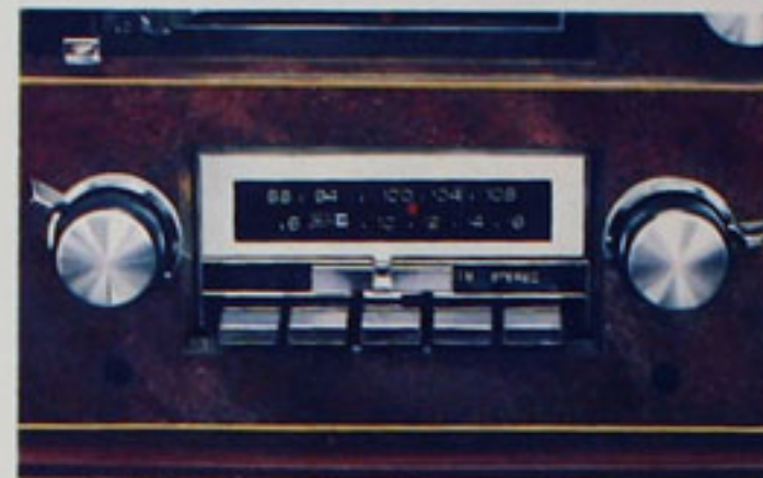
AM/FM stereo radio with cassette player