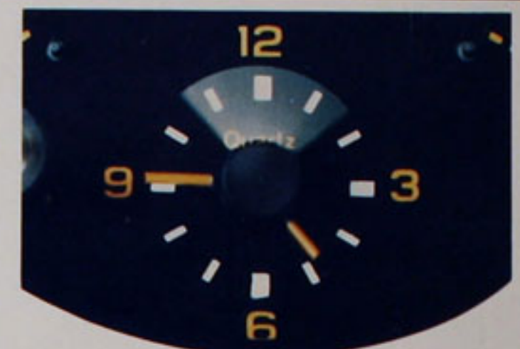
Quartz electric clock