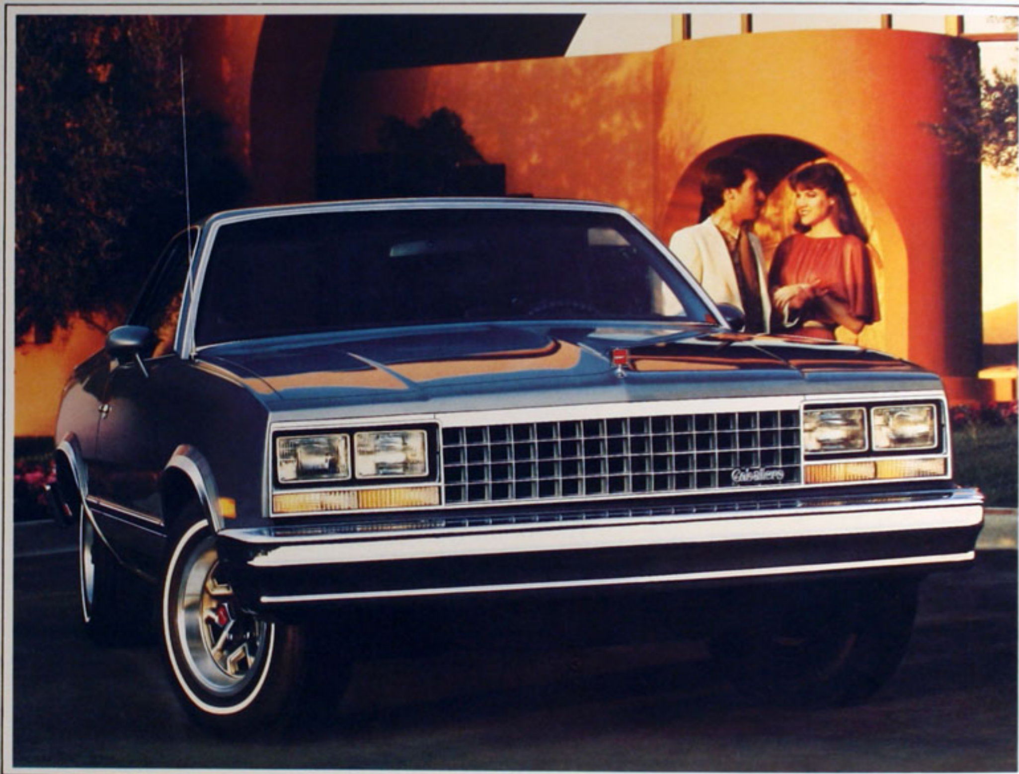
Caballero—dramatic truck decor.

All Caballeros have rugged coil-spring suspension front and rear together with a front stabilizer bar. Standard air-adjustable rear shock absorbers can be boosted with service-station air pressure to level the vehicle when carrying heavy loads. The air valve is located inside the fuel filler door. An optional Sport Suspension is available which includes higher-rate springs and upper control arm rear bushings,