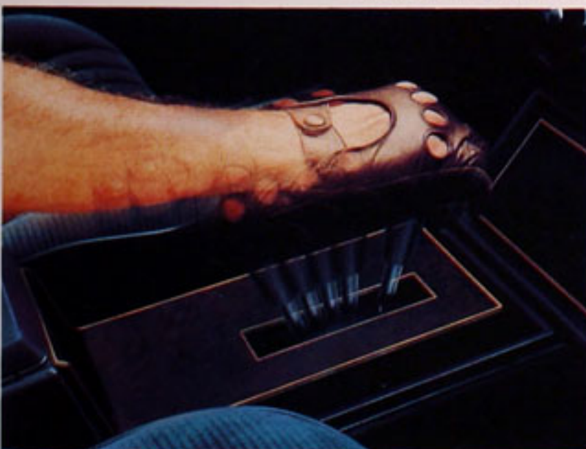
Available floor mounted center console with shift lever, stowage compartment and ash tray