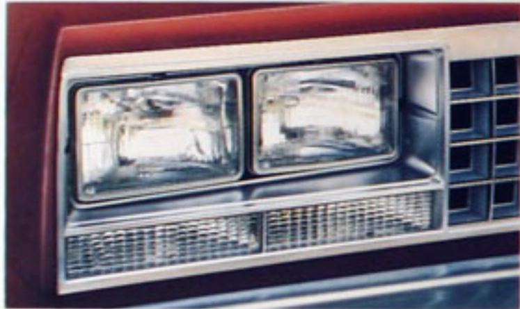
New hi-lo beam halogen headlamps