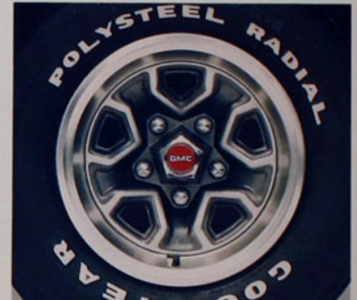
Rally wheel with trim ring