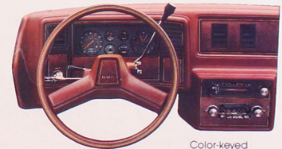
Color-keyed instrument panel

Ask your GMC Dealer for a Demonstration Drive.