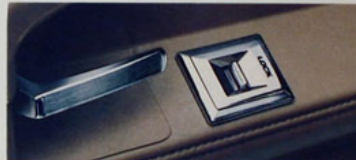
Power door locks