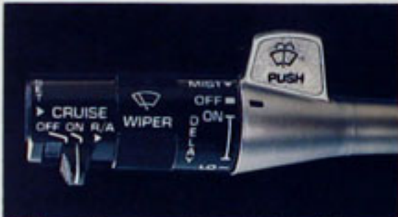
Automatic speed control with resume speed feature