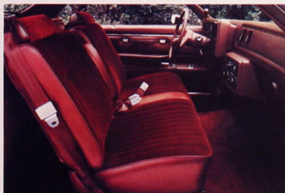
Available 55/45-split bench seat with new-design cloth trim