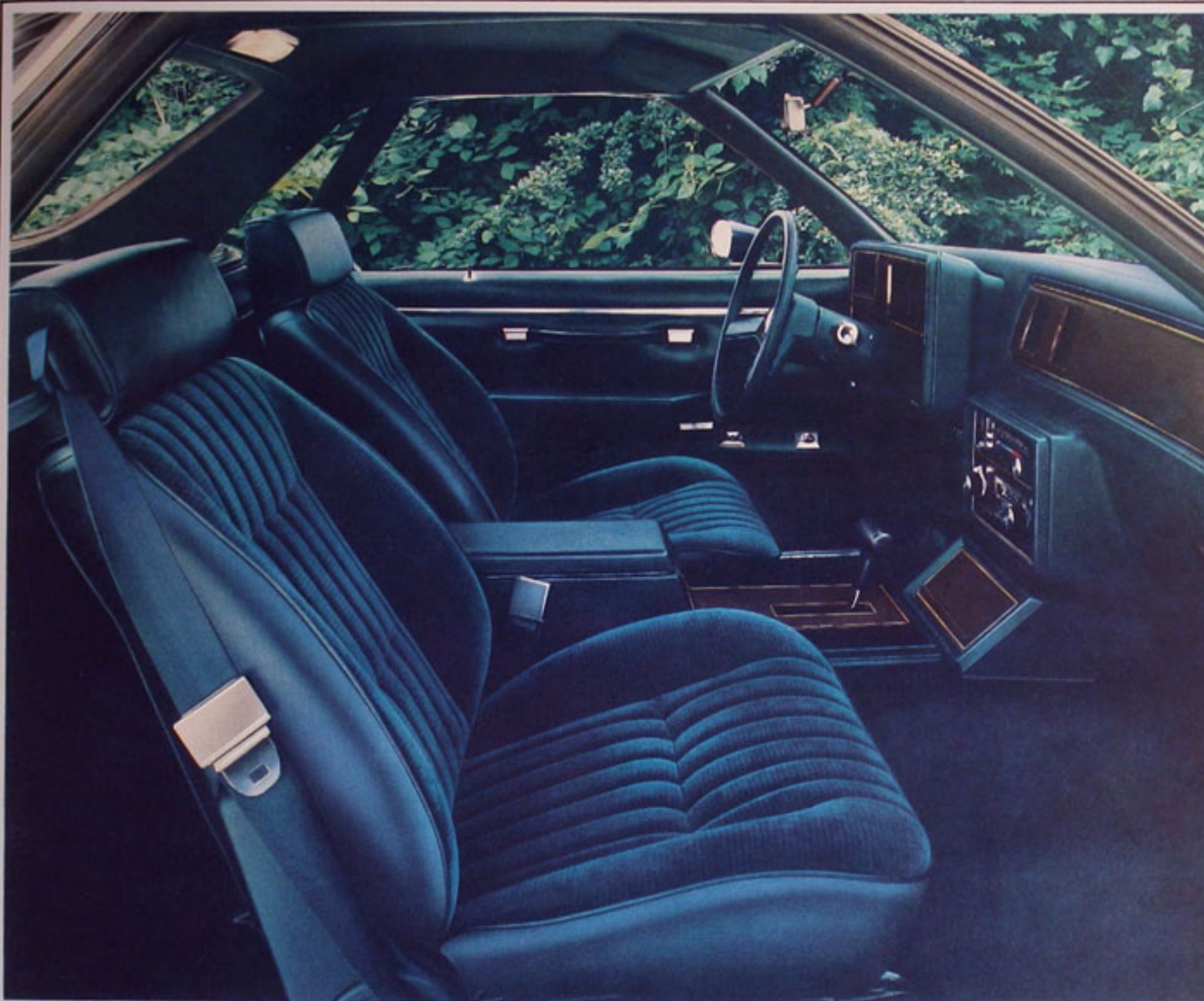
Available high-back bucket seats with cloth upholstery