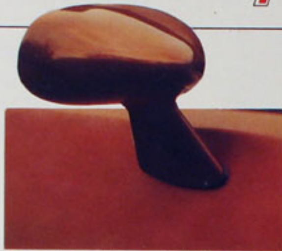
Sport mirrors LH remote, RH convex manual