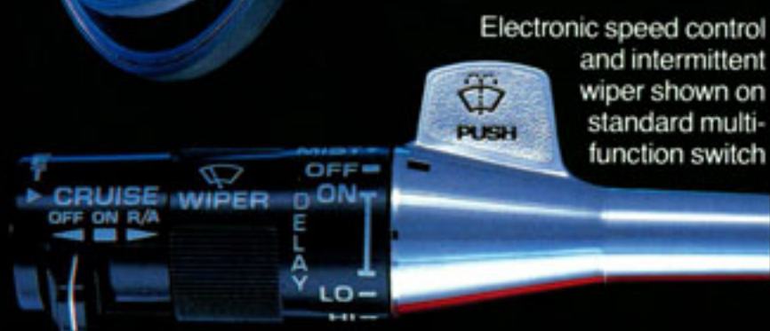
Electronic speed control and intermittent wiper shown on standard multi-function switch