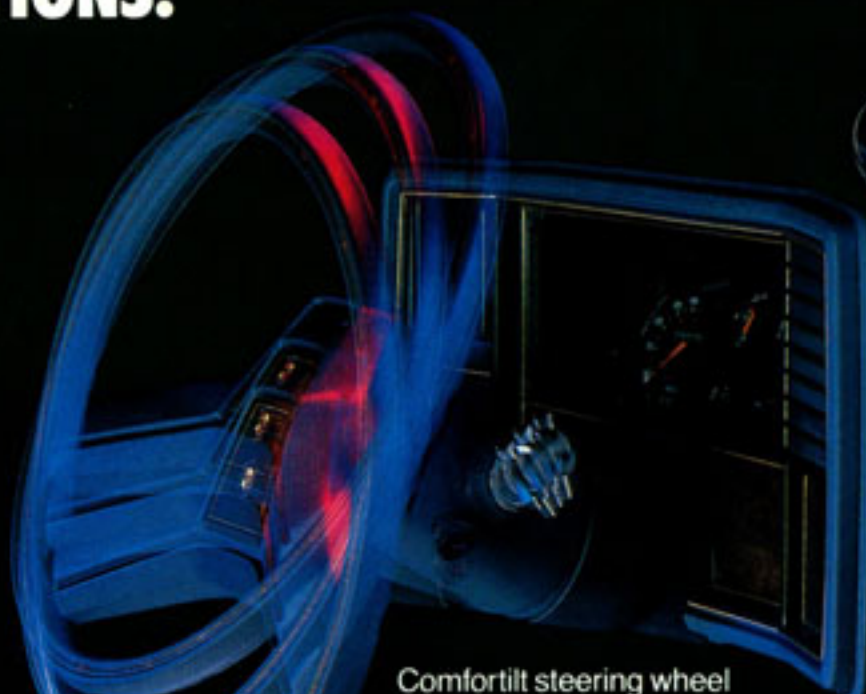
Comfortilt steering wheel