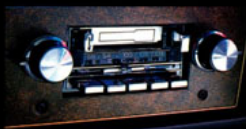
GM-Delco AM/FM stereo radio with cassette deck