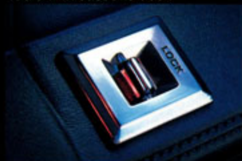
Power door locks