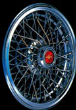
Wire wheel covers