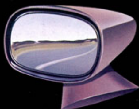
Dual Sport Mirrors

A word about engines. Some Chevrolet trucks are equipped with engines produced by other GM divisions, subsidiaries, or affiliated companies worldwide. See your Chevrolet dealer for details.