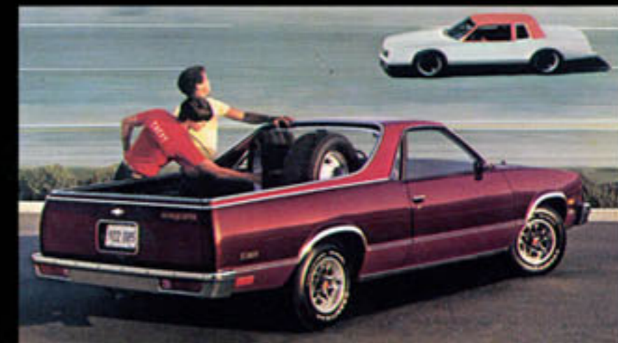
El Camino Conquista in Two-Tone Light Maroon Metallic/Maroon Metallic.