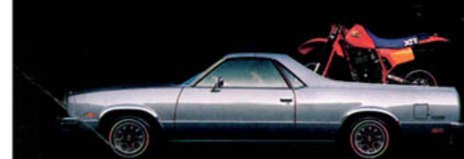
Standard El Camino in Bright Silver Metallic.