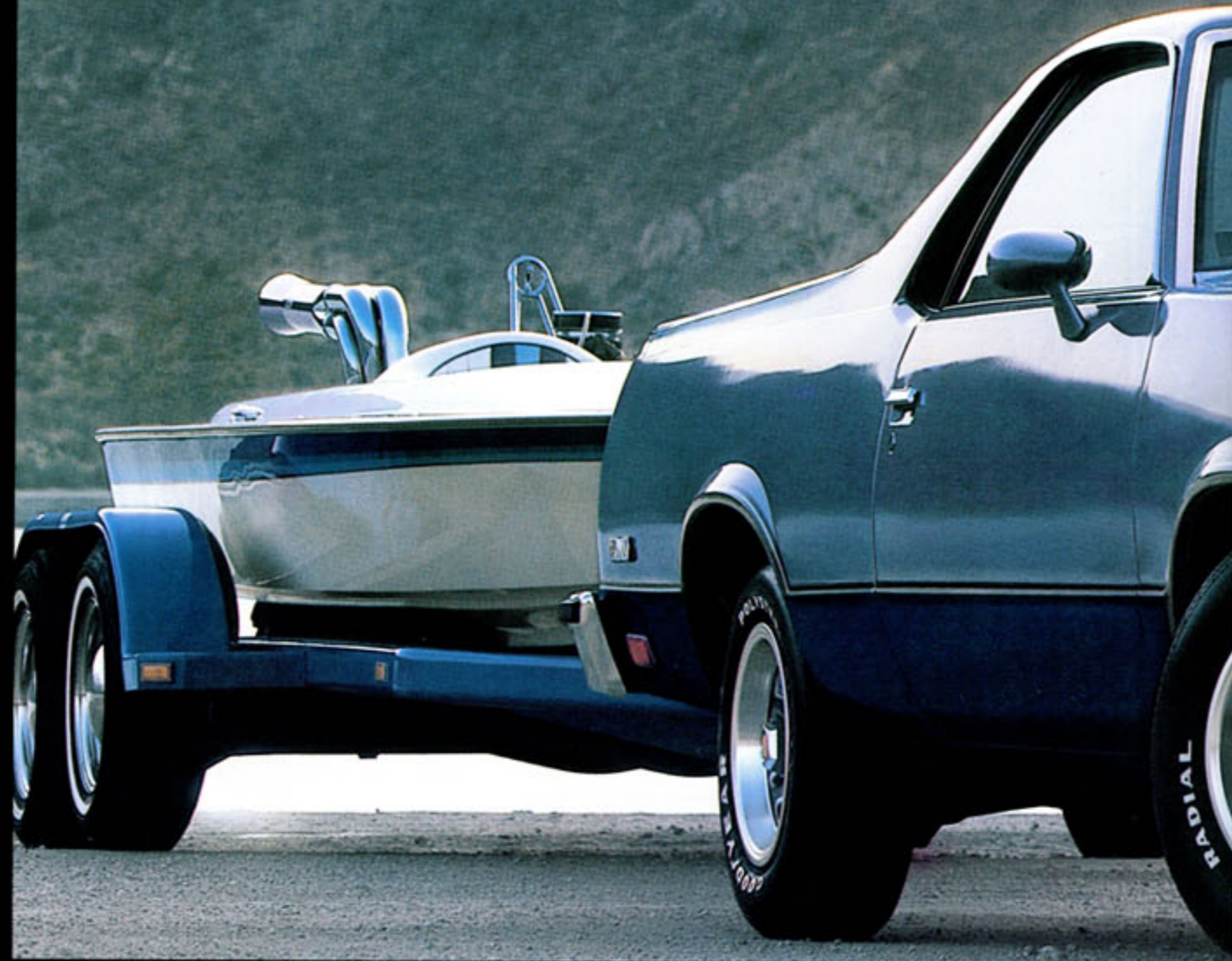
El Camino Sport Decor in Light and Dark Blue Metallic.

Tires supplied by various manufacturers.