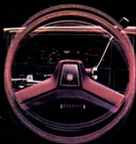
Comfortilt Steering Wheel

*Some options may require the purchase of other options. See your dealer for details.