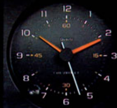
Quartz Analog Clock