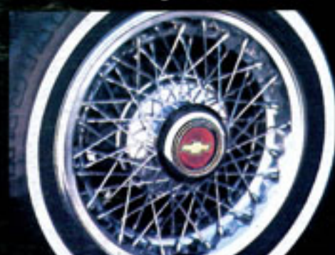
Wire Wheel Covers