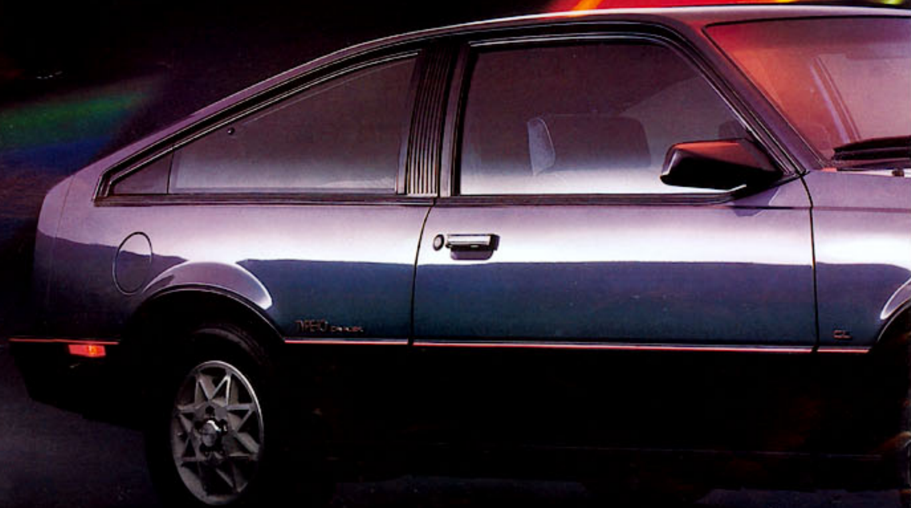
Cover: Cavalier Type 10 Coupe.

The first time you take the wheel of a Cavalier you'll know it's an exceptional car designed by people who love to drive. A light touch of the throttle moves you away from a traffic light so smartly, you'll be tempted to stop right there and open the hood. Surprise. It's a 2.0 Liter, 4-cylinder engine. Blessed, however,