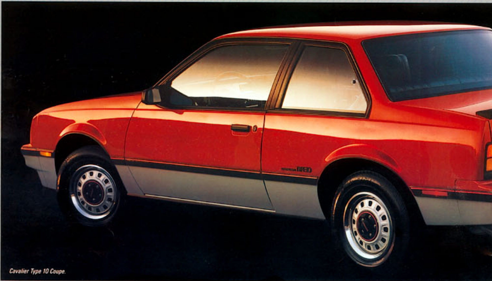
Cavalier Type 10 Coupe.

Two-tone paint, rear window defogger and wheel trim rings typify options available to enhance Cavalier's appearance, convenience and performance.