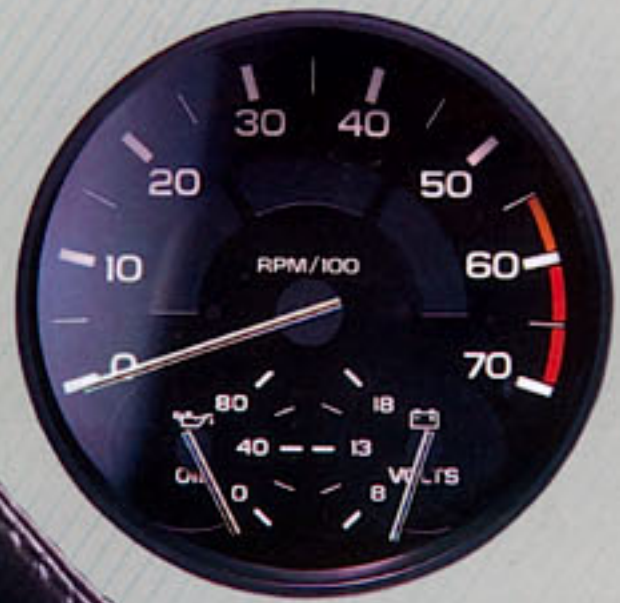
The available tachometer is large for quick reading.