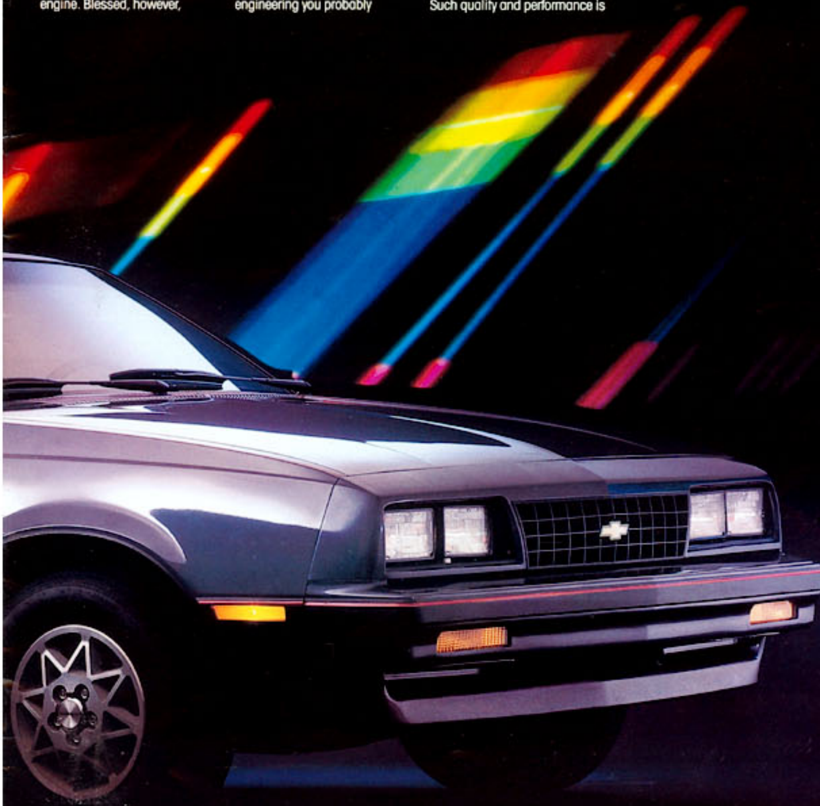
GM Wind Tunnel test results: Cd= .36

not accidental. It is born of relentless refinement of an advanced technology and meticulous design. And it reflects Chevrolet's unyielding commitment to make Cavalier the best small-car value in its class.