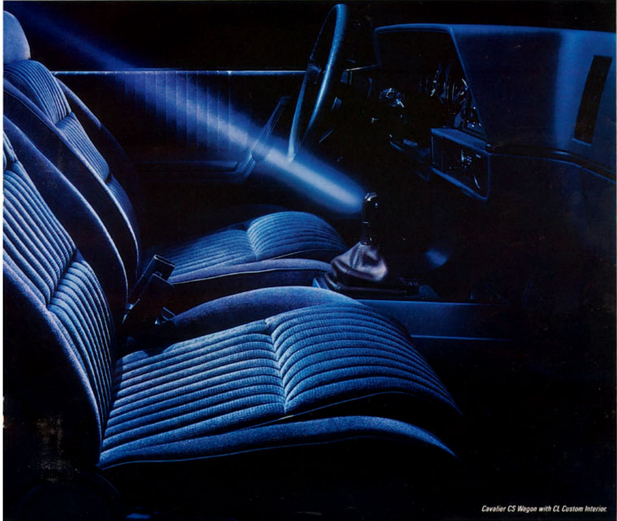
Cavalier CS Wagon with CL Custom Interior.