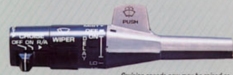
Cruising speeds now may be raised or lowered in precise increments at the touch of a finger when you order Cavalier's available electronic speed control with resume speed feature.