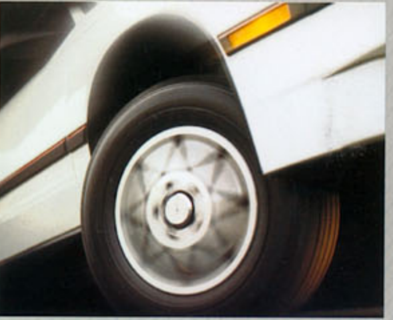
All Cavalier models may be ordered with F41 Sport Suspension for even more stability on rough or twisting roads and in severe weather.