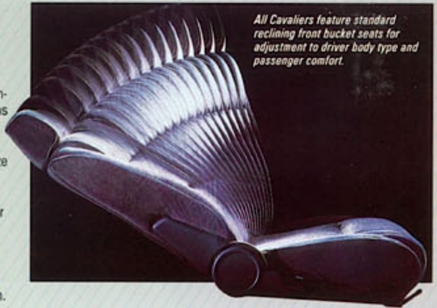
All Cavaliers feature standard reclining front bucket seats for adjustment to driver body type and passenger comfort.