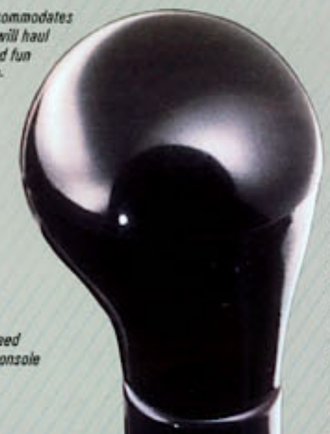
The available slick-shifting 5-speed features Cavalier's convenient console bin for coins or cassette tapes.