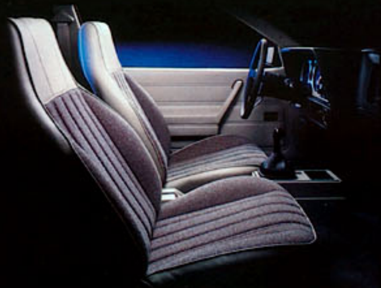
Type 10 and CS contoured reclining bucket seat.

laser-checked precision. Rack-and-pinion steering. MacPherson-strut front suspension. Computer-aided semi-independent rear suspension design. And, to help prevent bottoming on rough roads when you load up the big, 13.2-cubic-foot trunk, variable-rate rear springs. The available spoiler says you're serious about advanced aerodynamics. The available cloth interior, shown right, says you invest your money wisely.