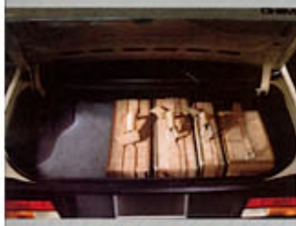
*Sedan/Wagon models only. **Type 10 models only. †Metallic.

Dark Brown† Light Maroon†† Red** Dark Fern† Light Fern† Light Bluert Dark Bluert Red Bright Silver†† Light Brown† Dark Brown†