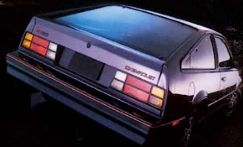
Cavalier Type 10 Hatchback