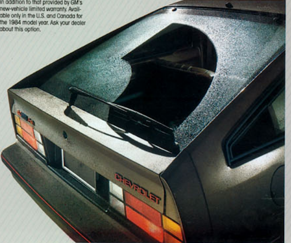
Rear window wiper and washer available on Type 10 Hatchback.