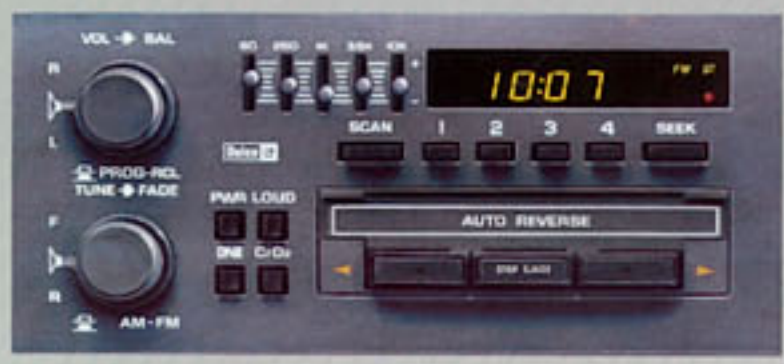
Here's Cavalier's most technologically advanced GM-Delco ETR™ AM/FM stereo radio: with a 5-slide graphic equalizer, dynamic noise reduction, a built-in power booster and dramatic back-lighting. Features include seek and scan, cassette tape and digital clock. Sophisticated circuitry locks onto your favorite station with sure sensitivity and accuracy.