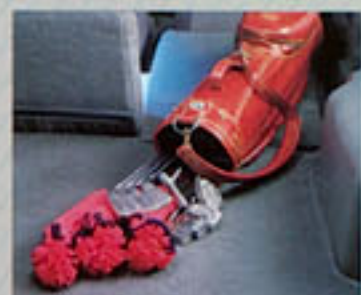
Split-folding rear seat-back is available.

There are many advantages to owning a small, front-wheel-drive wagon. Especially one as handsome as Cavalier. And Cavalier's sophisticated suspension assures you that there are no penalties to wagon ownership if you're the type who also loves to drive. Carry four friends or family members and their luggage. Or fold just one of the available split-folding rear seat-backs and take two friends and skis or scuba gear. Drop the second split seat-back and you open up 64 cubic feet of cargo room, with the high ceiling configuration wagon owners love to load. Whatever you're carrying, Cavalier's variable-rate rear springs help prevent suspension bottoming. And Cavalier's front-wheel drive helps take the worry out of both wet and winter driving.