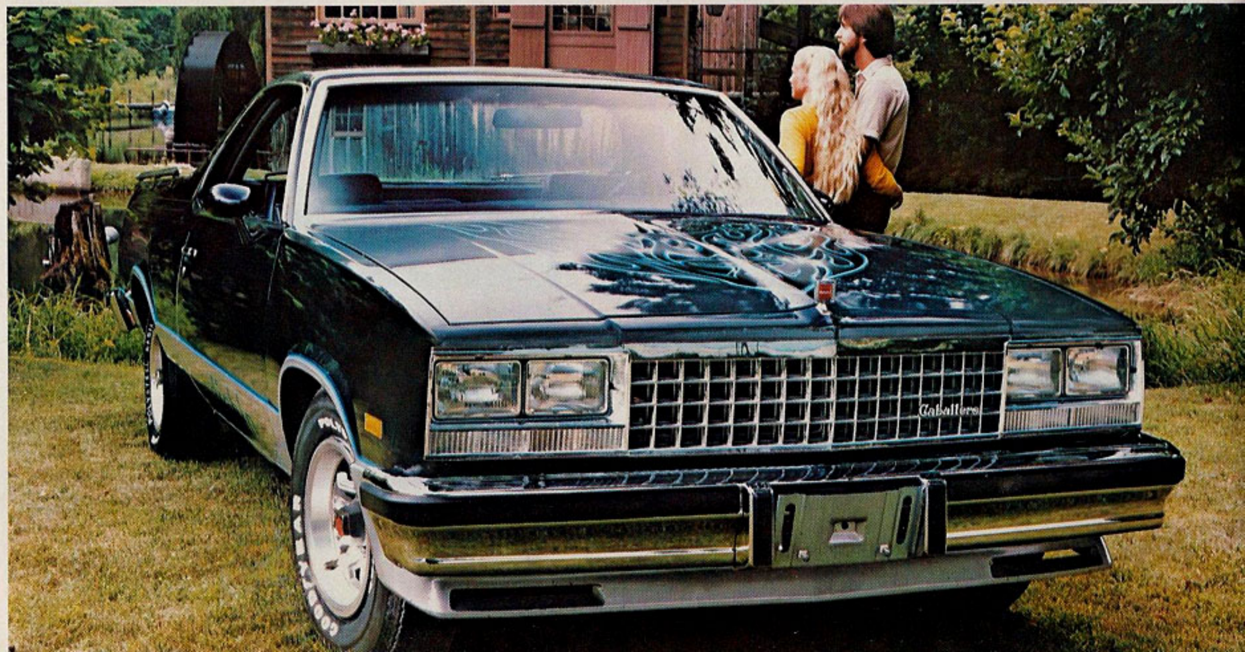
Cover—Caballero Top—Caballero Amarillo Bottom—Caballero Diablo Above vehicles shown with available equipment.