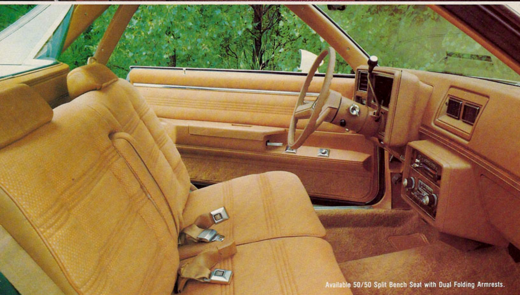
Available 50/50 Split Bench Seat with Dual Folding Armrests.