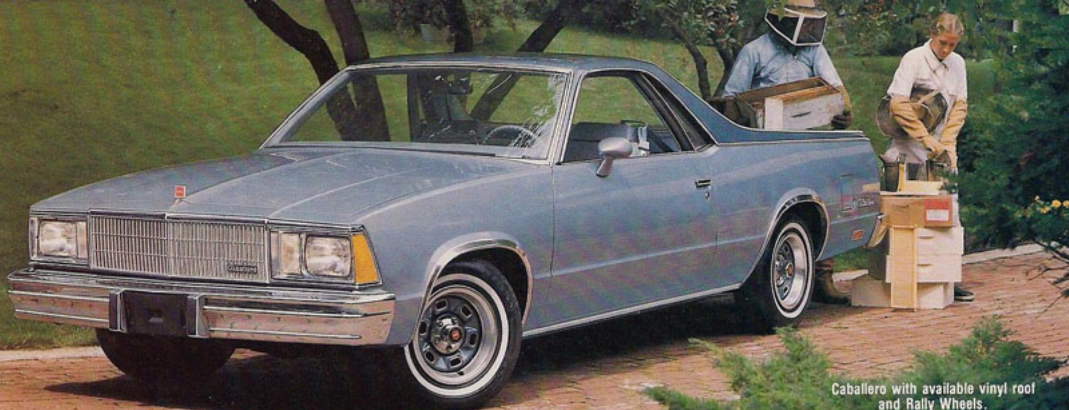
Caballero with available vinyl roof and Rally Wheels.