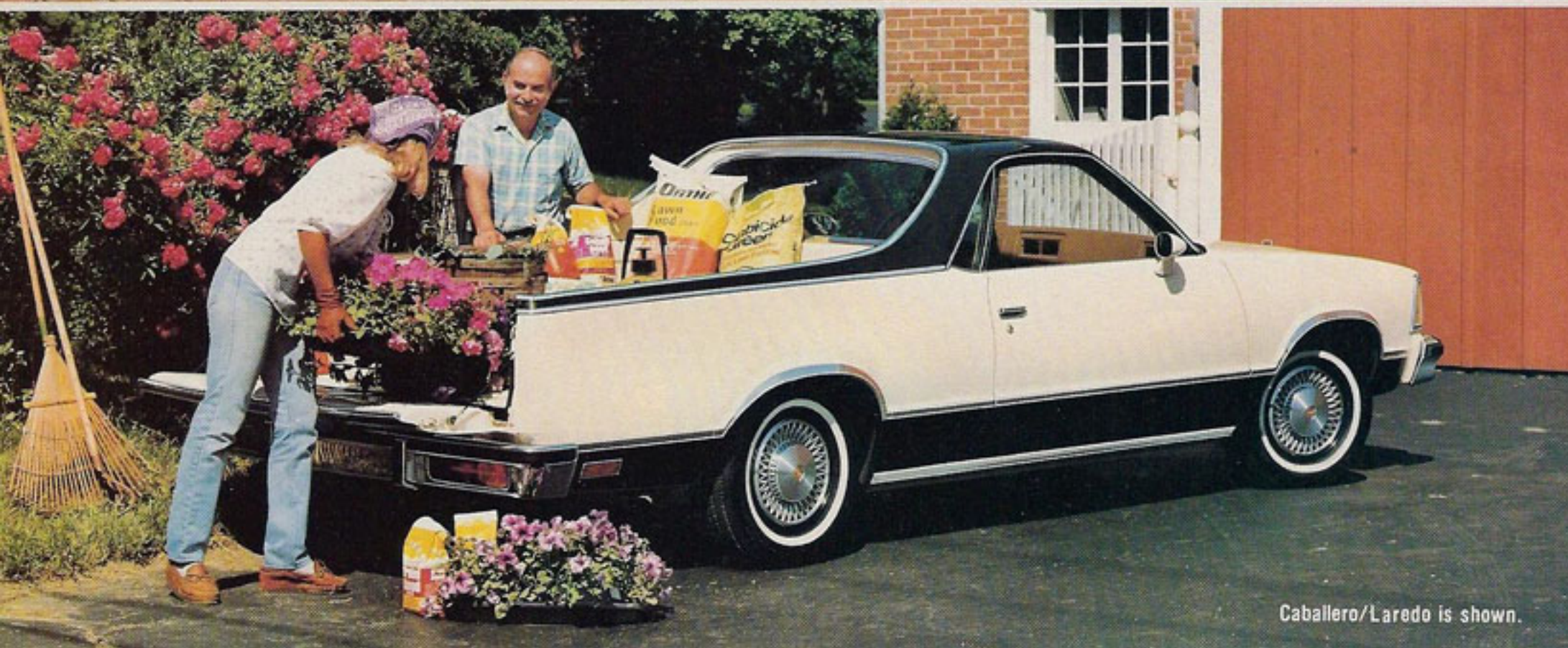
Caballero/Laredo is shown.