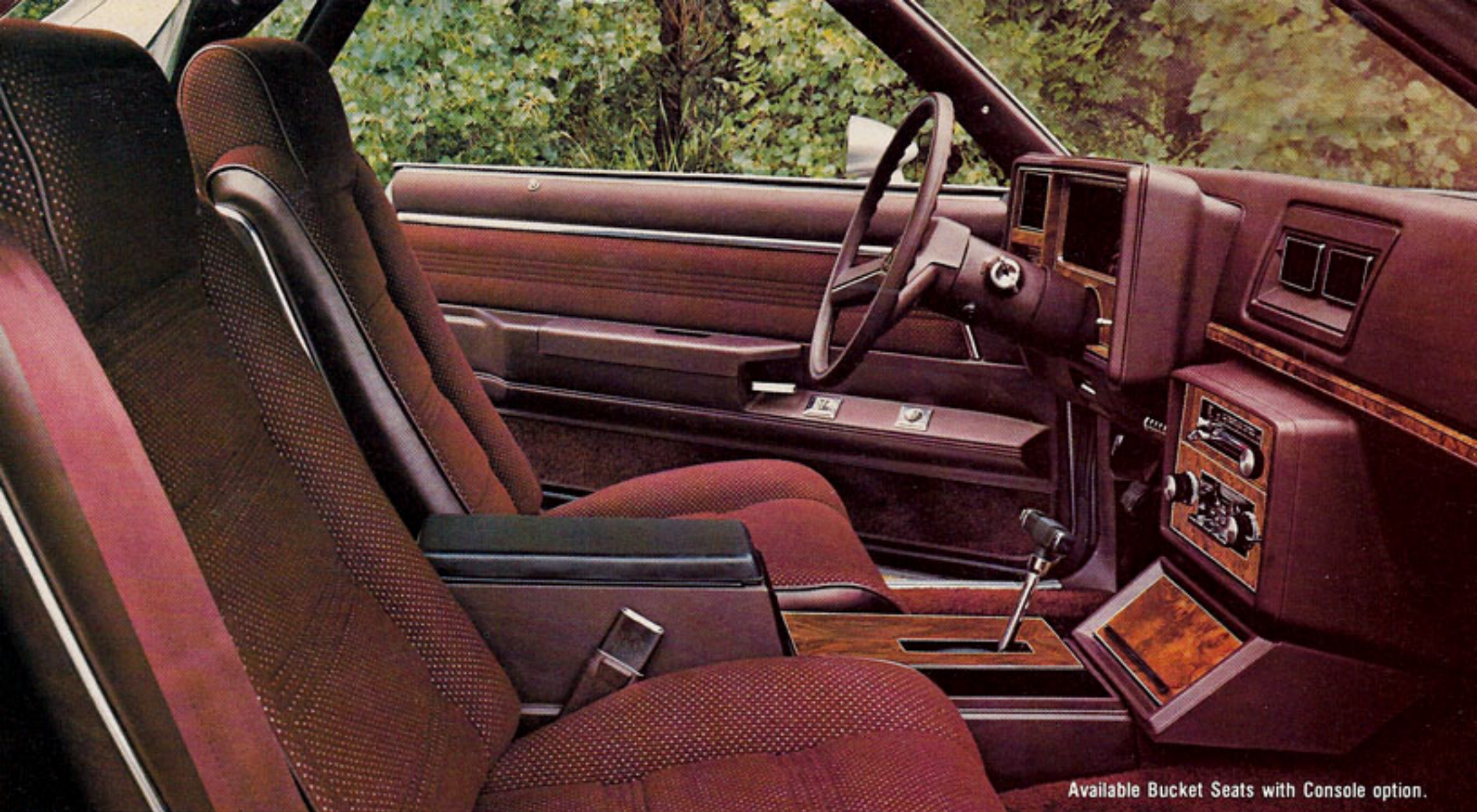
Available Bucket Seats with Console option.