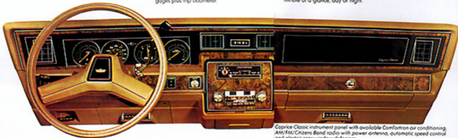
Caprice Classic instrument panel with available Comfortron air conditioning, AM/FM/Citizens Band radio with power antenna, automatic speed control and electric rear window defogger.

DIGITAL CLOCK. Electrically operated with trim digital dial that reveals hour and minute at a glance, day or night.