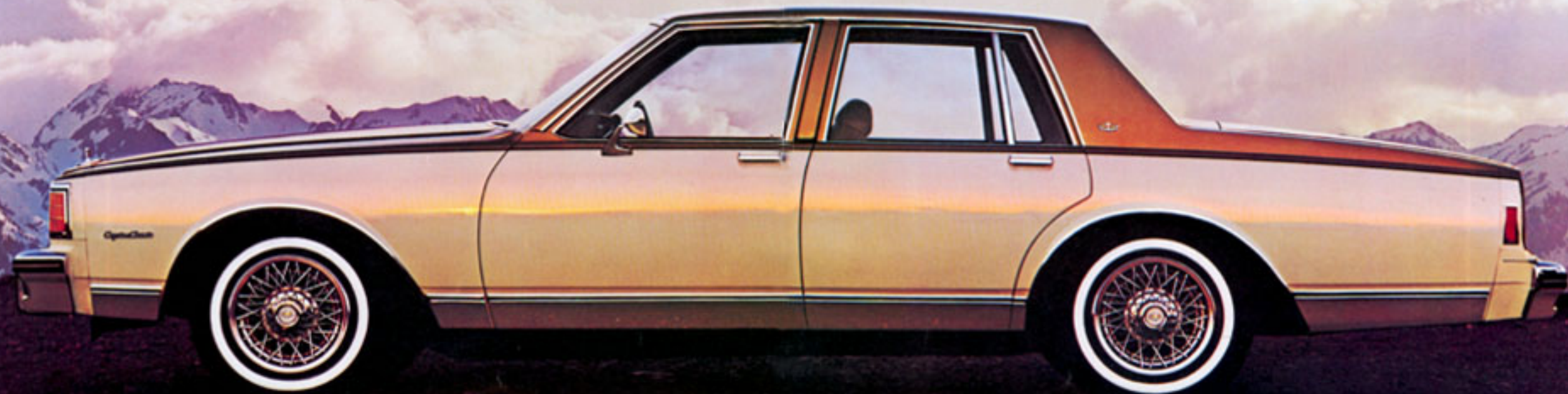
Caprice Classic Sedan shown in available Custom Two-Tone light camel metallic and beige with available bumper rub strips and guards, wire wheel covers and white-stripe tires.