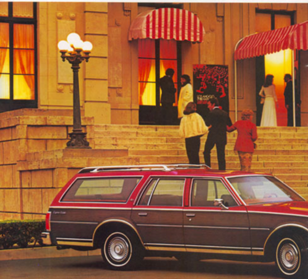
Caprice Wagon equipped with available roof carrier, right-hand outside rearview mirror, rub strip and bumper guards, Estate Equipment, tinted glass and whitewall tires.

The Chevrolets shown in this catalog are equipped with GM-built engines produced by various divisions. Please refer to the engine data sheet inserted in this catalog or available from your dealer for complete details about engine sources and availability.