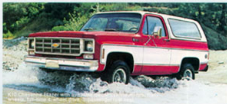
K10 Chevy Blazer with available 4-wheel drive and power windows.