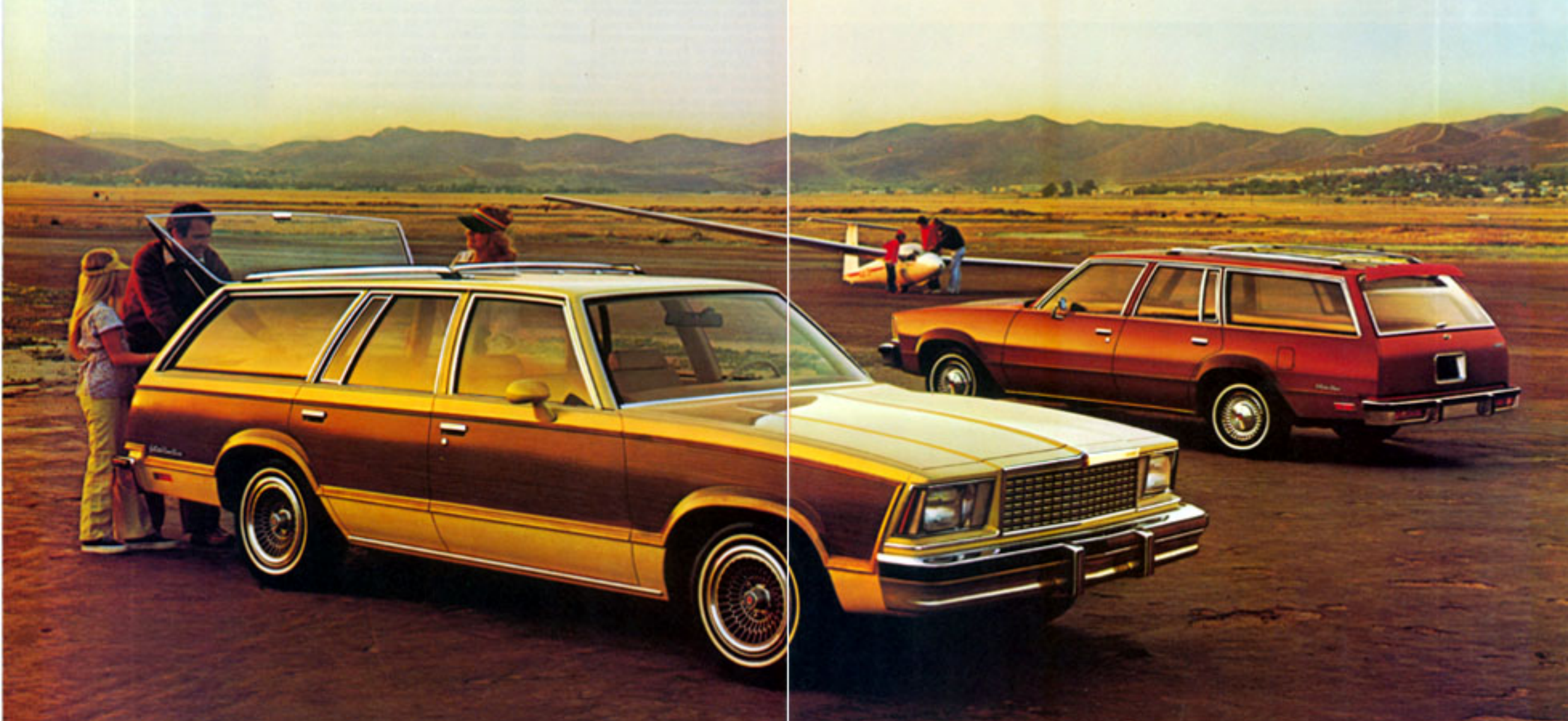
8 Malibu Classic Estate equipped with available roof carrier, whitewall tires, rear window air deflector, rub strip and bumper guards.

Meet the new 1978 Malibu and Malibu Estate Wagons soon. It could be the beginning of a long and beautiful friendship.