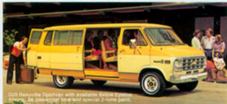
C30 Beauville Sportvan with available Below Eyeline mirrors, 3rd passenger seat and special 2-tone paint.

(For complete details, full specifications and more available options, ask your Chevrolet dealer for the 1978 Suburban, Blazer or Van catalog.)