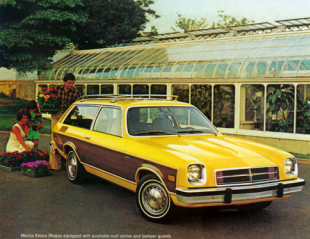
Monza Estate Wagon equipped with available roof carrier and bumper guards.