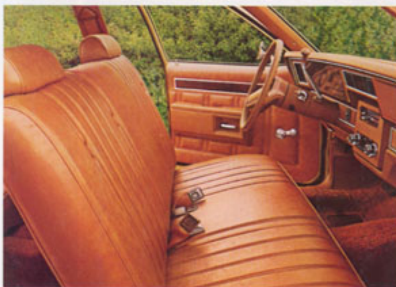
Impala standard vinyl interior.

Don't let the luxury and good looks throw you. This is a wagon with a positive genius for practical chores.