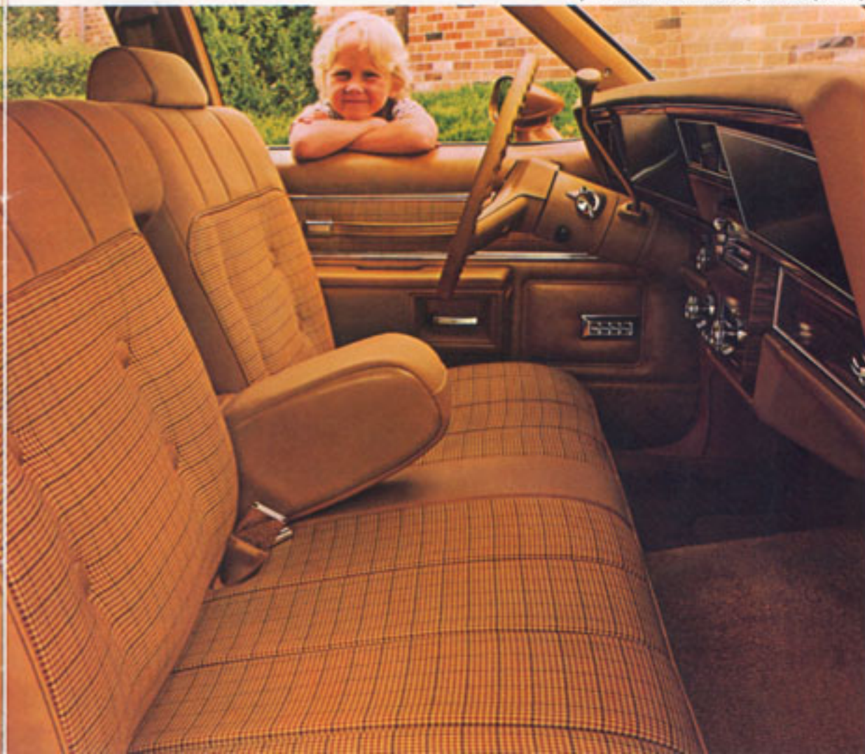
Caprice interior with available Sport Cloth upholstery.