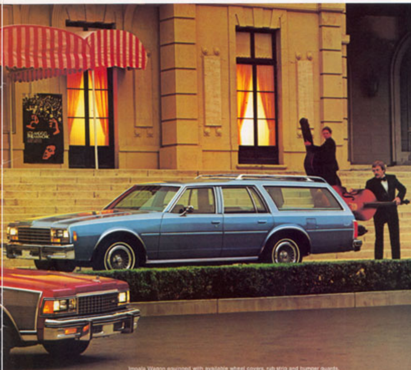
Impala Wagon equipped with available wheel covers, rub strip and bumper guards, roof carrier, body side moldings, whitewall tires and wheel opening moldings.

Available on Chevrolet Wagons are many Options and Custom Features. Many are illustrated or described in this catalog. Availability often depends on the model and other equipment selected. Your Chevrolet dealer has all the details.