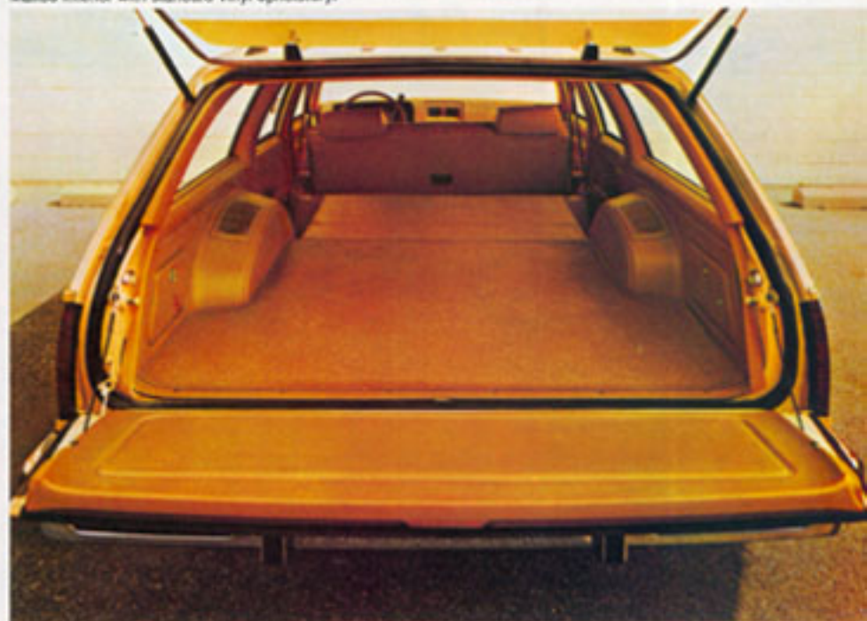
Load floor carpeting available on Malibu and Malibu Classic.