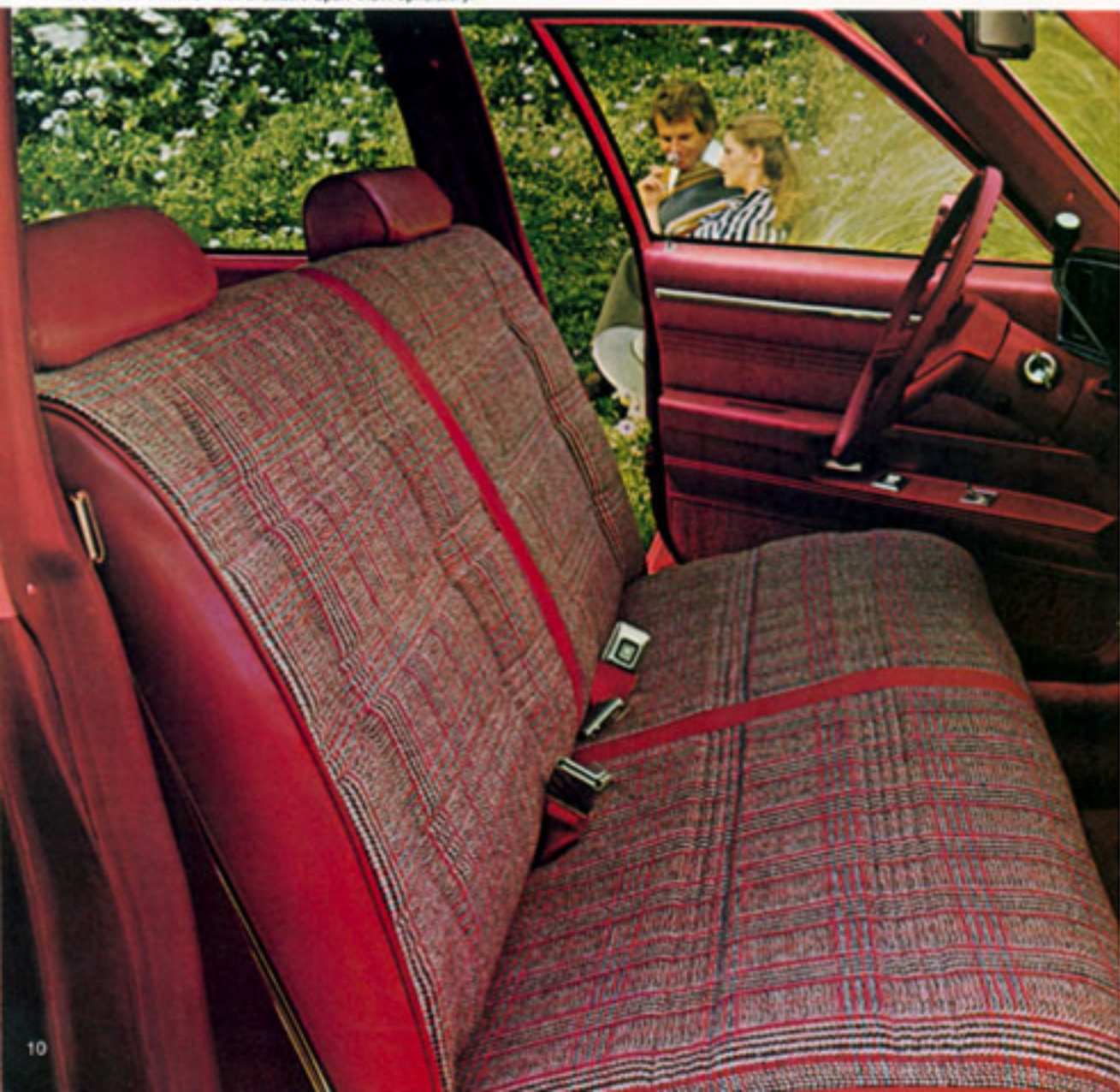
Malibu Classic interior with available Sport Cloth upholstery.

dows. This new dual window design also allows for easy entry and exit and gives you recessed rear door armrests. Behind the rear windows are swing-out vents to give your rear seat passengers draft-free ventilation.