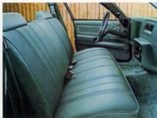
Malibu interior with standard vinyl upholstery.