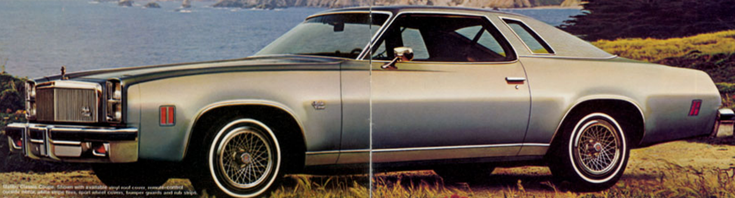
Shown with available vinyl roof cover, remote-control outside mirror, white stripe tires, sport wheel covers, bumper guards and rub strip.

You can verify that for yourself on the following pages.