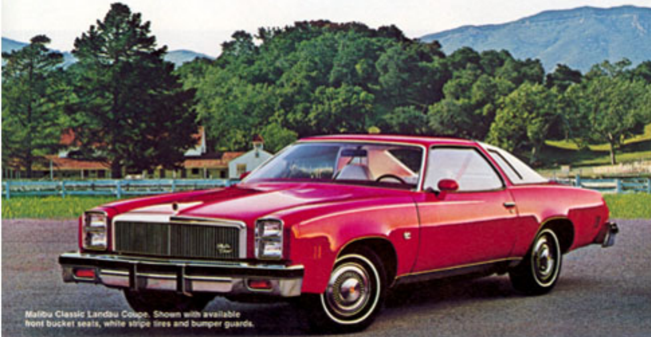
Malibu Classic Landau Coupe. Shown with available front bucket seats, white stripe tires and bumper guards.