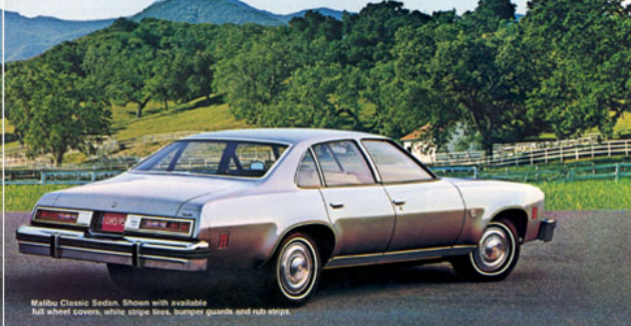
Malibu Classic Sedan. Shown with available full wheel covers, white stripe tires, bumper guards and rub strips.