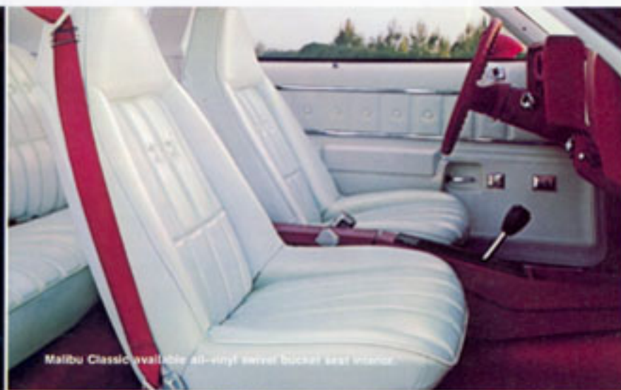
Malibu Classic available all-vinyl barrel bucket seat interior.