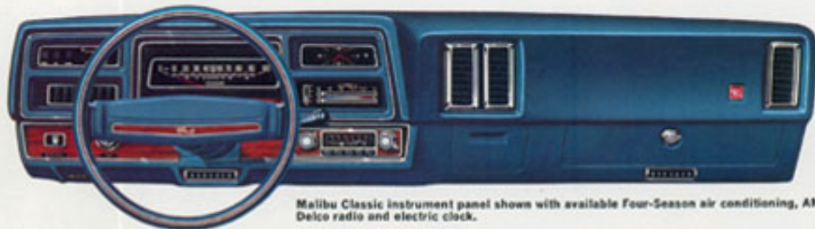
Malibu Classic instrument panel shows with available Four-Season air conditioning, AM/FM Delco radio and electric clock.