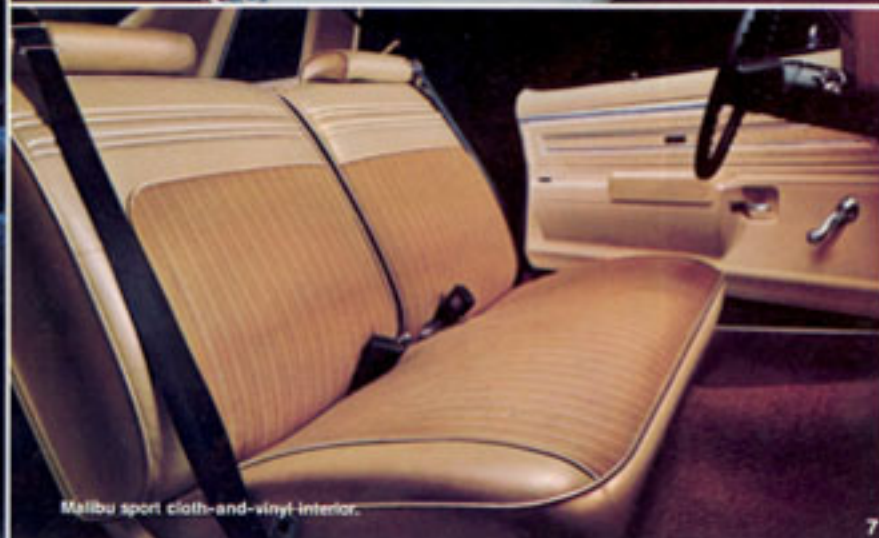
Malibu sport cloth-and-vinyl interior.