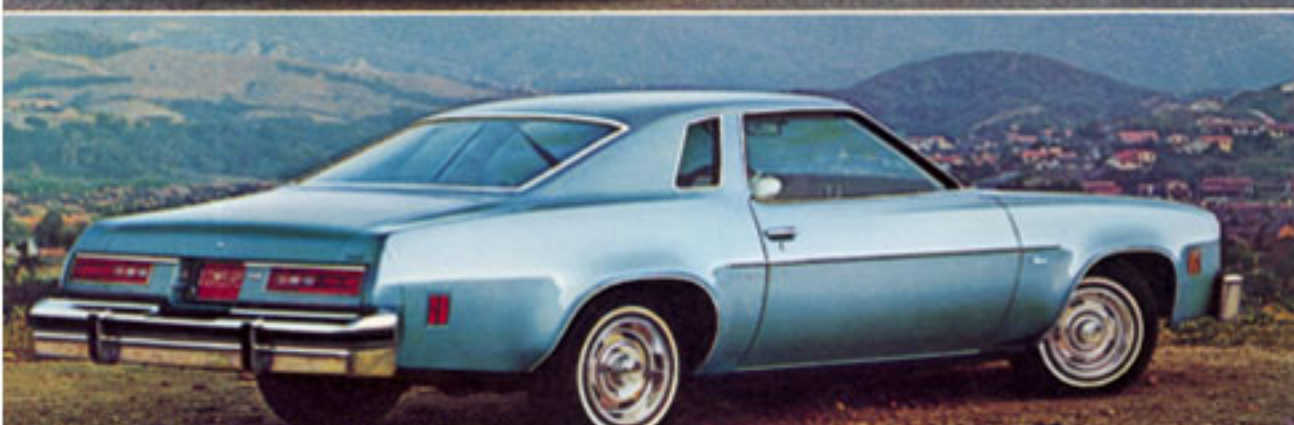
Malibu Coupe. Shown with available body side molding, Exterior Decor Package, Rally wheels, white stripe tires, bumper guards and rub strips.