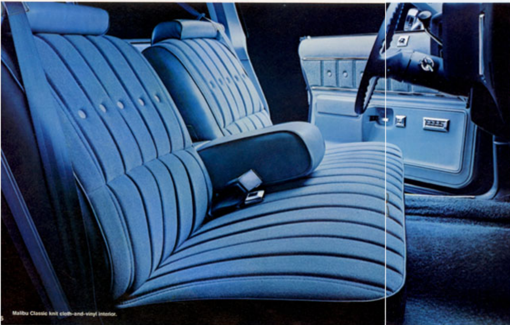
Malibu Classic knit cloth-and-vinyl interior.

The value and quality that have always distinguished the Chevelle Malibu are obvious once again this year in its handsome interior. It features rich nylon cut-pile carpeting stretching from wall to wall and a new sport cloth-and-vinyl upholstery in black, blue or buckskin. If you prefer all-vinyl upholstery, it's available in black or buckskin, plus white for coupe only (with accents in black, blue, green or firethorn).