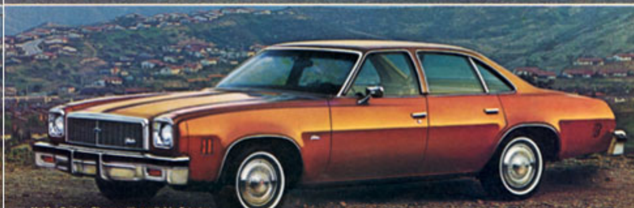
Malibu Sedan. Shown with available Exterior Decor Package, full wheel covers, white stripe tires, remote-control outside mirror, tinted glass, bumper guards and rub strips.