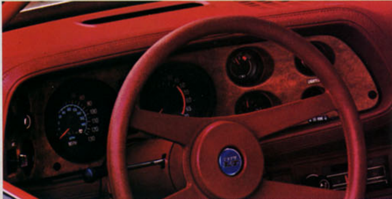
The Type LT instrument panel features a simulated leather instrument cluster facing, Special Instrumentation (tachometer, voltmeter, temperature gauge, electric clock), added instrument lighting, glovebox light and color-coordinated steering wheel with "Type LT" emblem.

aluminum rear trim panel, black-accented lower body sill areas and, inside, special bucket seats and luxury-level interior trim.