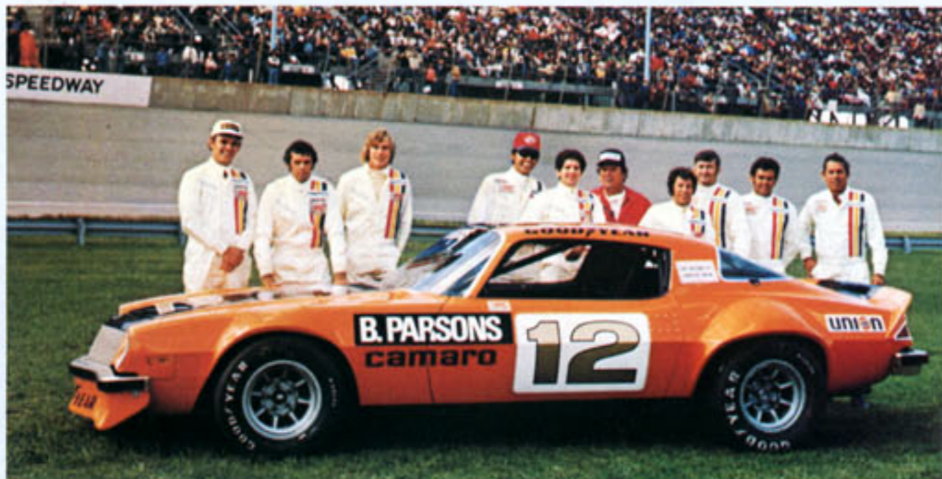
Camaro and admirers. Top race drivers compete in the "International Race of Champions," each driving an identically prepared Camaro, specifically equipped for racing. Shown left to right: Benny Parsons, Brian Redman, James Hunt, Richard Petty, Jody Scheckter, A. J. Foyt, Mario Andretti, Bobby Allison, Al Unser, David Pearson.

disc brakes, variable-ratio power steering, sport steering wheel, bucket seats in front, bucket-styled seats in the rear, and a cockpit and instrument