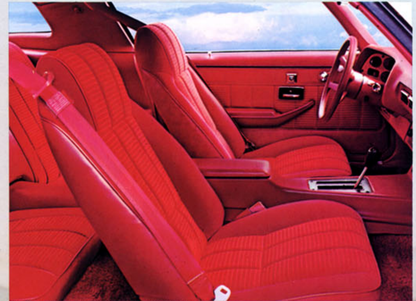
Camaro Type LT available knit cloth-and-vinyl interior.

You have your choice of nine standard all-vinyl interiors in the Type LT—solid blue or black; buckskin seats with saddle or black interior accents; or white seats with blue, black, firethorn, aqua or saddle interior accents. And there are five available knit-cloth seat interiors—solid blue; buckskin with saddle or black interior accent areas; firethorn with firethorn or black accent areas.