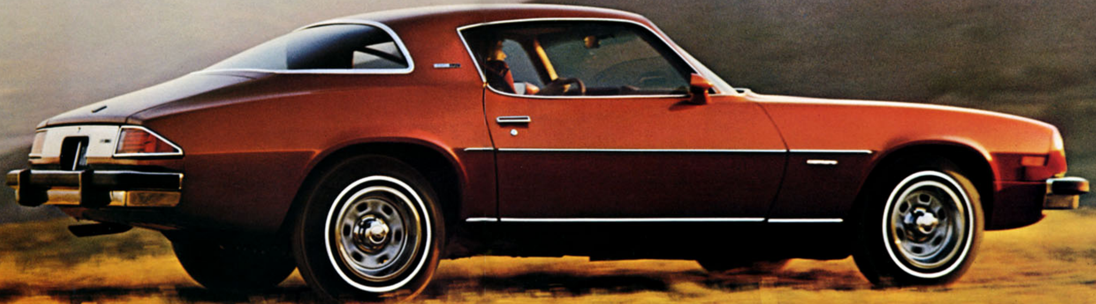
Camaro Type LT. Shown with available body side moldings, Style Trim Group, white stripe tires and bumper guards.