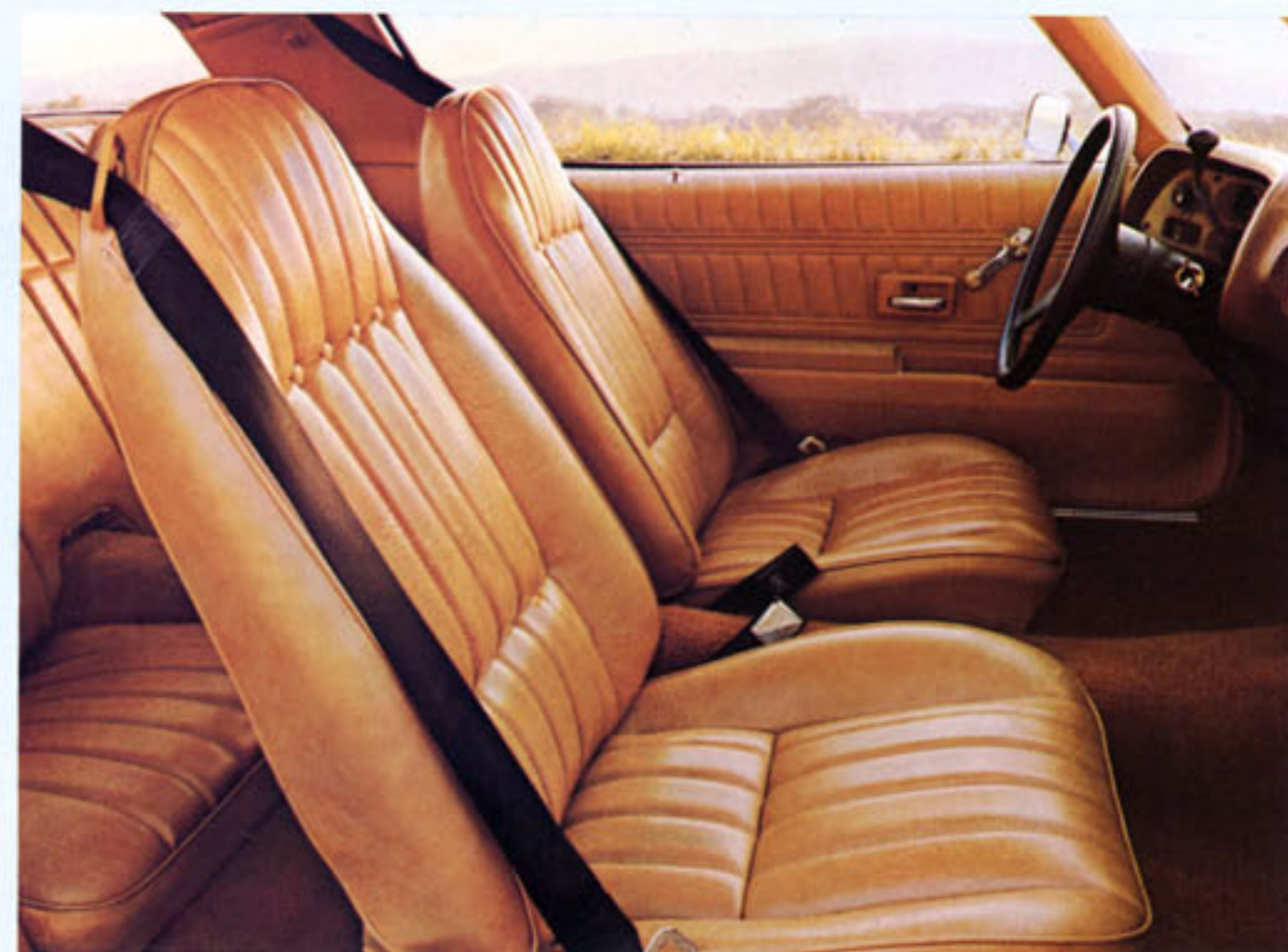
Camaro Sport Coupe standard all-vinyl interior.

You can choose your '77 Camaro Sport Coupe's standard all-vinyl interior in solid black or in colorful two-tones—white seats, headliner and door trim with aqua, black, blue, firethorn or saddle accent areas. There are also buckskin seats with saddle or black accent areas, and firethorn seats with black or firethorn accents in standard all-vinyl or in available sport cloth seat trim.