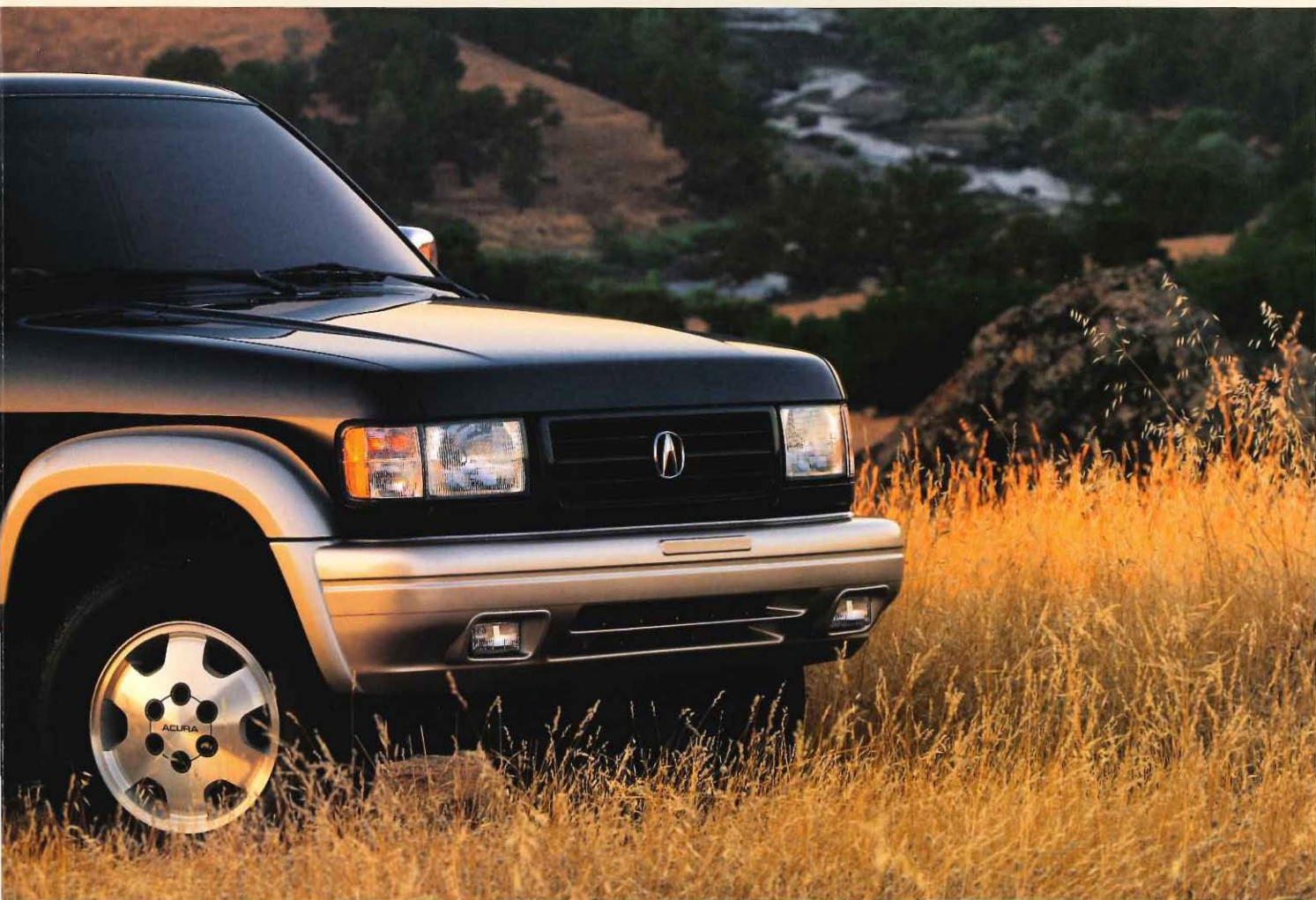
SLX with available Premium Package shown in Ebony Black