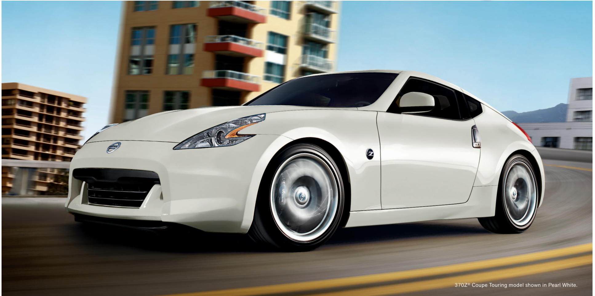
370Z® Coupe Touring model shown in Pearl White.