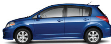
1.8 SL: ADDS UNEXPECTED FEATURES