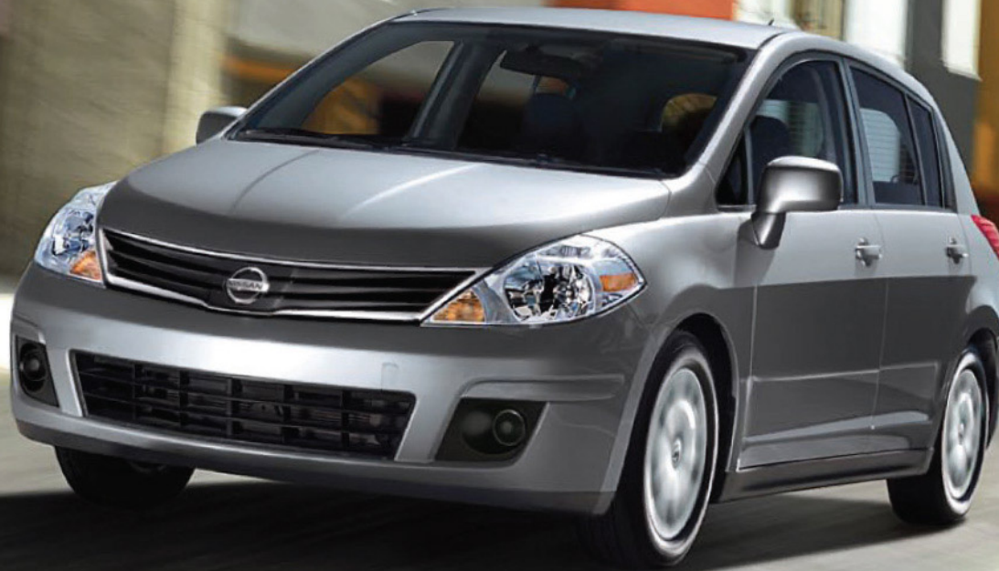
Nissan Versa 1.8 S Hatchback shown in Magnetic Gray.