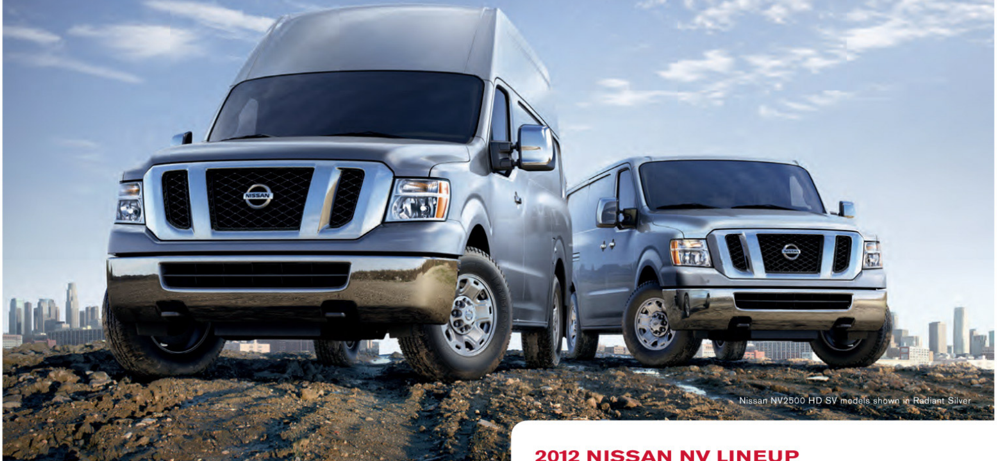
Nissan NV2500 HD SV models shown in Radiant Silver