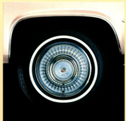
Fleetwood Brougham d'Elegance Wheel Disc.