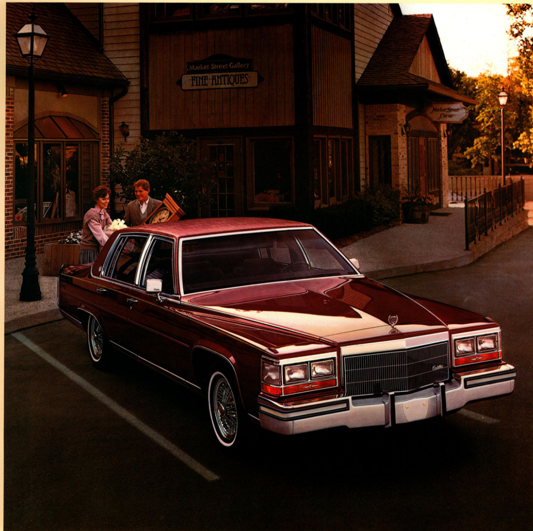
1986 Fleetwood Brougham Sedan shown in available Autumn Maple Firemist.