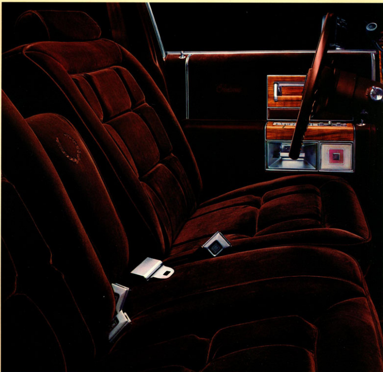
Interior shown with Dark Claret Heather cloth.

Your Fleetwood Brougham is a very special Cadillac. Featuring standard Heather Cloth interiors in four color offerings. You'll also be treated to an illuminated entry system, dual comfort 55/45 front seats (three-passenger), electronic climate control and a host of available features to make your Cadillac as distinctive as you are.