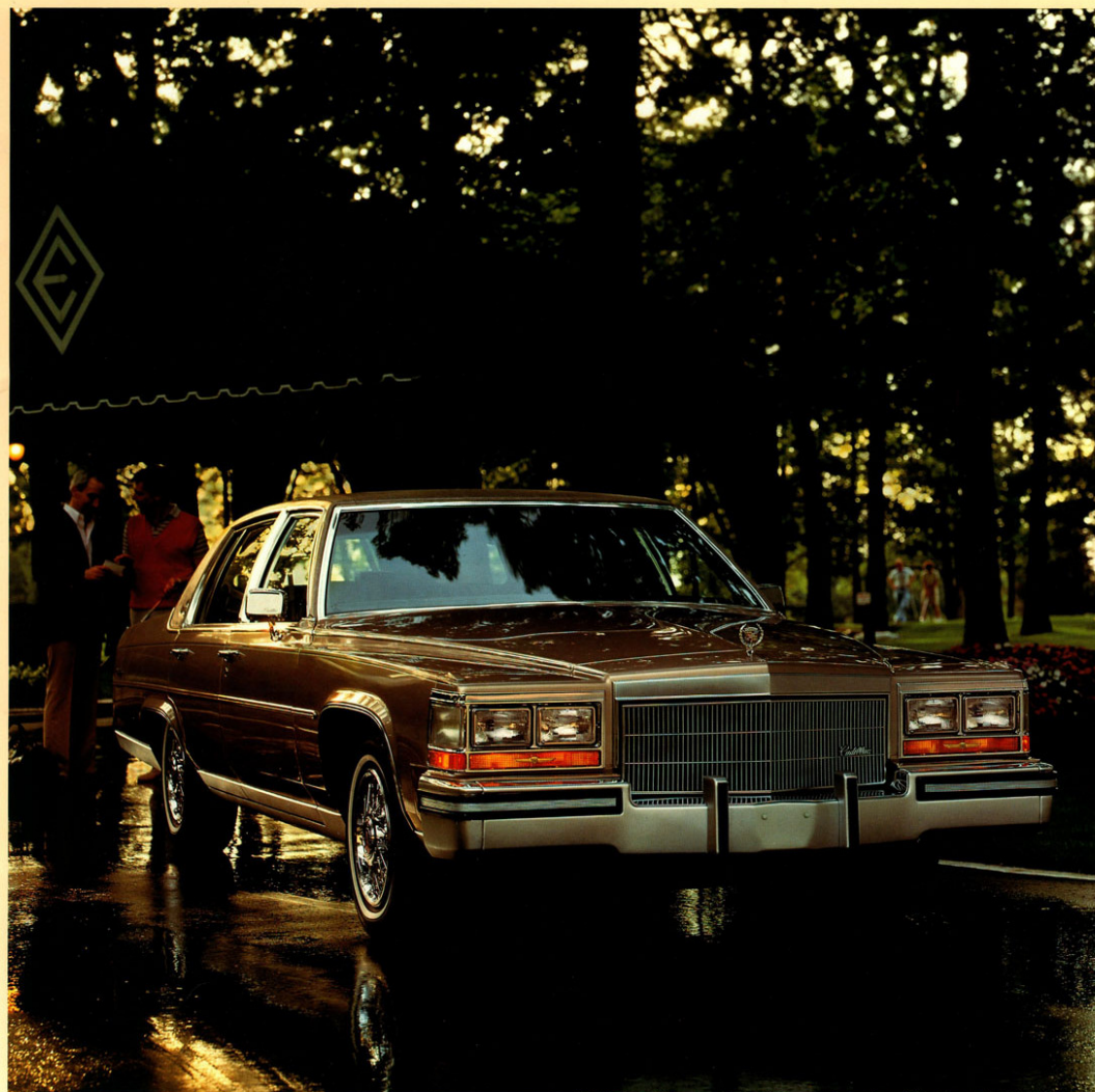
1986 Fleetwood Brougham Sedan d'Elegance shown in available Desert Frost Firemist.

Is it any wonder driving a new Cadillac is a pleasure to be envied?