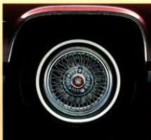
Genuine Wire Wheel.