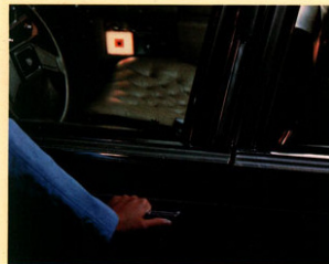
Illuminated Entry System.

Illuminated Entry System. Pushing either front door handle button illuminates keyhole and turns on inside courtesy lights for ease of entry.