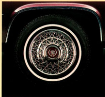
Wire Wheel Disc.