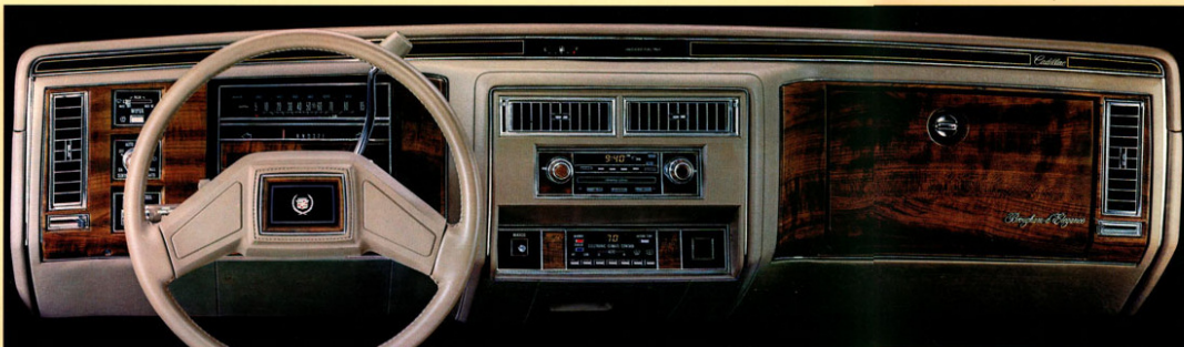
Fleetwood Brougham Instrument Panel.