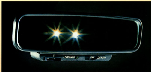
Automatic Day/Night Mirror.