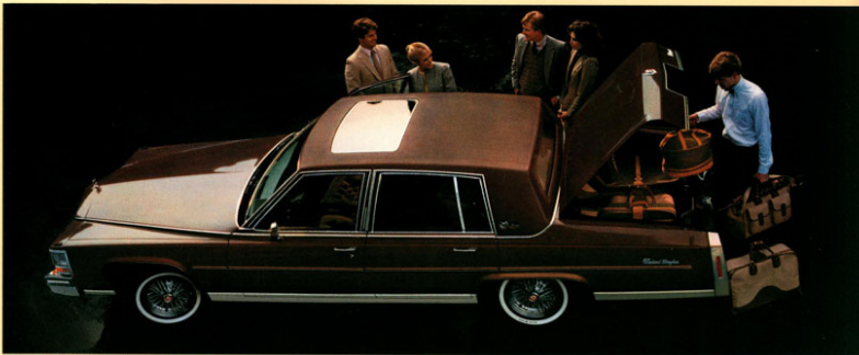
19.6 cubic feet of trunk capacity.