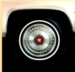
Fleetwood Brougham Standard Wheel Disc.