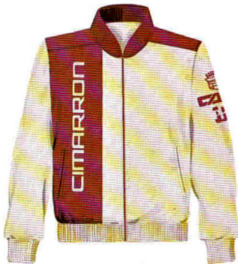
Light taupe poplin jacket with burgundy trim. Zip front, ribbed cuffs, band and collar. Cimarron screened down right front, logos embroidered on left sleeve.