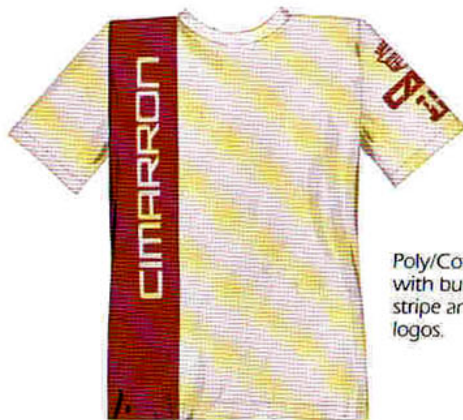
Poly/Cotton t-shirt with burgundy stripe and screened logos.