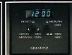
Maxima's time/date quartz clock.