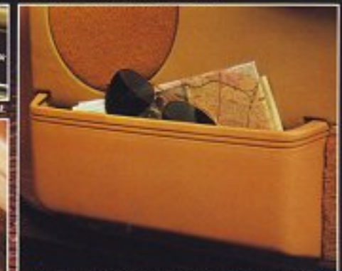
Map-pocket in the Maxima door provides a handy storage place.