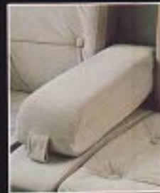
Maxima's fold-down rear armrest.