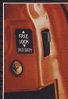
Child-safety locks on rear door.