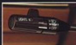
Handy stalk control for lights.