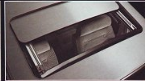
Roll back the electric sun roof and a wind deflector is deployed.