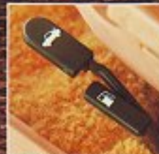
Remote fuel and cargo levers.