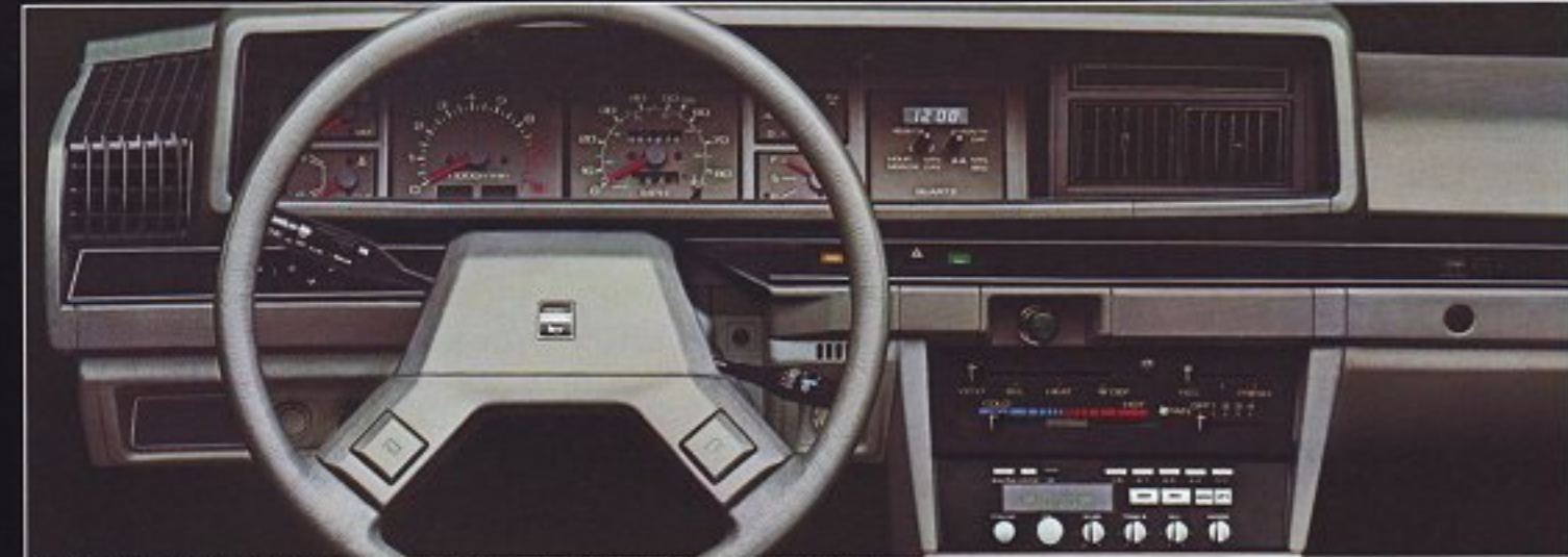
Maxima's handsome instrument panel has complete instrumentation, and almost every conceivable luxury already in place.