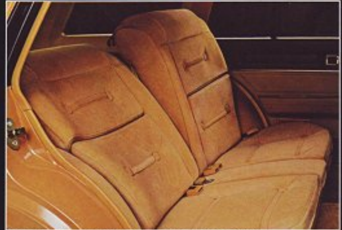
Maxima Wagon rear seats not only fold down individually, but they also recline.