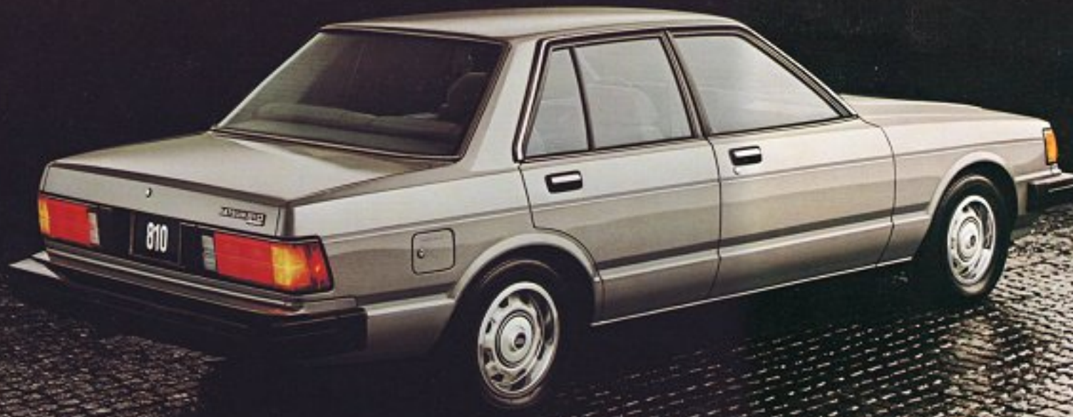
The 810 Deluxe Sedan, with its classic lines.

Before the designers began to make the 810 beautiful, the engineers made it special. These days most economical small-displacement engines are 4-cylinder designs. Not bad for an economy car or a sportster, but not what you'd demand in a luxury machine. Nissan powered the 810 with a smooth-running, powerful six—the latest evolution of the legendary Datsun 240-Z engine. You'll notice the difference. And Nissan's engineers did some things you won't notice, unless you're a mechanic. Or paying for one. Valves are operated by not just one but two carefully matched sets of springs. The ignition is electronic, with no points and no condenser to service. Our new generation 3-way catalytic converter actually keeps engine performance up, rather than robbing you of power. It's the most sophisticated system available, with a "sniffer" that feeds exhaust gas data to the fuel injection computer and constantly refines the fuel/air mixture going to the engine. It's not only better for performance, but it also cleans out more pollutants than the 2-way converters on most cars. It was all done to insure quality. That's because we know the most demanding quality inspector is the one at the end of the line. It's you.