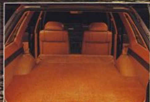
Spacious rear area of the 810 DL, with the 11 tie-downs, 2 tie-downs.