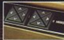
Power mirror controls in armrest.