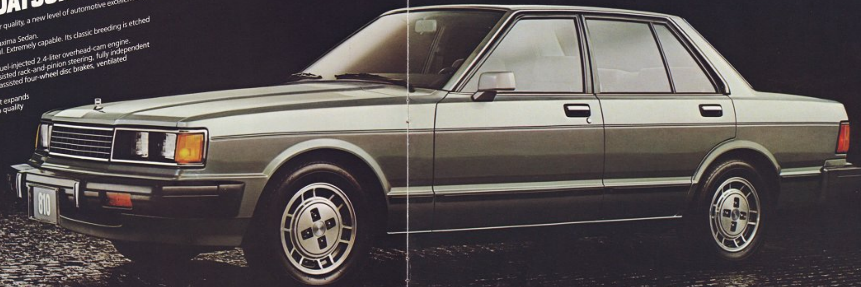
The all-new Datsun 810 Maxima 4-Door Sedan.