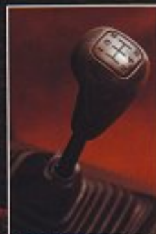
Five-speed shift, standard on DL.