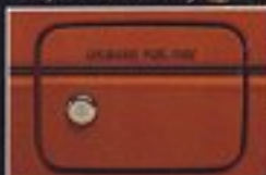
Locking filler door is standard.