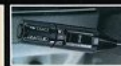
Cruise control, a Maxima standard.