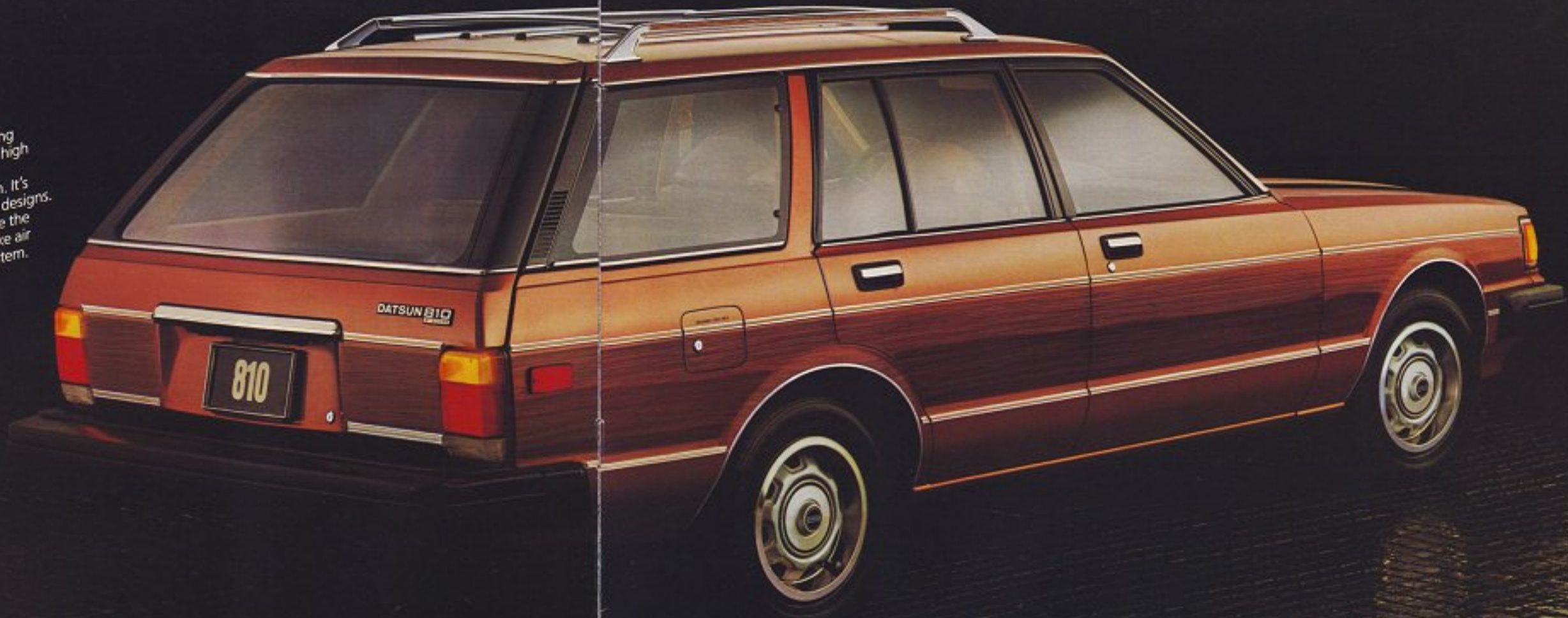
The all-new Datsun 810 Deluxe Wagon, with optional roof rack, wheel lip moldings and woodgrain trim