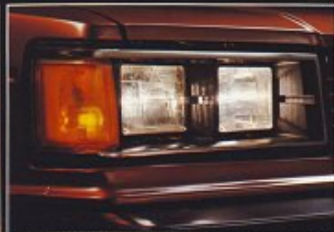
Quad-beam headlights with halogen high beam, standard on every 810.