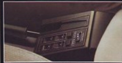
Console has master controls for power windows and remote door locks.