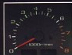
Tachometer is standard on Maxima.