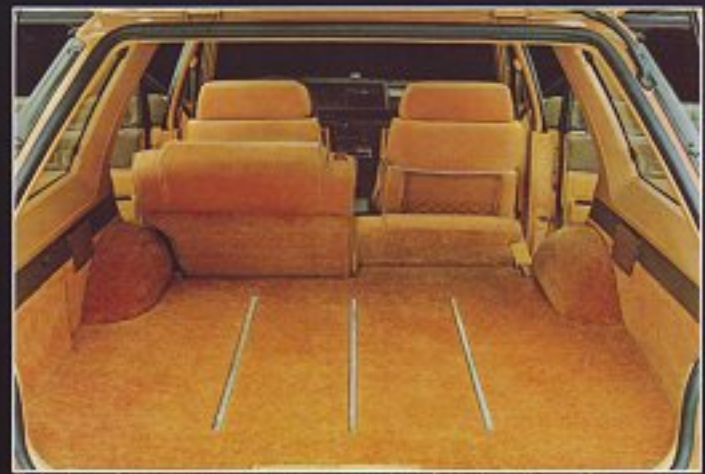
The load area of the Maxima Wagon is spacious and luxuriously finished in wall-to-wall Saxony carpeting.