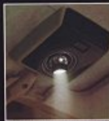
Maxima's swivel spot map light.

Datsun Maxima. A new level of automotive excellence.