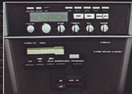
AM/FM digital stereo and cassette tape dock are optional on DL.