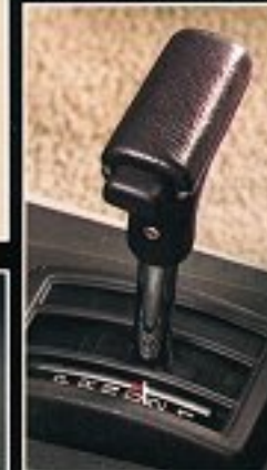
Maxima's standard automatic.