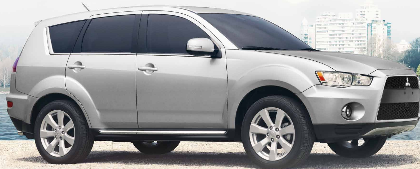
Outlander XLS in Cool Silver