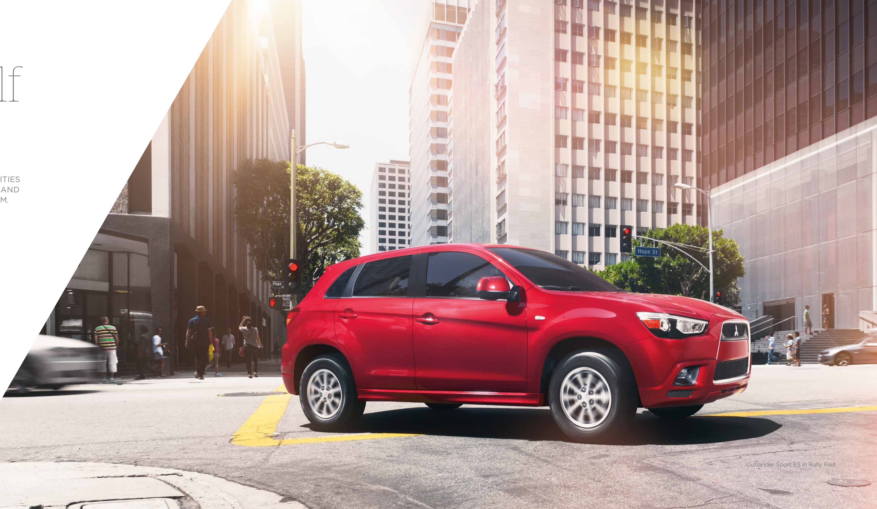
Outlander Sport ES in Rally Red

The entertainment system is controlled through the sharp 7-inch LCD touch screen, where you can browse your music library. Complete with a DVD player and a digital music server, it holds as many as 3,000 of your favorite tunes. Additional functionality includes the ability to set the behavior of systems such as power locks and interior lighting.