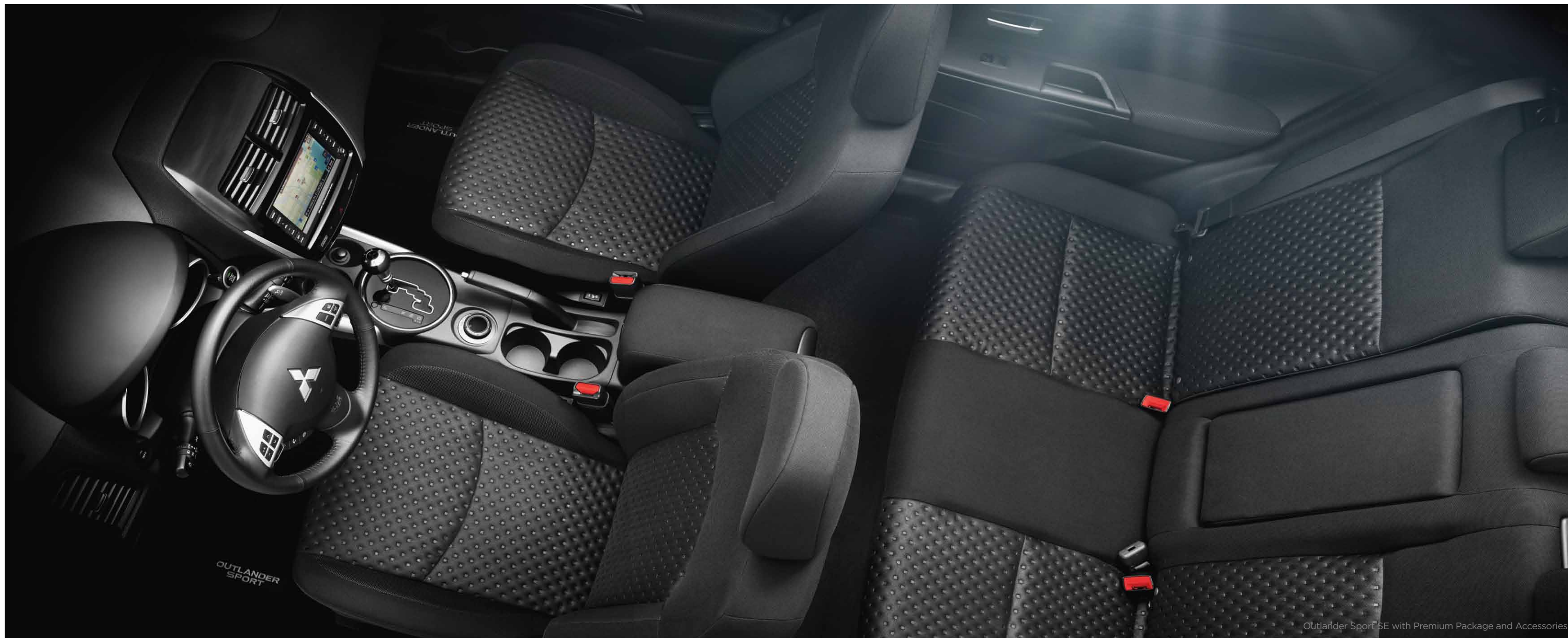
Outlander Sport SE with Premium Package and Accessories