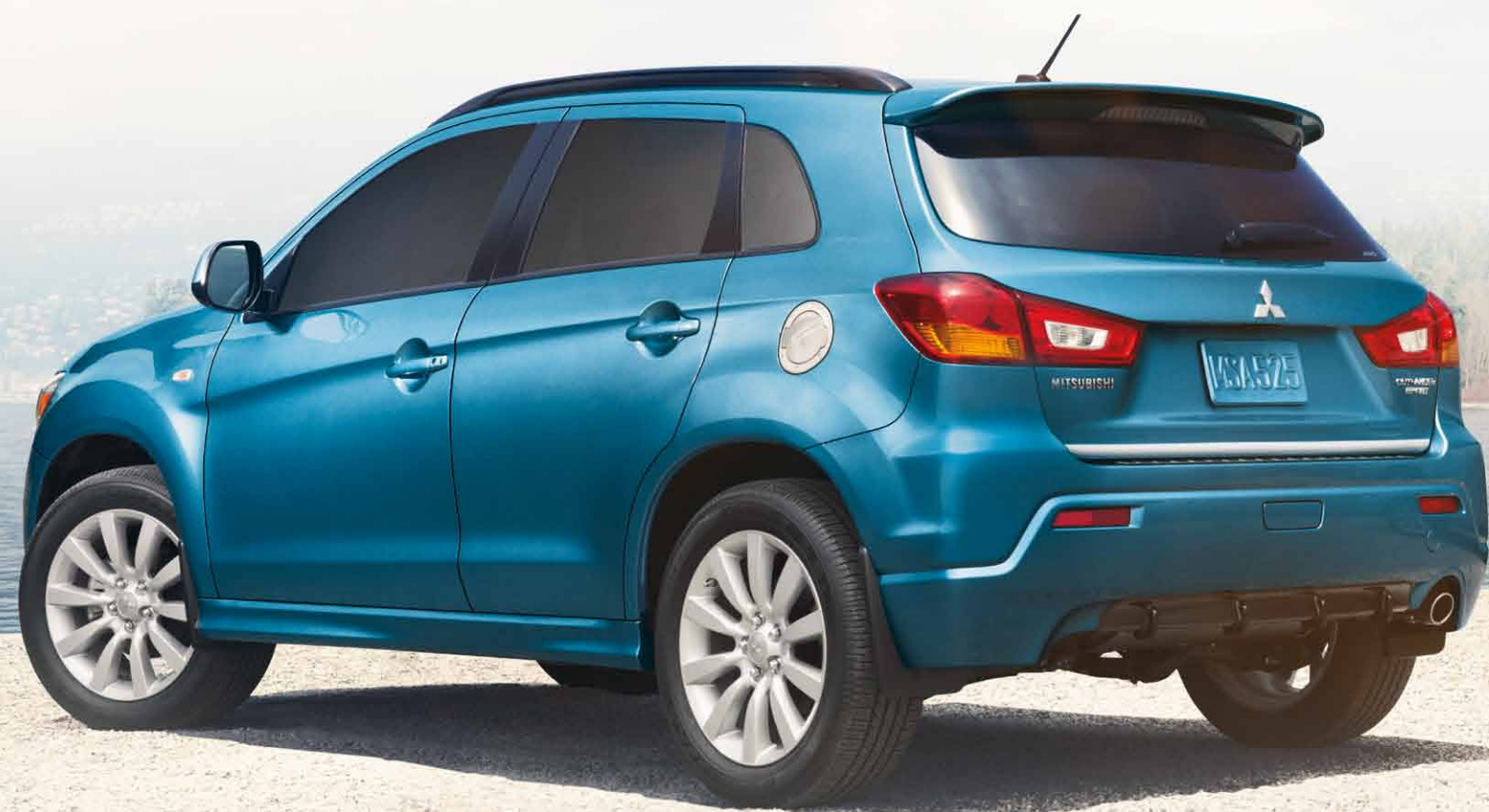
Outlander Sport SE with Premium Package and Accessories in Laguna Blue