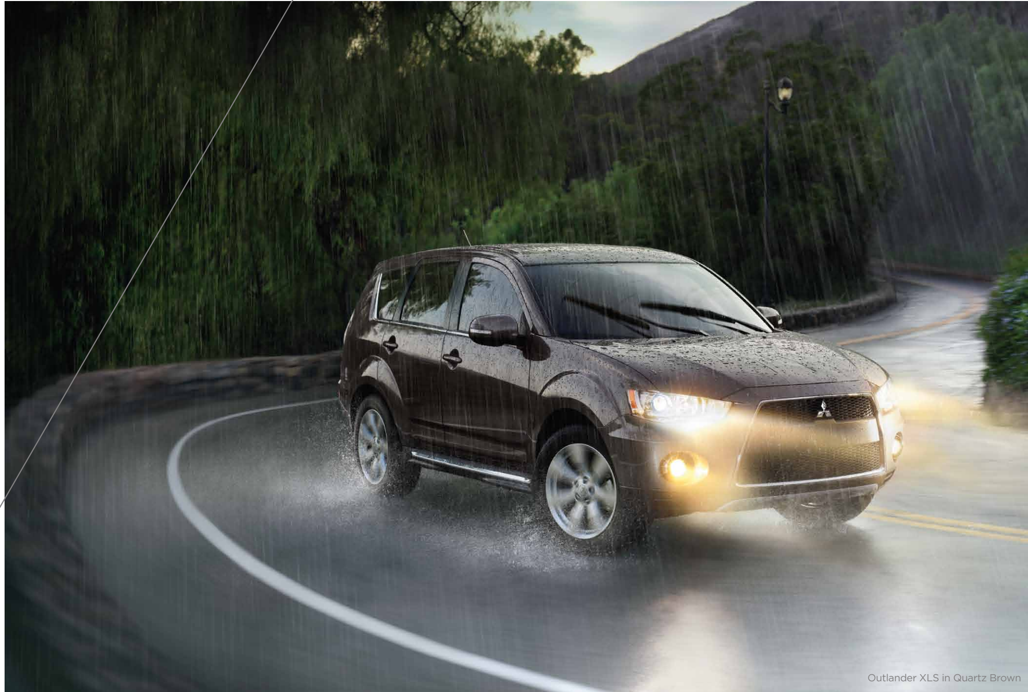
Outlander XLS in Quartz Brown