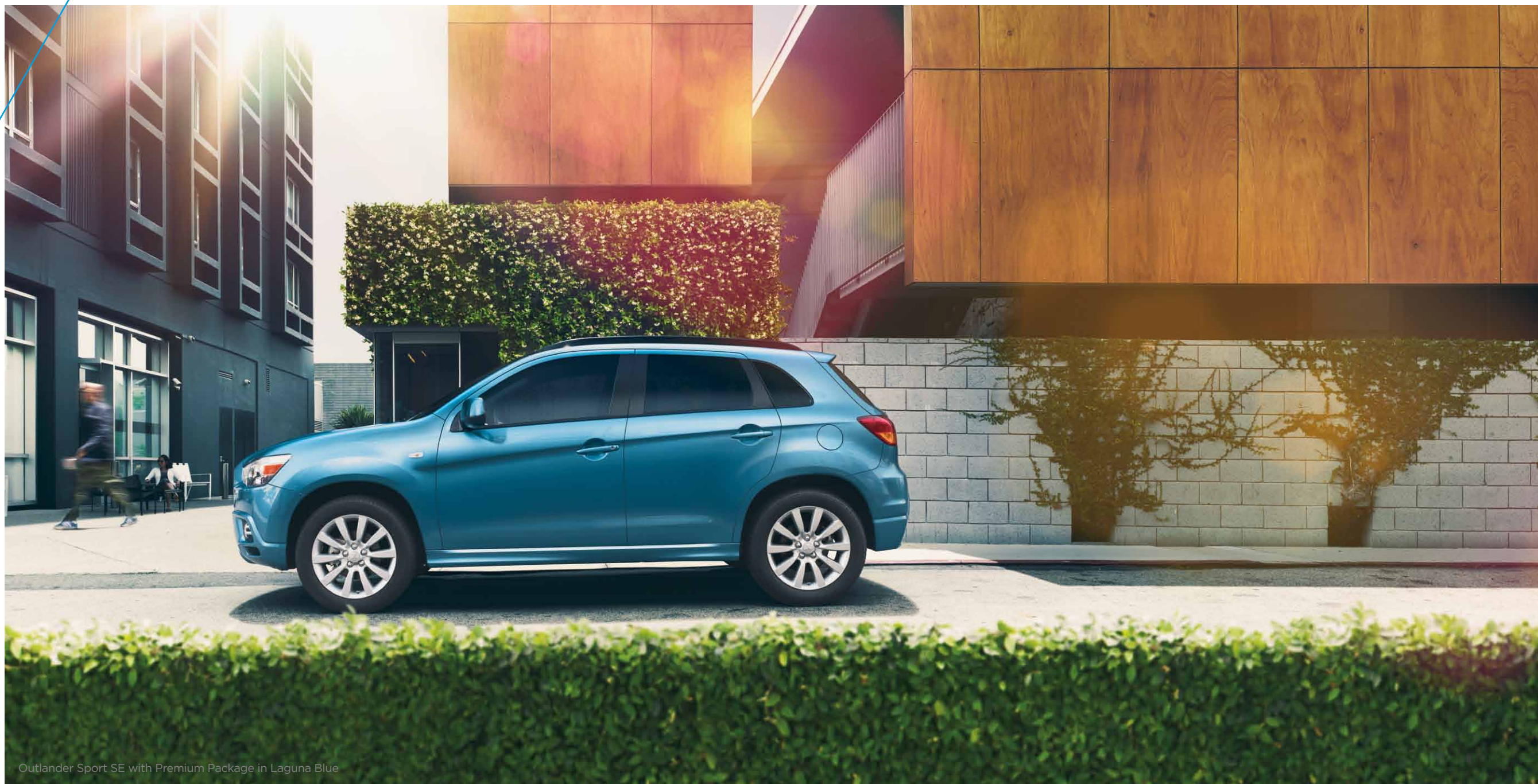
Outlander Sport SE with Premium Package in Laguna Blue