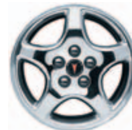
16" chrome-finished cast-aluminum. Included and only available on 1SA and 1SE with Chrome Sport Package.