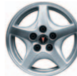
15" cast-aluminum Sport. Standard on 1SA and 1SE.