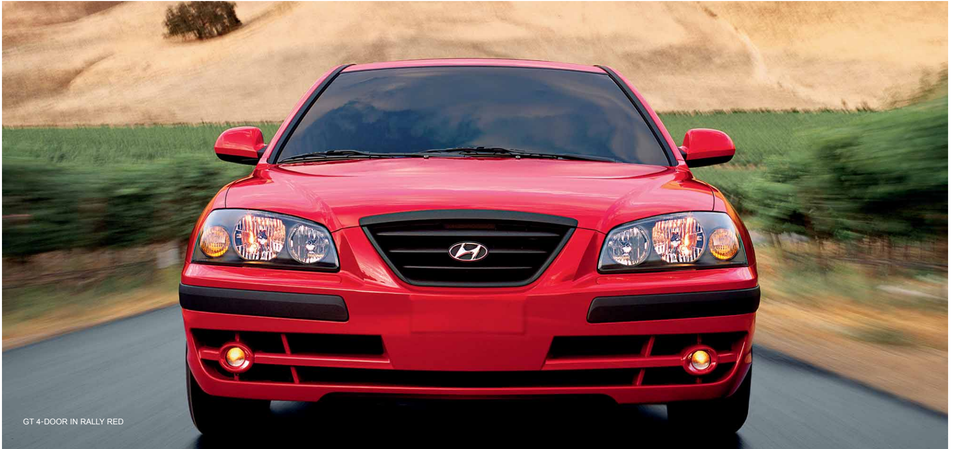
GT 4-DOOR IN RALLY RED