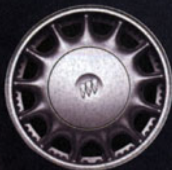
16" Aluminum Wheel (standard on Park Avenue)