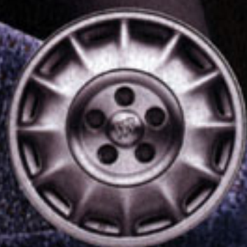
16" Aluminum Wheel (included with optional Grand Touring Package)