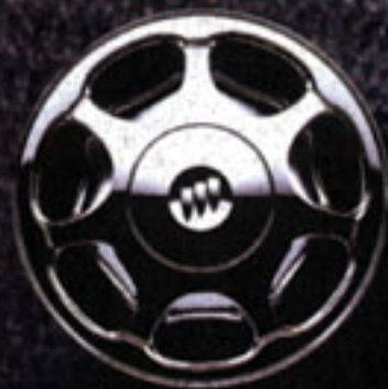
16" Chrome-Plated Wheel (optional on Park Avenue and Ultra)