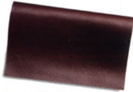
Bordeaux Red Leather