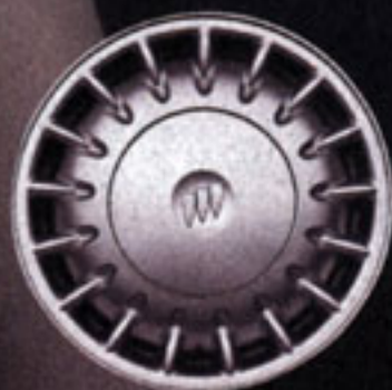
16" Aluminum Wheel (standard on Ultra)