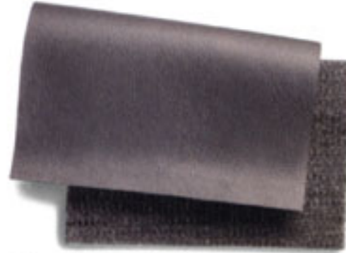
Medium Gray Leather/Cloth