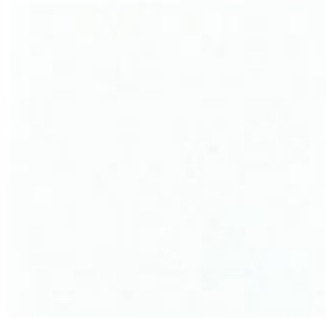
Bright White Diamond Tri-Coat (78)*