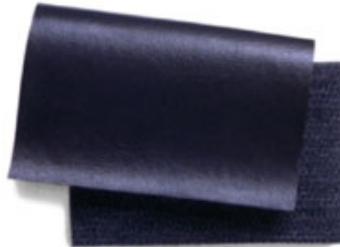
Medium Blue Leather/Cloth