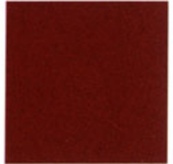
Santa Fe Red Pearl (53)