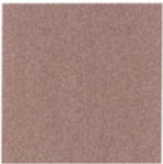
Platinum Beige Metallic (83)