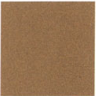
Gold Firemist (60)