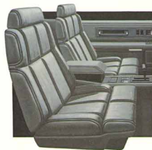
Riviera Cloth or Leather and Suede Bucket Seats with Lumbar Supports (Extra cost)