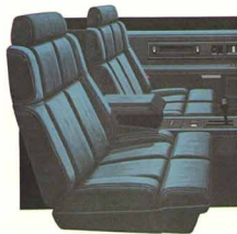
Riviera Cloth Bucket Seats