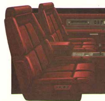
Riviera T Type Reversible Leather or Cloth Power Comfort Seats