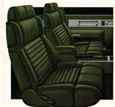
Skylark Limited Sage Cloth Reclining Front Bucket Seats