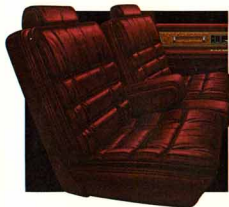
Park Avenue Black Cherry Sierra-Grain Leather 55/45 Notchback Seats (Extra Cost)