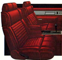
Somerset Limited Red Sierra-Grain Leather Reclining Front Bucket Seats (Extra Cost)