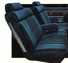
LeSabre Estate Wagon Blue Cloth 55/45 Notchback Seats (Extra Cost)

Buick Motor Division, General Motors Corporation, reserves the right to make changes at any time, without notice, in prices, colors, materials, equipment, specifications, and models; and also to discontinue models.