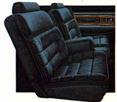
LeSabre Limited Blue Cloth 55/45 Notchback Seats