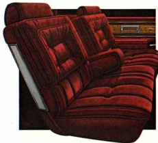
Regal Limited Dark Red Cloth 55/45 Notchback Seats