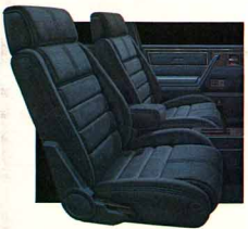
Skyhawk Limited Blue Cloth Reclining Front Bucket Seats