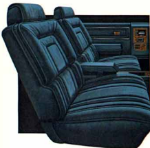
Century Limited Blue Cloth 45/45 Seats (Extra Cost)