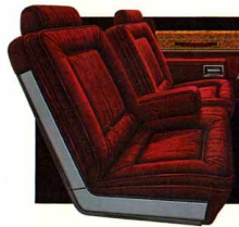
Electra Estate Wagon Dark Red Cloth 55/45 Notchback Seats