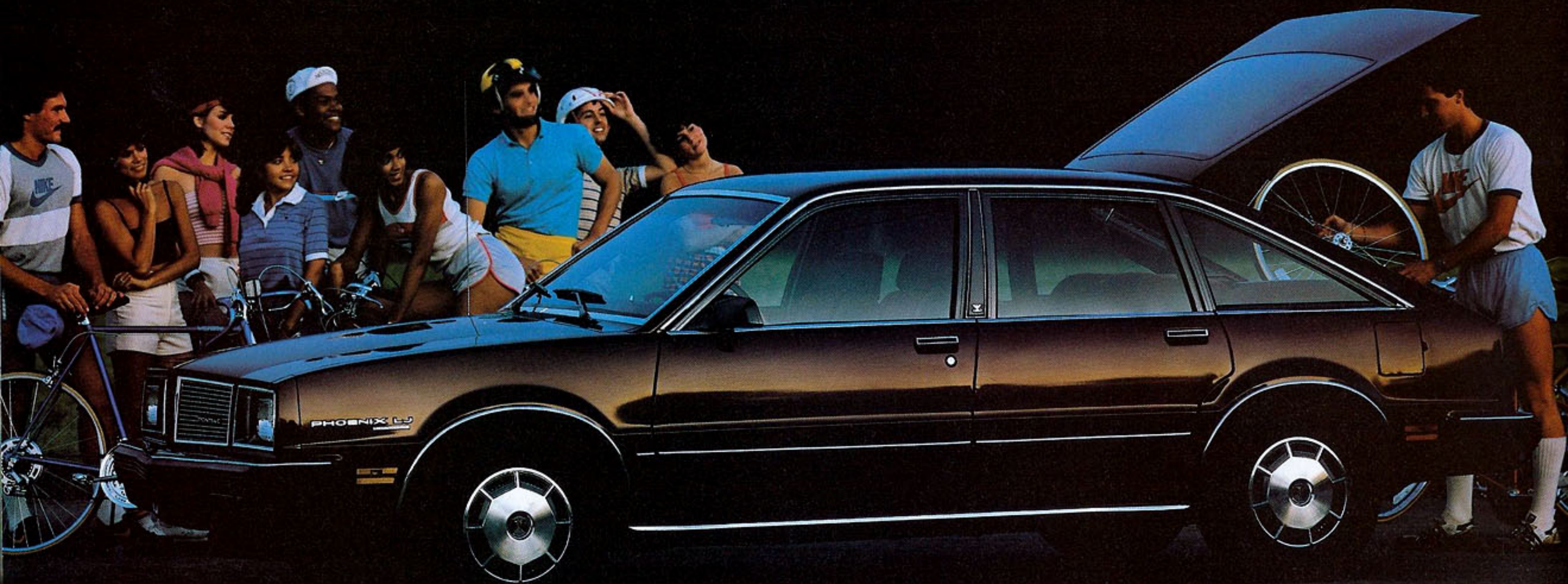
Phoenix LJ 5-door Hatchback.

PHOENIX LJ. For compact versatility, look into Phoenix LJ Hatchback. With the rear seat folded down, you'll find 41 cubic feet of cargo space. And thanks to the removable cargo cover, valuables stay hidden from curious eyes.