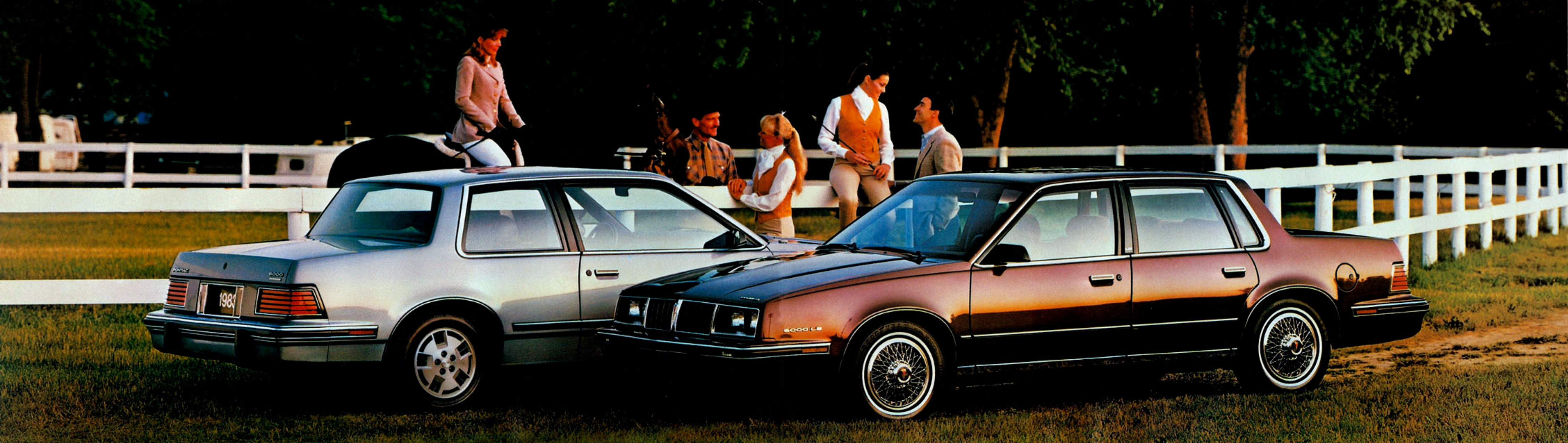
Pontiac 6000 Coupe

PONTIAC 6000. In just one year, Pontiac 6000 has established itself as one of the most exciting new cars in Pontiac's history.