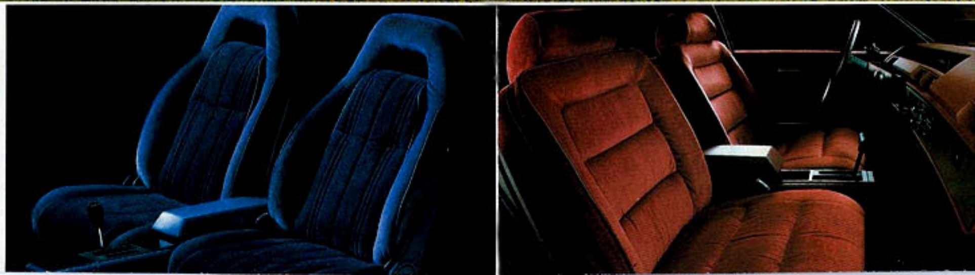
Available bucket seats and console for Pontiac 6000

available 4.3 litre V-6 diesel, offer the practical performance you need everyday. But for an extra kick, order the available 2.8 litre V-6.