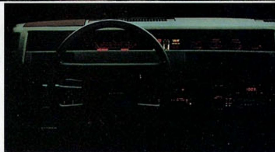
Pontiac 6000 STE instrument panel

The result is nothing short of a driving sensation. Its steering is impeccably precise, allowing you to exploit its agile reflexes to the fullest. And