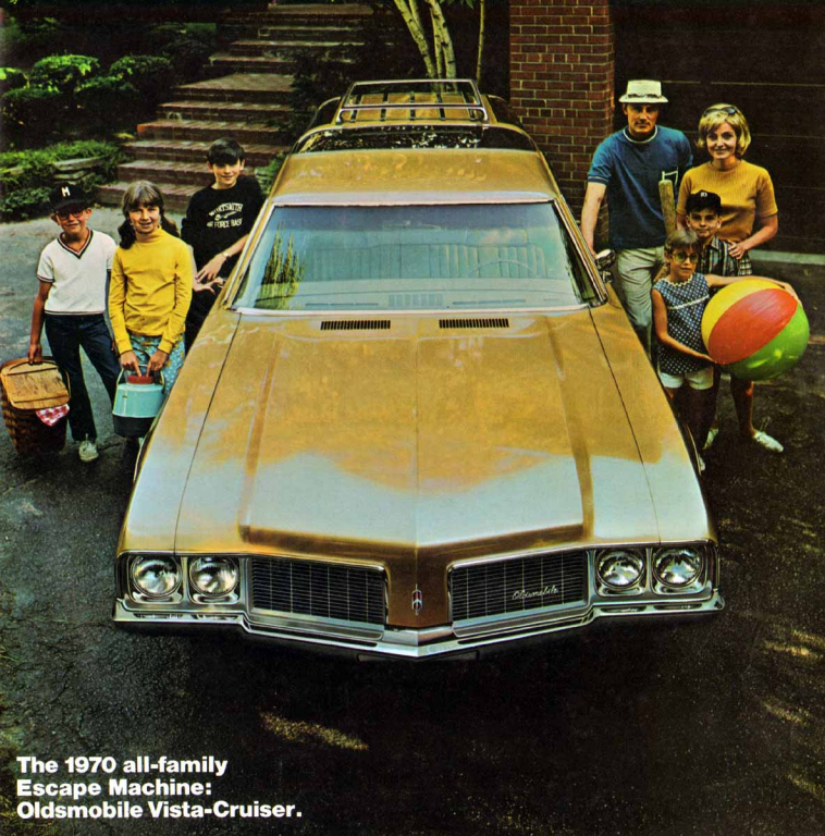
The 1970 all-family Escape Machine: Oldsmobile Vista-Cruiser.