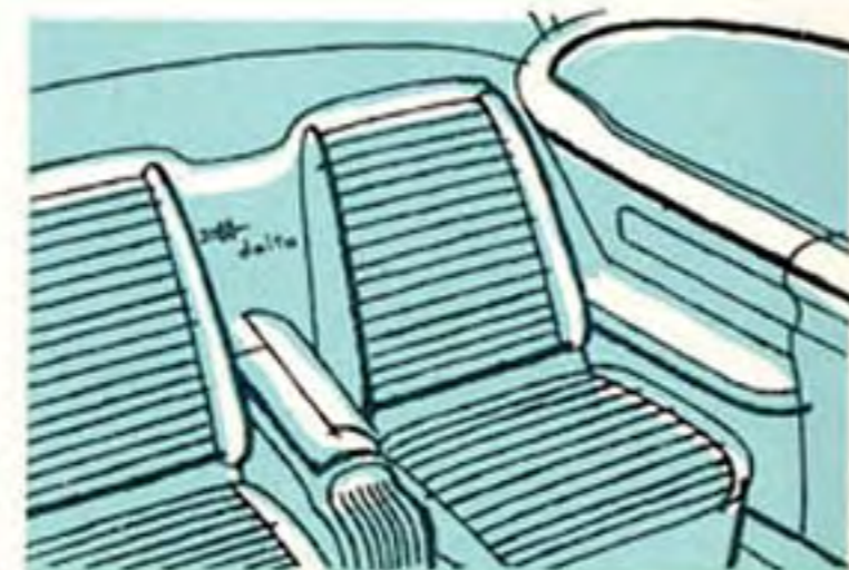
Interior, in tones of blue, has four bucket seats. Rear arm rest contains storage space, window controls.