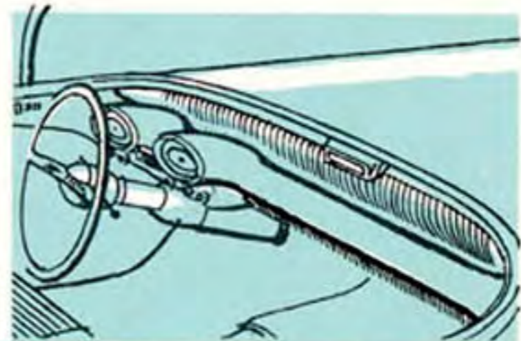
Instruments rest in floating strut; functional air-and-speaker grille is forward and separate.