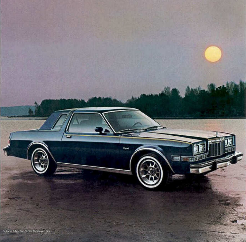
Diplomat S-Type Two-Door is lightweight blue.