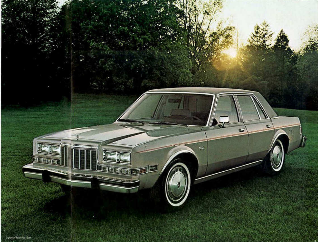
Diplomat Sedan four-door

2. Standard seating in the Diplomat Sedan four-door is this cloth-and-vinyl bench seat with folding center armrest. Optional include, leather, seat or cushions.