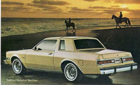
Diplomat Medallion Two-Door

In addition, all Diplomats offer handsomely upholstered seating complemented by a richly accented instrument panel, thick carpeting and standard convenience features. Like power steering, power brakes and an automatic transmission. For a new feel of luxury. To go with our Diplomat's luxurious, new look.