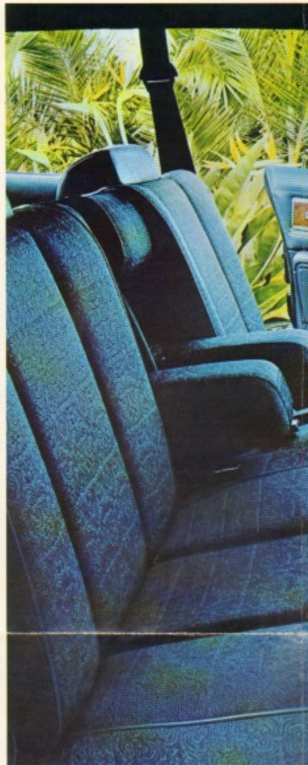
Monaco Brougham's standard interior features a 50/50 divided front vinyl trim. Door panels and dash are highlighted with burlled walnut.