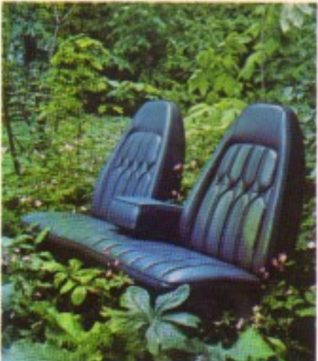
Monaco Custom's optional all-vinyl front bench seat with fold-down center armrest.