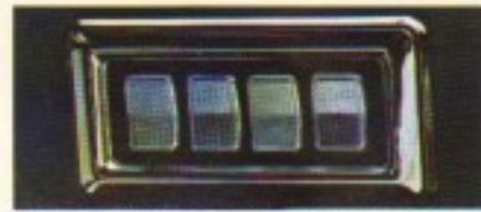
Optional power windows are the ultimate in convenience. All windows can be operated from driver's seat.