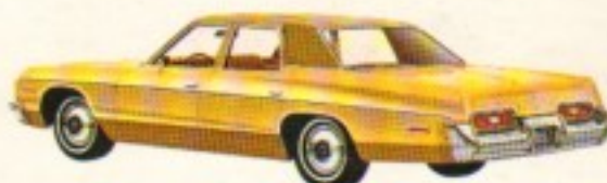
MONACO CUSTOM 4-DOOR SEDAN