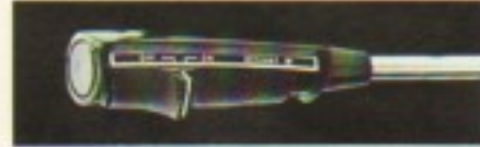
Optional automatic speed control maintains the highway speed you select. Control disengages with a touch of the brake, resumes at a flick of a switch.