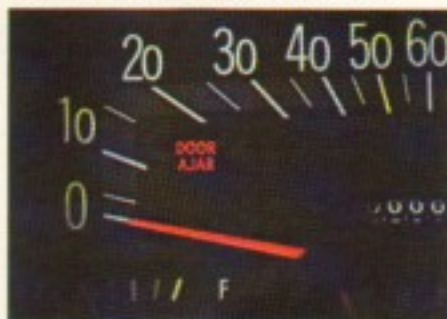
"Door ajar" warning light, optional on all Monacos.