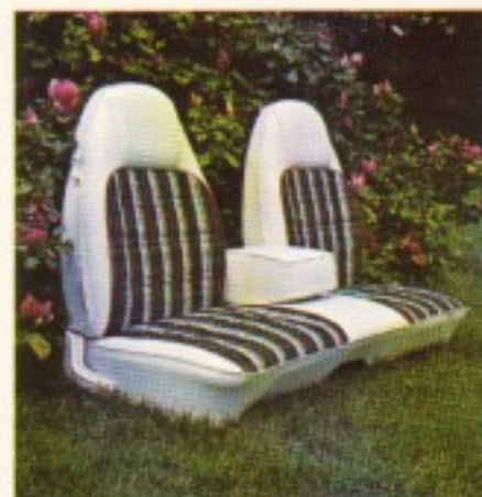
"Sport" plaid center armrest seat, optional on Monaco Custom.