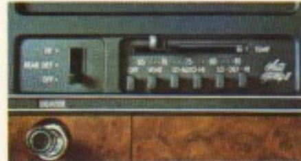
The Auto Temp II air-conditioning option automatically maintains the temperature that you select.