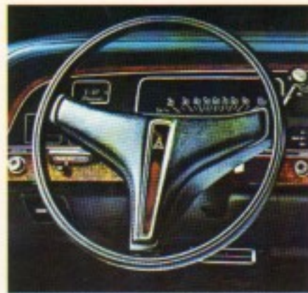
The instrument panel in all Monaco models is of an advanced modular design.