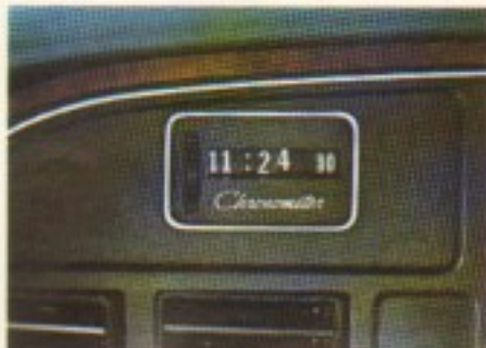
Electronic digital clock (optional) is easy to read and accurate to within a minute a month.