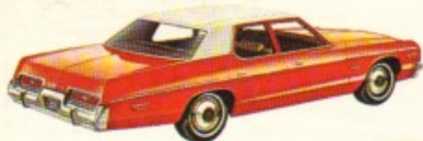
MONACO 4-DOOR SEDAN