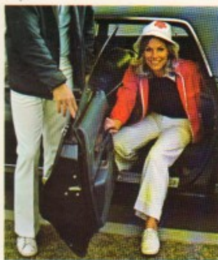
Ease of entry by the rear door has been improved on all four-door Monaco models.