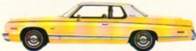
MONACO BROUGHAM 2-DOOR HARDTOP