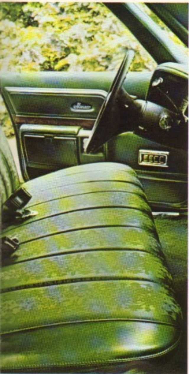
Standard cloth-and-vinyl trim. A handy hideaway storage compartment