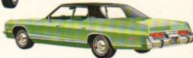
MONACO BROUGHAM 4-DOOR HARDTOP