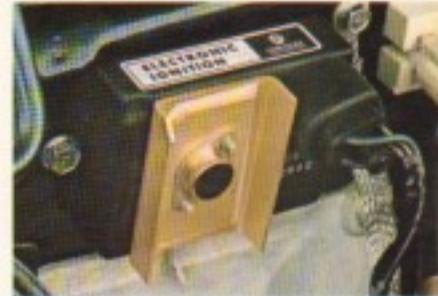
Electronic Ignition is standard on all American-made Dodges again this year. Your Dealer will be happy to explain the many advantages of this dependable automotive advancement.