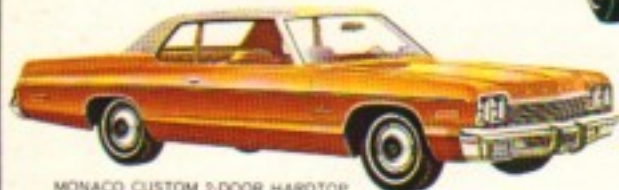
MONACO CUSTOM 2-DOOR HARDTOP