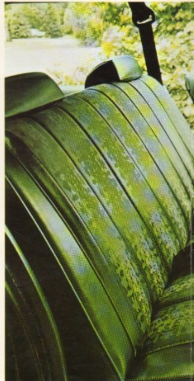
The Monaco Custom interior is handsomely accented with Desmon built into the driver's door is standard on all Monacos this year.