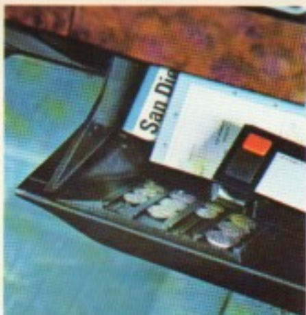
Standard this year in all Monacos is this handy coin holder which has been moulded into the glove box. Nice.