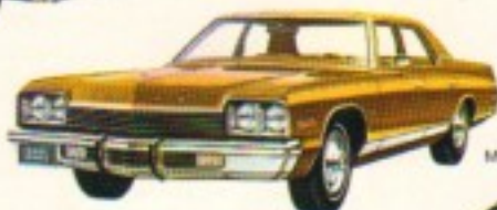
MONACO BROUGHAM 4-DOOR SEDAN