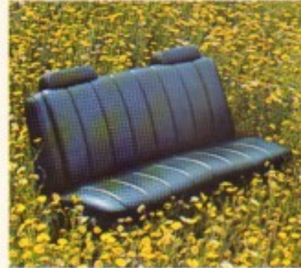
Monaco's optional all-vinyl front bench seat. It is beautiful yet durable. Carpeting, front and rear, is standard on all Monaco models.