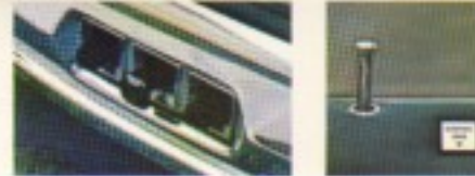
Optional power seats and optional power door locks.