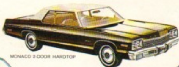
MONACO 2-DOOR HARDTOP