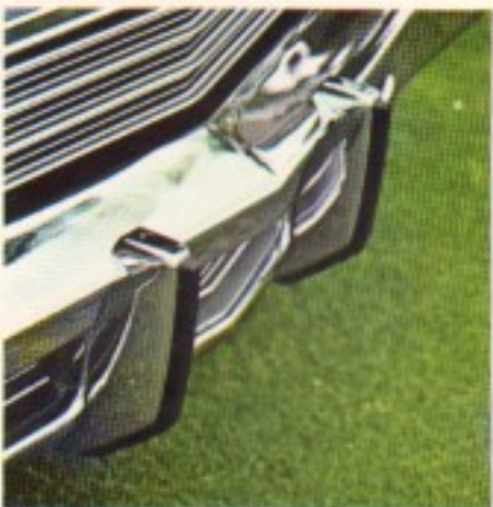
Optional bumper guards give an extra measure of protection. Integrated design adds a nice styling touch.