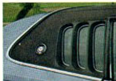
The louvered look of luxury quietly announces Charger SE.

UNIBODY CONSTRUCTION —The body panels and structural members on all Dodges are fused into one unit by more than 4,000 tough welds for strength and durability.