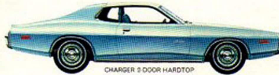
CHARGER 2-DOOR HARDTOP