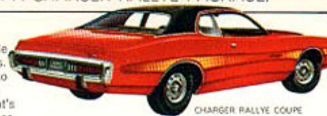
CHARGER RALLYE COUPE

The Charger Rallye Package, available on all V8 Charger coupes and hardtops. The perfect option for those who like to stand apart from the rest of the pack. For the man in command, here's what's included: • Black body side tape stripes • Power bulge hood • Hood tie-down pins • Rear sway bars • G70 x 14 tires with raised white letters • Rallye instrument cluster with speedometer, ammeter, and oil, temperature, and fuel gauges • 318 2-bbl. V8 engine. (Larger engines available at extra cost.) Have we tickled your ego yet? See your Dodge Dealer for complete details on the '74 Rallye Package.