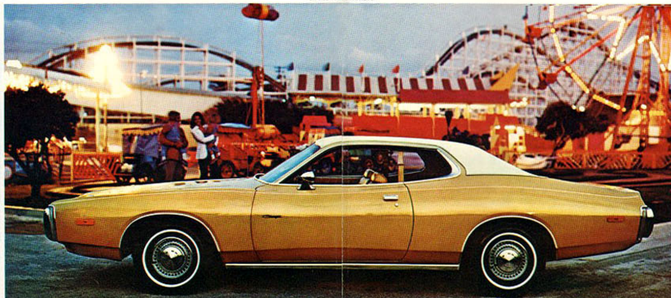
CHARGER 2-DOOR HARDTOP