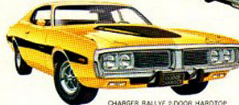
CHARGER RALLYE 2-DOOR HARDTOP