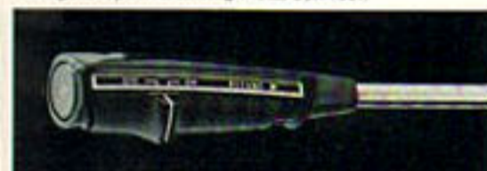
Optional automatic speed control for long-distance cruising automatically maintains the speed you select.