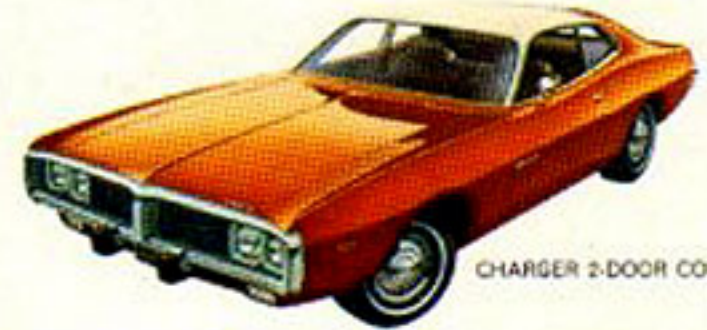
CHARGER 2-DOOR COUPE