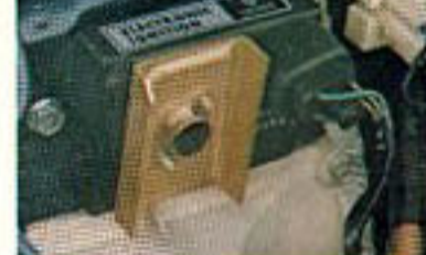
Charger's standard Electronic Ignition for more starting voltage, less maintenance than conventional systems.