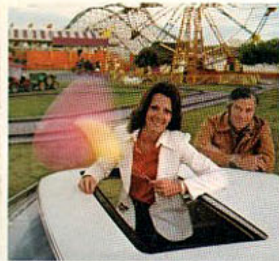
For the fresh air feeling of a convertible, order Charger's optional sliding metal sun roof.