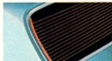
Optional heated rear-window defroster gives ice the brush-off... electrically.