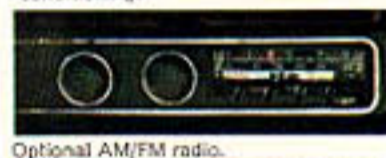
Optional AM/FM radio.