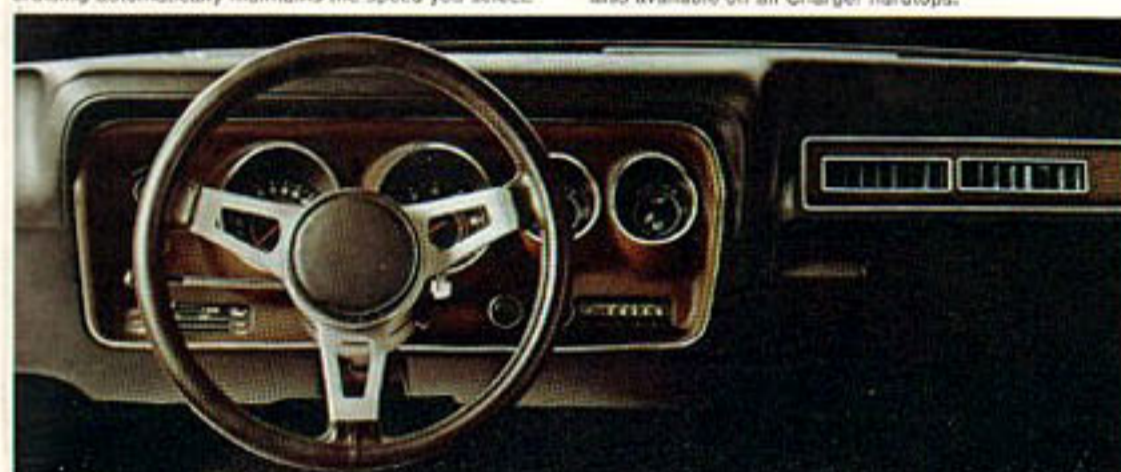
Charger's Rallye instrument cluster tells it like it is. Standard on SE and part of the optional Rallye Package on other models.