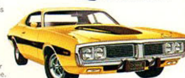
CHARGER RALLYE HARDTOP