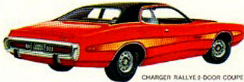
CHARGER RALLYE 2-DOOR COUPE