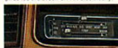
"Cool it" with Charger's optional air conditioning.