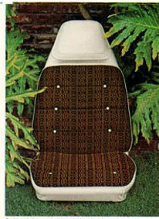
Optional Aztec cloth-and-vinyl bucket seats come with plush gold shag carpeting. Aztec bench seat also available on all Charger hardtops.