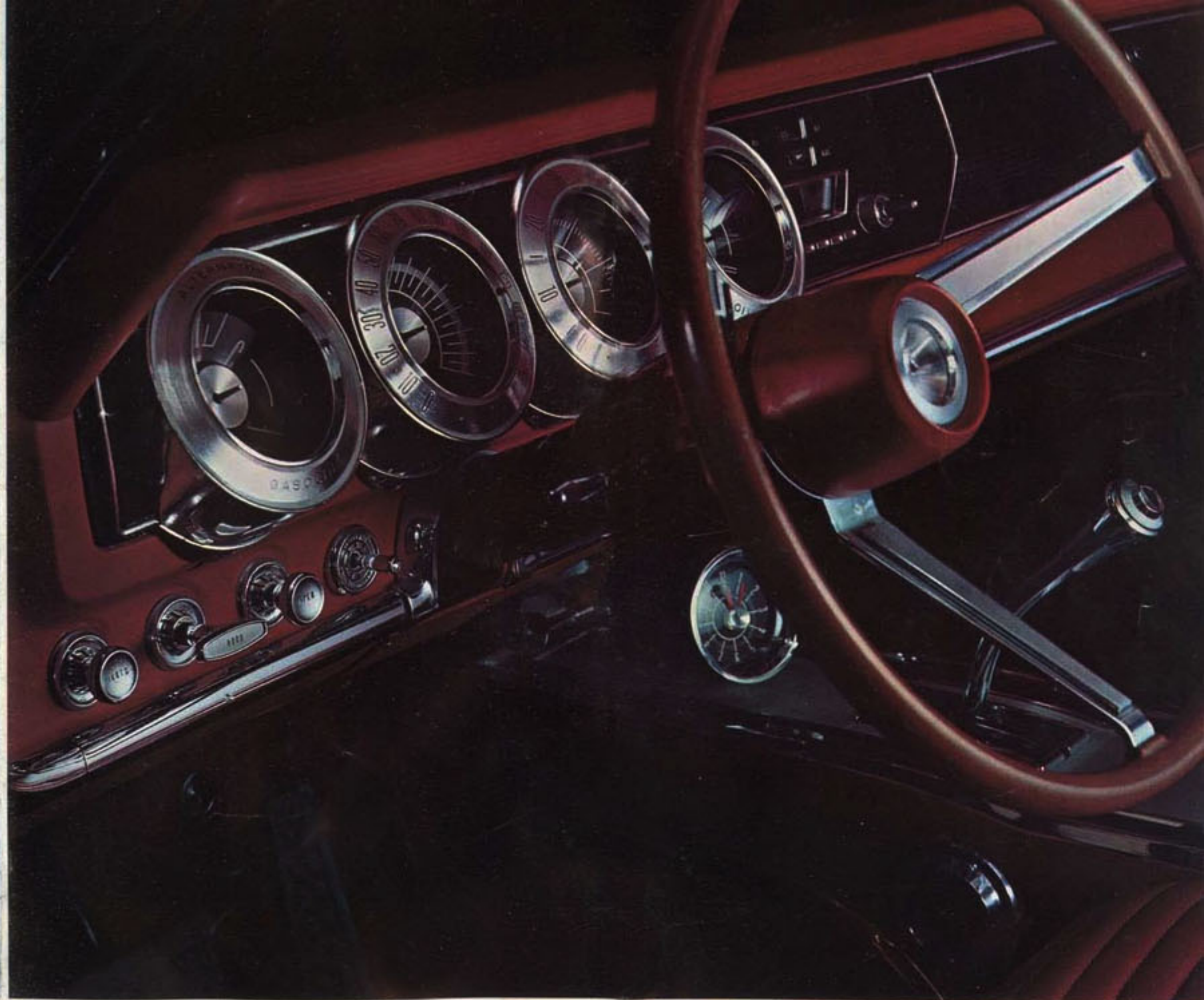
TACHOMETER ON THE CONSOLE? No. Our tach is up at eye level, on the dash, where it should be. And where every real road car has it. Put a 3-speed automatic* or 4-speed manual* on the console together with one of Charger's four V8's (from 318 cu. in. up to 426 Hem*). Then turn up the wick, and you're gone, man, gone.