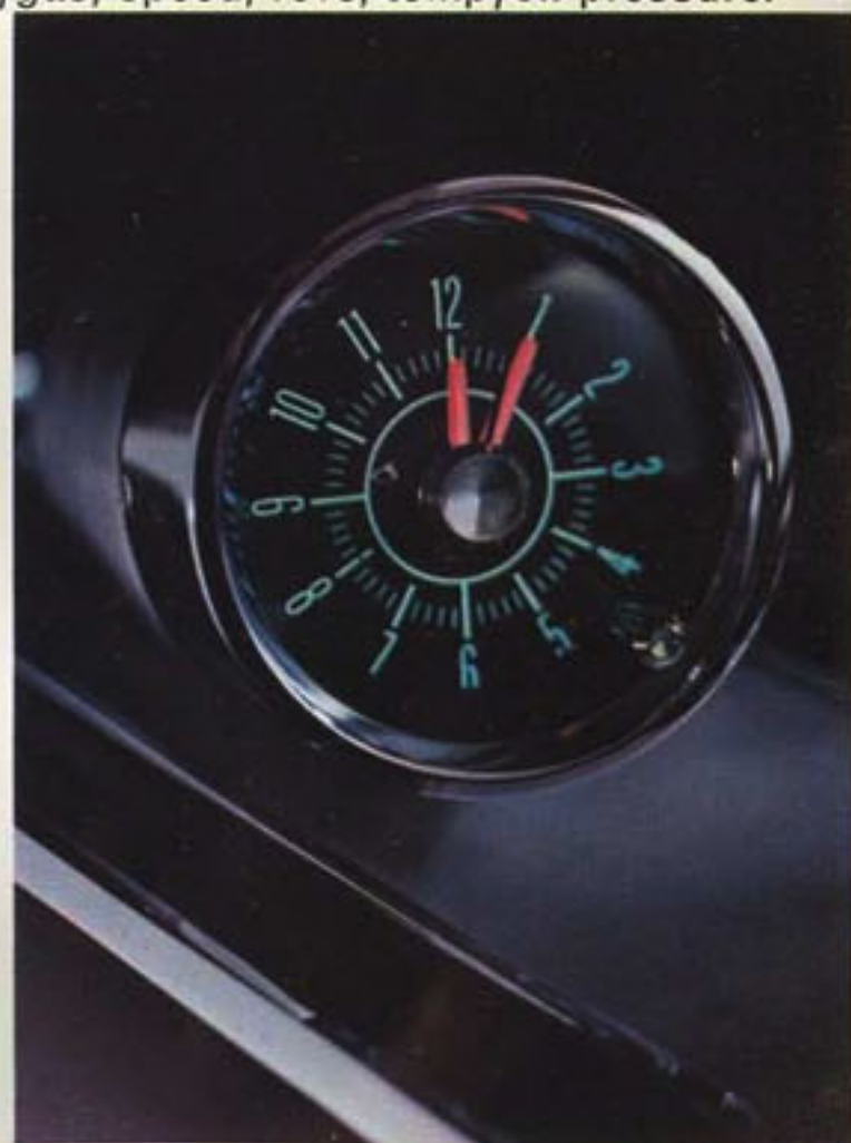
UNIQUE. Console-located electric clock.* All passengers can see it with equal ease.