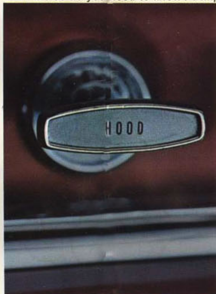
BAFFLE service station attendants. Amaze your friends! Keep your hood closed until you want it open.