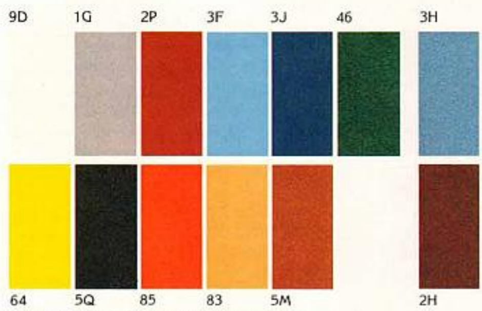
Colors shown here are a printed representation. For accurate color selection, see your Lincoln-Mercury dealer.