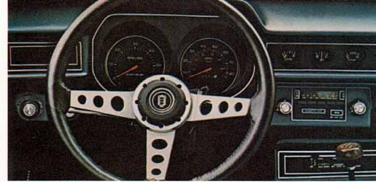
Bobcat optional Sports Accent Group w/Sports Instrumentation (See page 7 for detail)

Check Bobcat's new vertical grille, its new power dome hood, and don't overlook its rectangular headlamps and parking lamps. Inside, Bobcat has a new instrument panel. We think you'll agree that Bobcat's a sporty cat, and a value cat with rack-and-pinion steering, AM radio, tinted glass, styled steel wheels with trim rings and steel-belted radial tires, all standard. (The AM radio may be deleted for credit.)