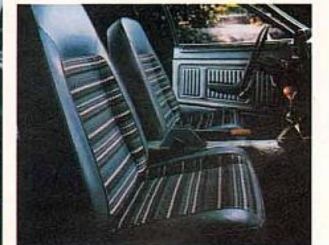
Standard bucket seats in optional Kirsten cloth