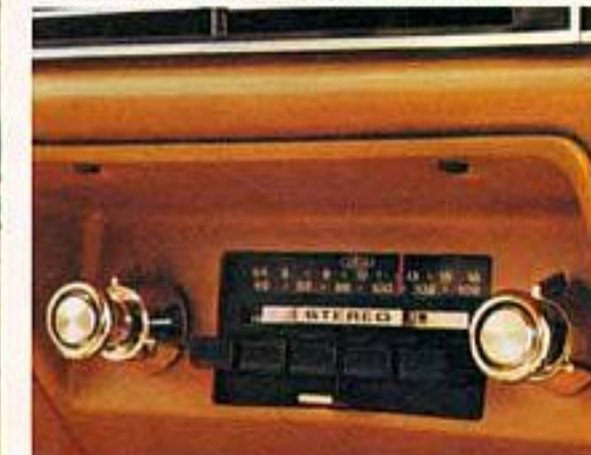
Optional AM/FM stereo radio