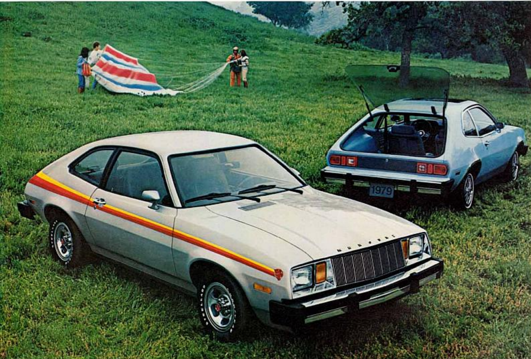
Mercury Bobcat Runabout w/Sports Package Option (foreground) and Runabout w/Sports Accent Group