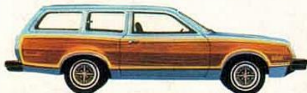
1979 Mercury Bobcat Station Wagon