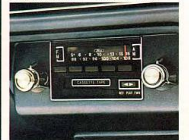
Optional AM/FM radio w/cassette tape

NOTE: Some items are optional. See notable standard features, measurements, and color code reference listed throughout this catalog.