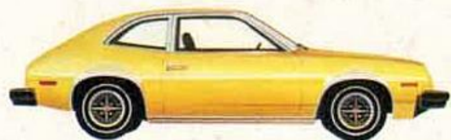
1979 Mercury Bobcat 3-door Runabout

Stagger-mounted shock absorbers. Rear shock absorbers on Bobcat are angle mounted to slant inward to assist control. Large rubber bushings are used in mounting the shocks to help control noise and vibration levels.