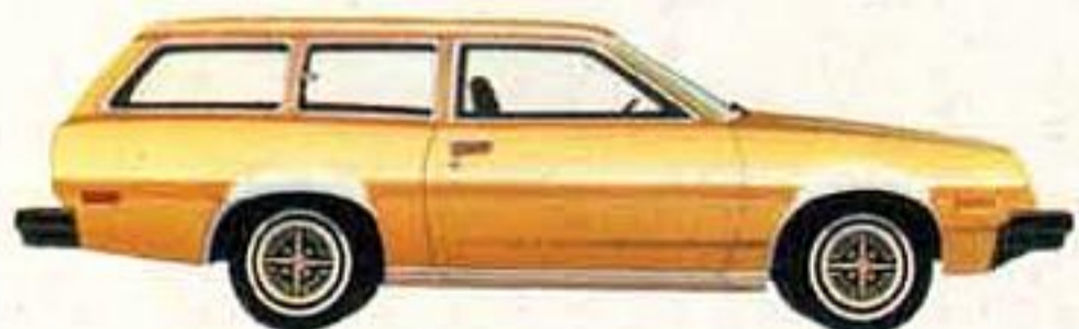
1979 Mercury Bobcat Villager Station Wagon