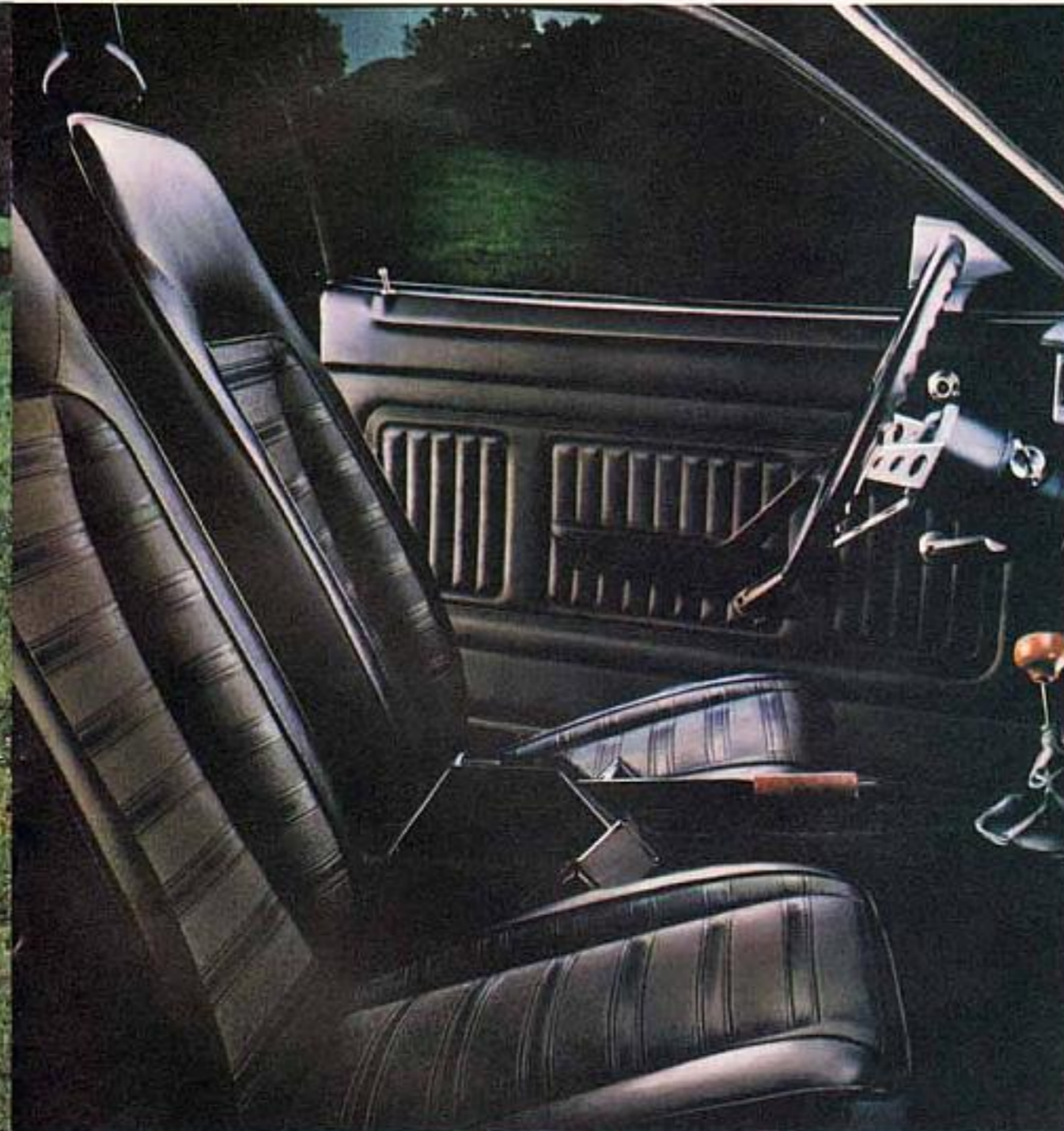
Runabout standard interior in black vinyl