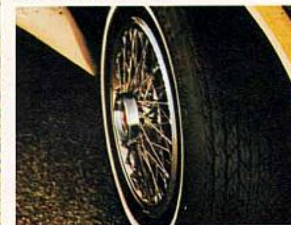
Standard steel-belted radials w/opt. white sidewalls.

Bobcat or Villager Wagon interiors can be tailored to suit your taste. The optional Deluxe Interior Trim is shown left. Its low-back bucket seats in medium red vinyl are also available in black, light blue, tangerine and chamois. With this option you may choose, at no extra charge, Alpine Plaid cloth in tangerine, and available in medium red, light blue and chamois.