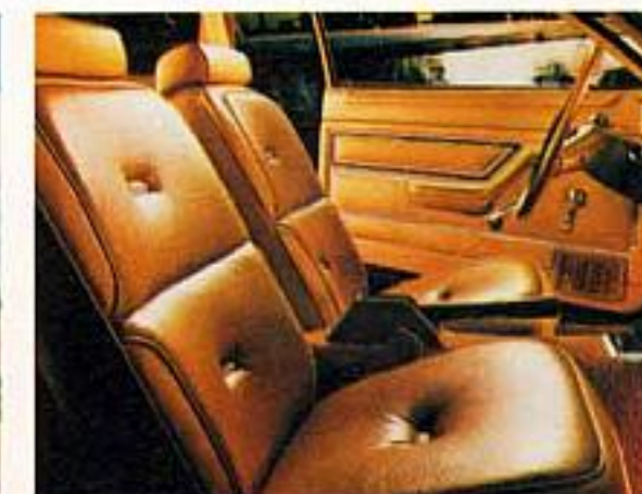
Optional low-back bucket seats in chamois vinyl.