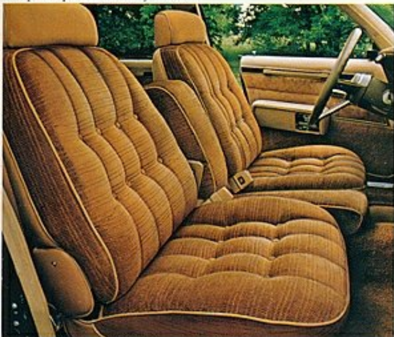
Newport Optional 60/40 Cloth-and-Vinyl Interior

The 1979 Newport is designed with a handsome, roomy interior to help keep you and your passengers content and comfortable even after hours on the highway.