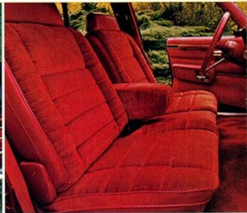
Newport Standard Cloth-and-Vinyl Interior