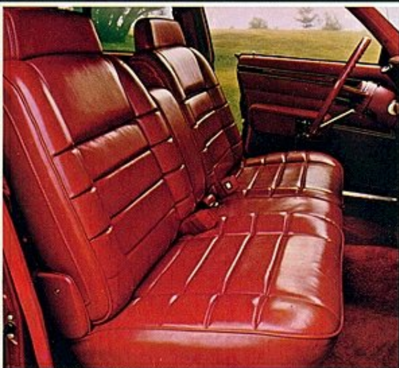
Newport Optional All-Vinyl Interior