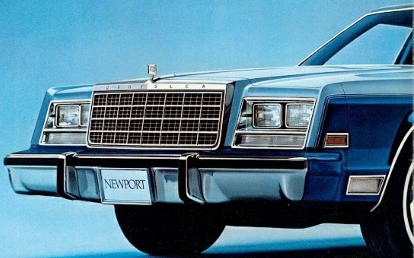
Chrysler Newport 4-Door Pillared Hardtop with Two-Tone Paint Option

With all-new styling that says Chrysler elegance. With a standard 225 six-cylinder engine that's designed for today's needs. With increased corrosion protection due to the broader use of galvanized steel for body panels.