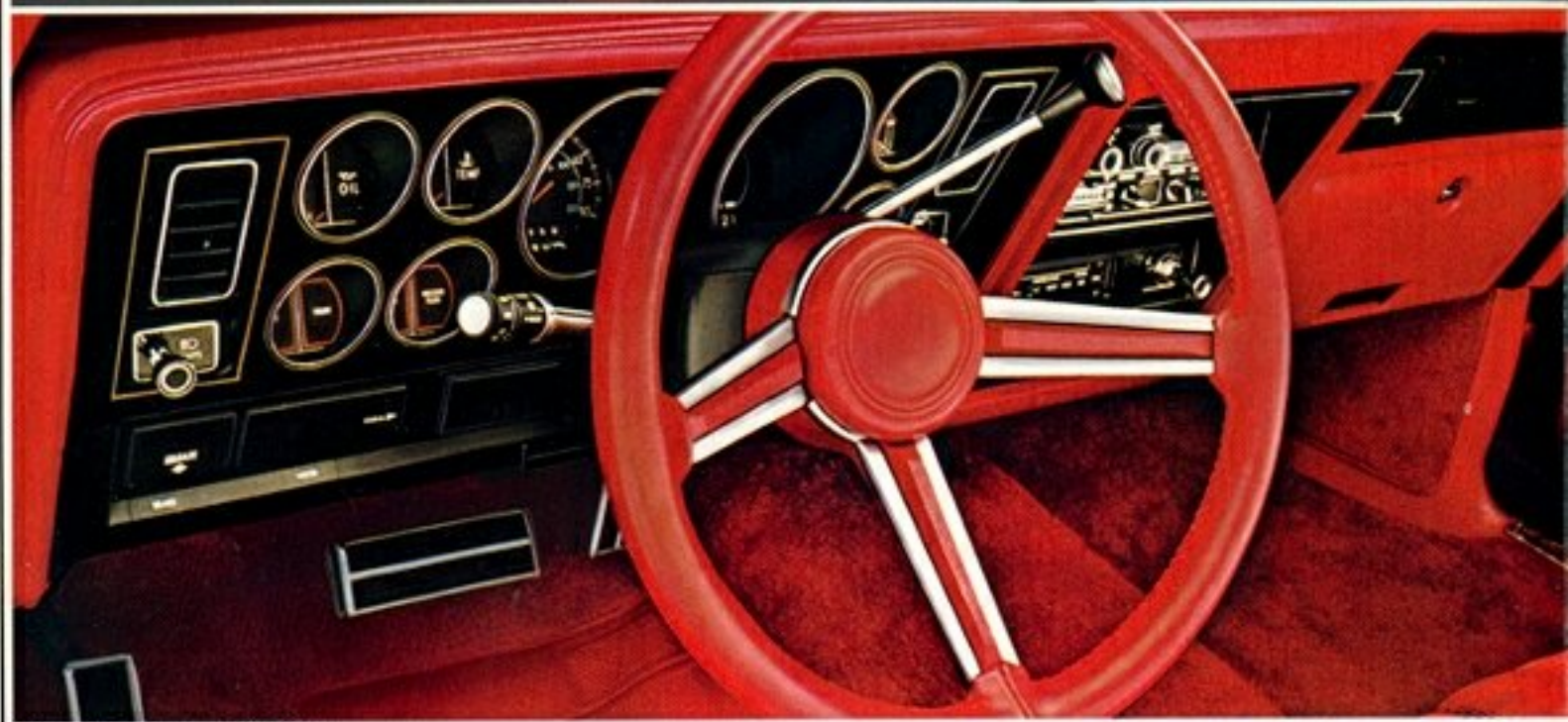
Newport Instrument Panel