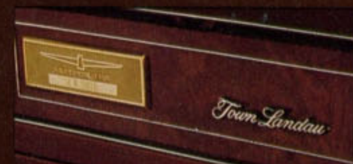
Inside, your own personalized plaque

Like all 1977 Thunderbirds, the Town Landau is an all-new car, a leader in the modern trend toward trimmer, leaner cars. Styling alone makes it stand out from other personal luxury cars. Ford Thunderbird pioneered the formal roofline. The Town Landau's new tiara-band roof with its wide expanse of glass carries on this